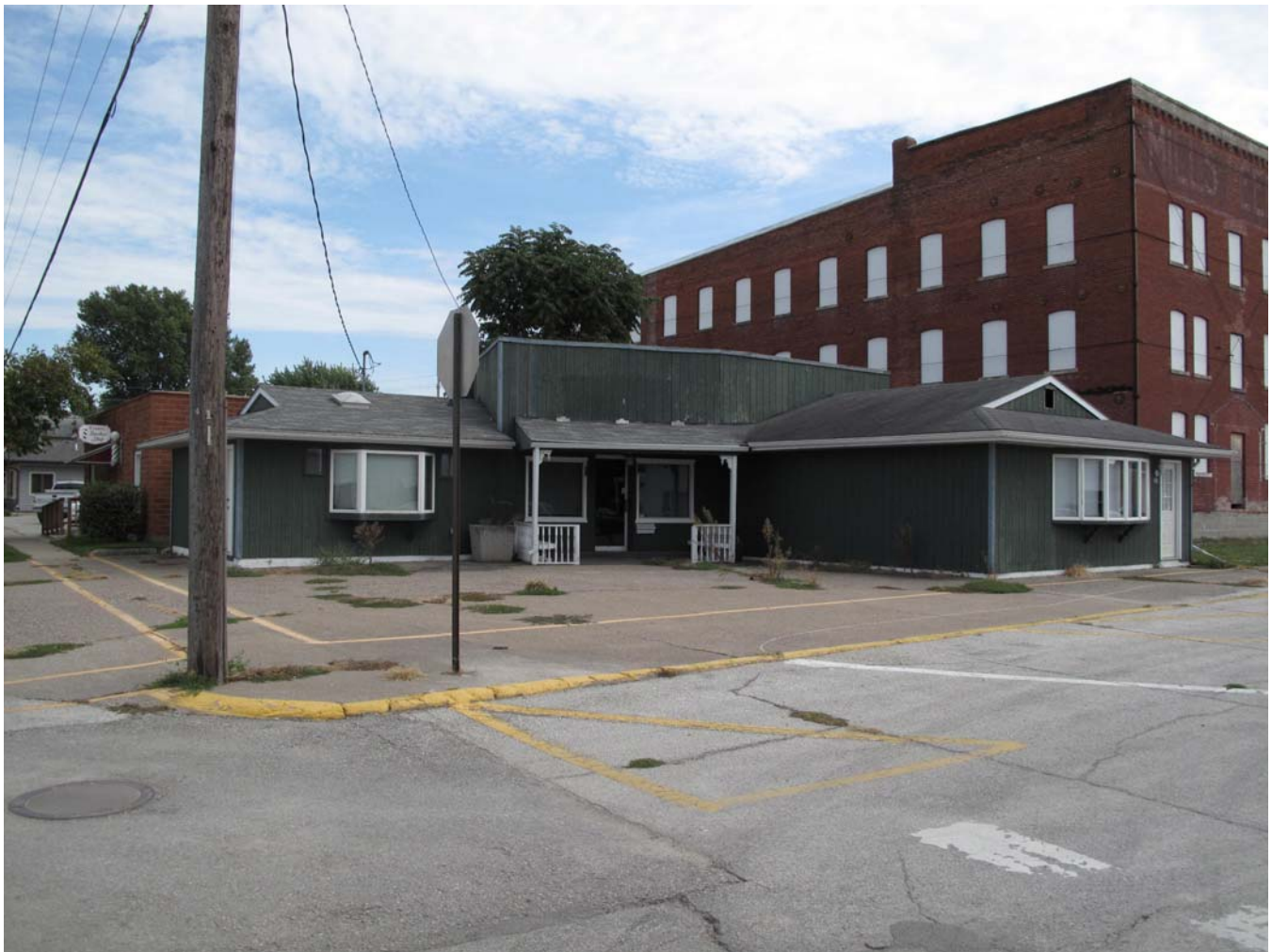
Photograph 92-00507-001 - North and west elevations, looking southeast (, September 20, 2011)