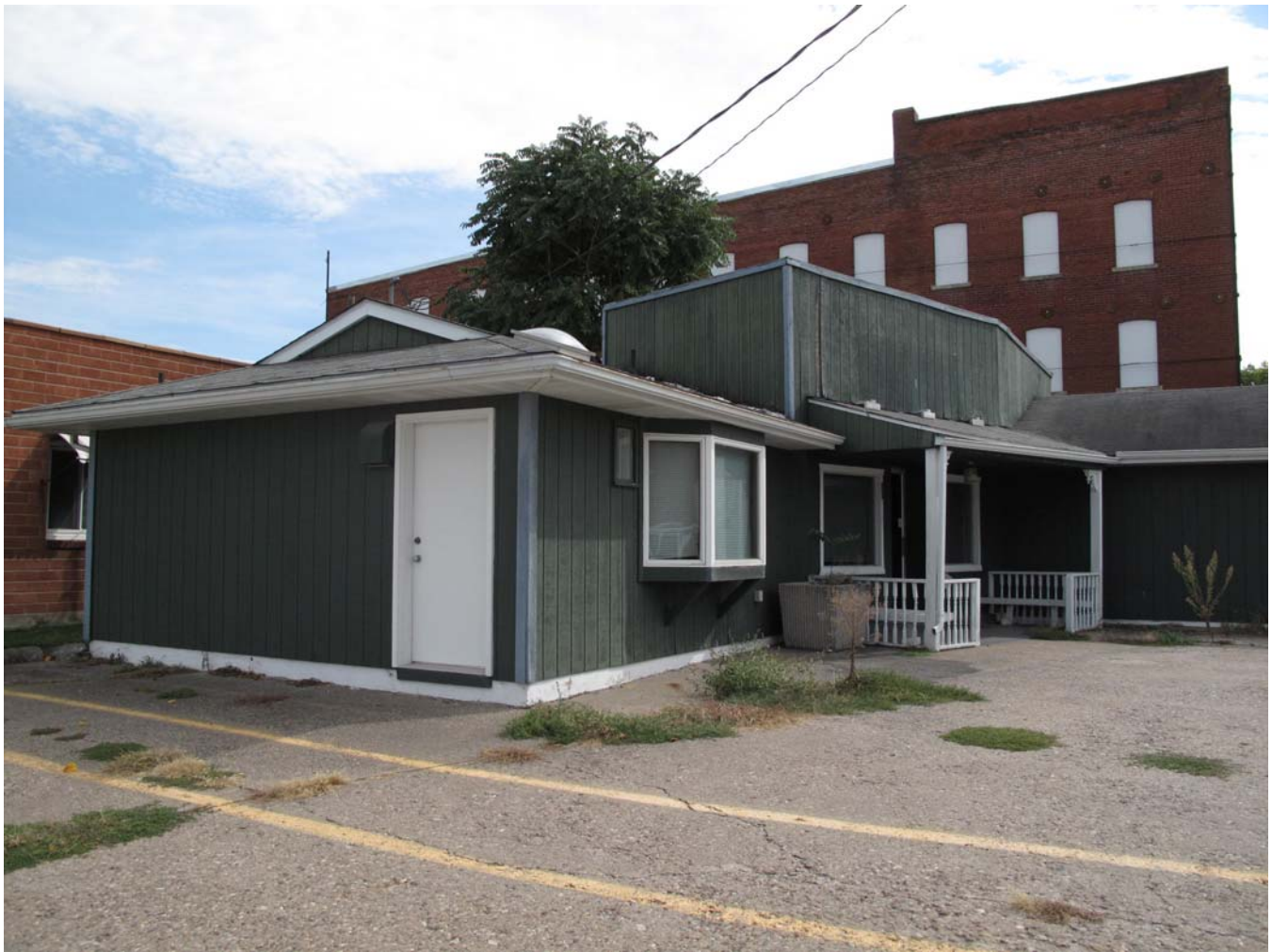
Photograph 92-00507-003 - North and west elevations, looking southeast