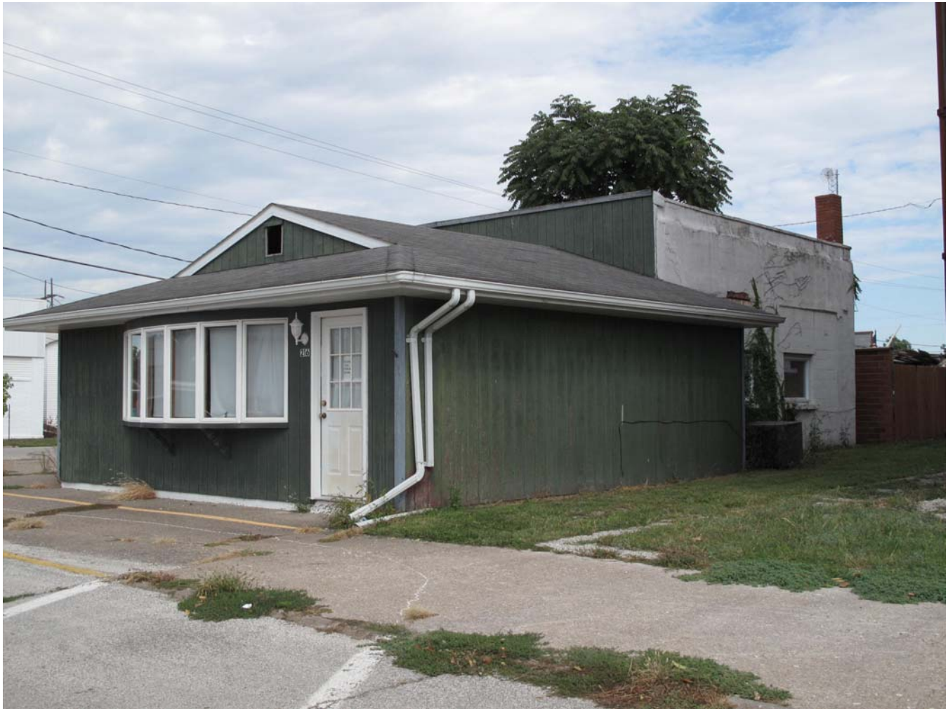
Photograph 92-00507-002 - West and south elevations, looking northeast