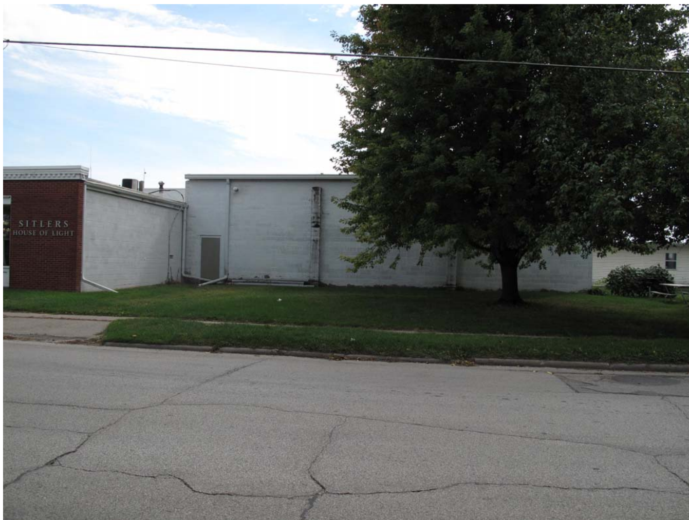
Photograph 92-00591-001 - North elevation, looking south (, September 20, 2011)