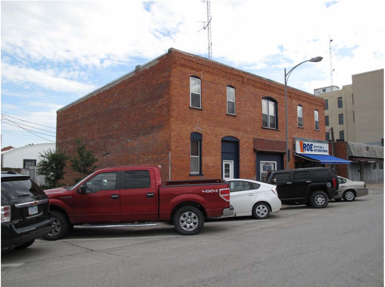
Photograph 92-00501-002 - North and west elevations, looking southeast