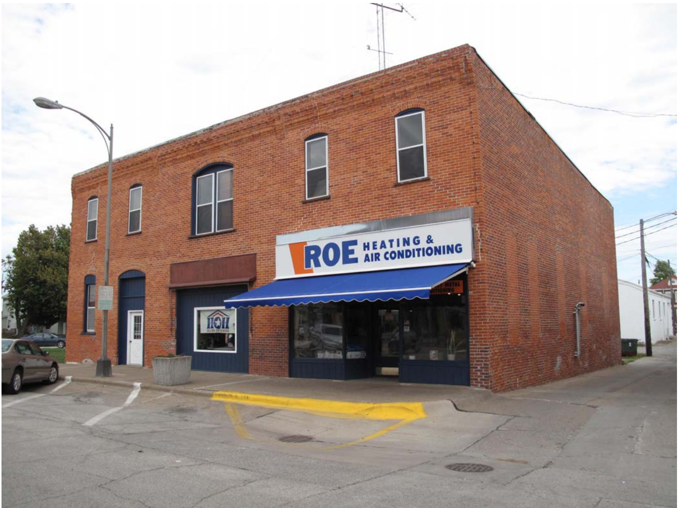
Photograph 92-00501-001 - West and south elevations, looking northeast (, September 20, 2011)