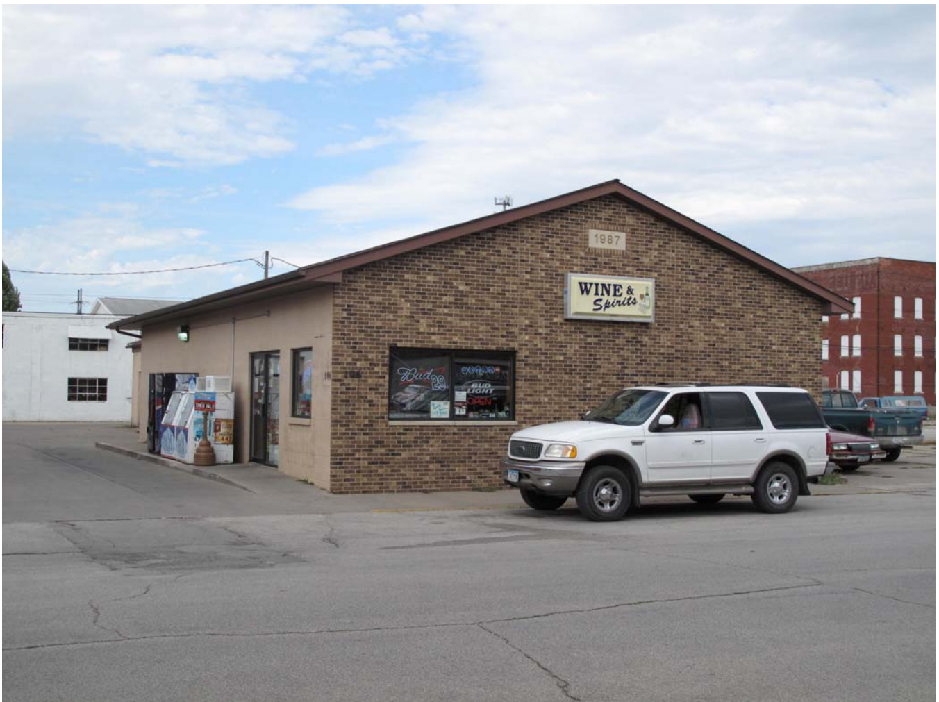
Photograph 92-00580-001 - West and south elevations, looking northeast