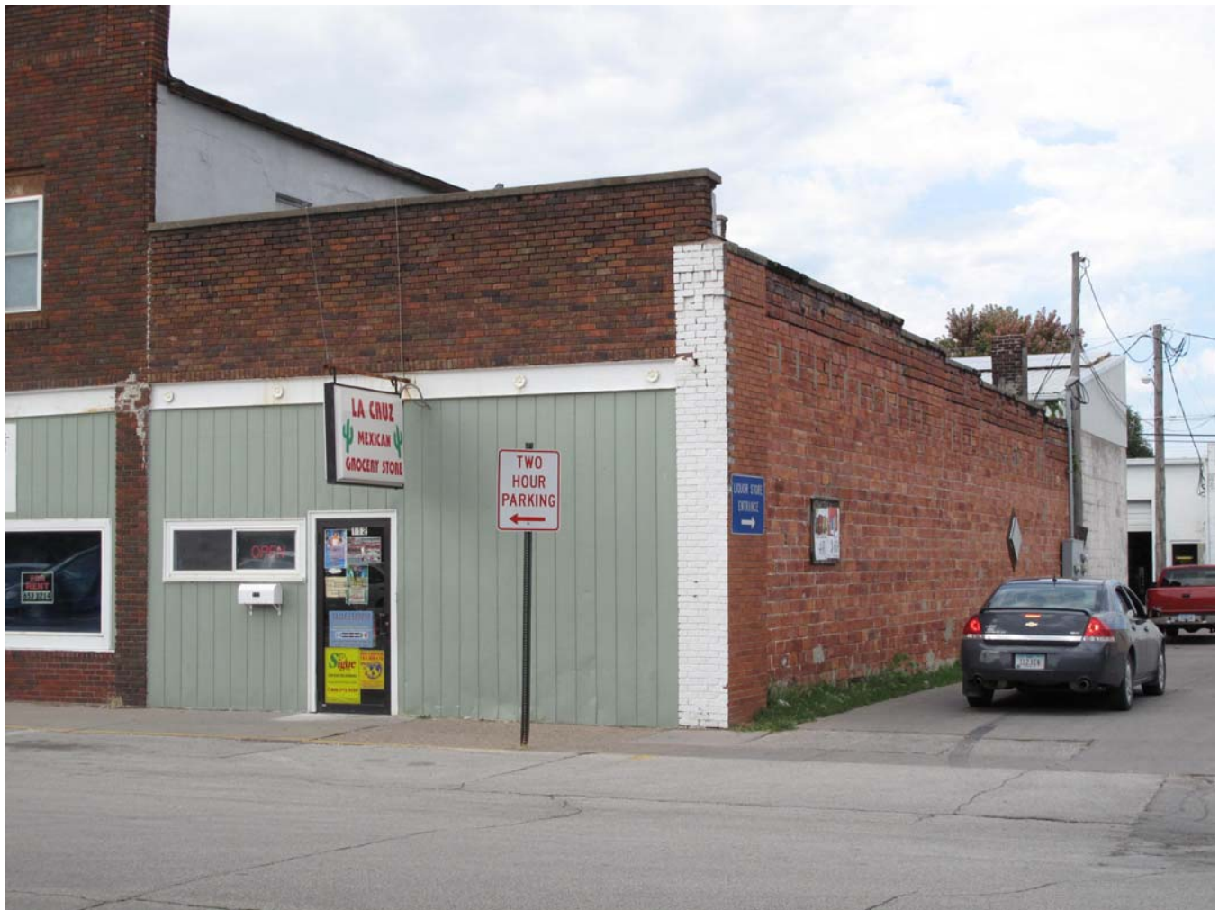
Photograph 92-00583-001 - South and east elevations, looking northwest