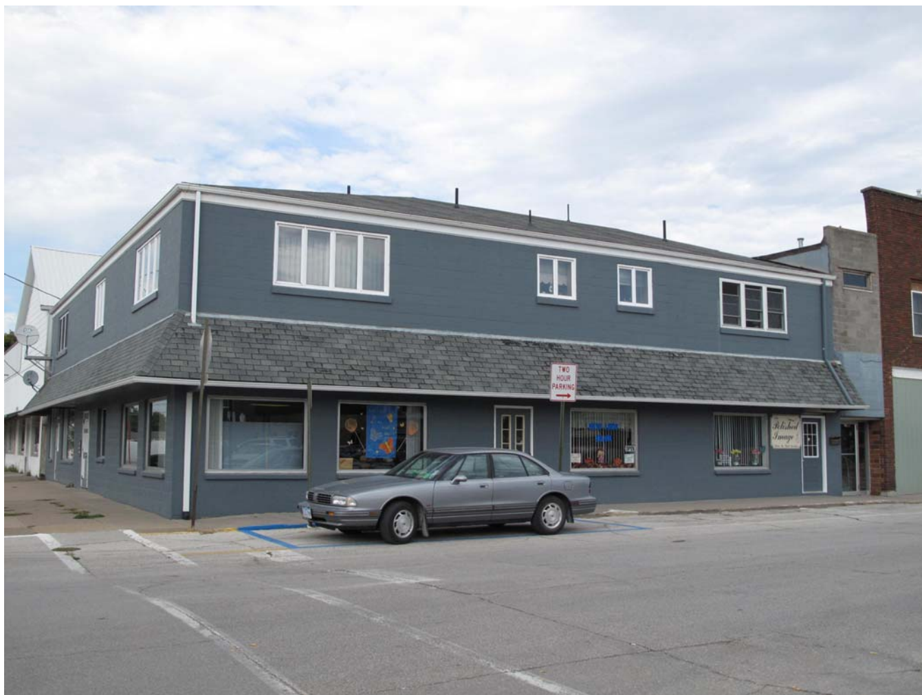
Photograph 92-00586-001 - West and south elevations, looking northeast