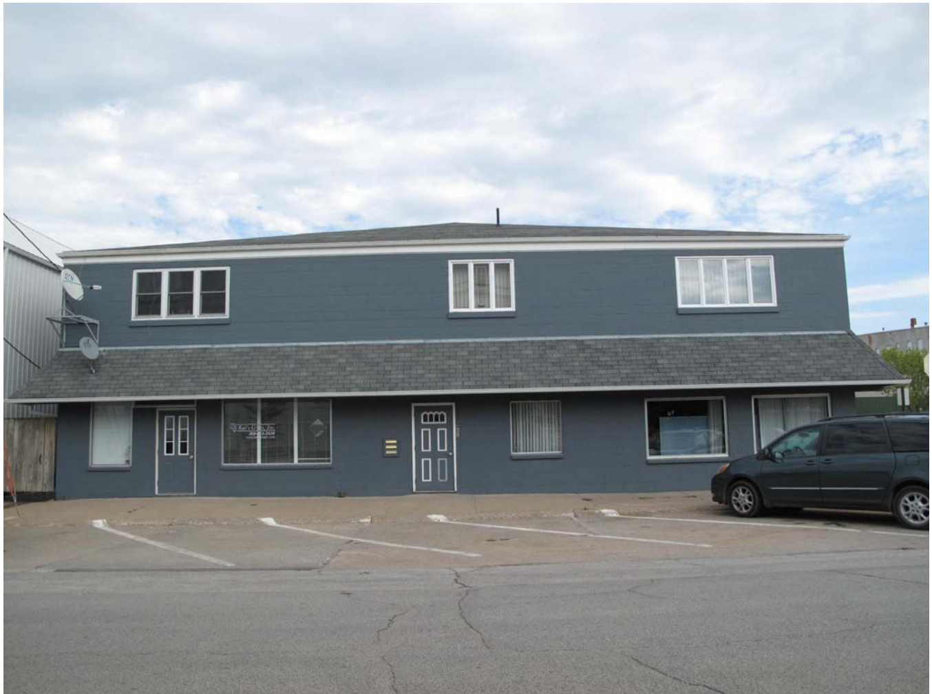
Photograph 92-00586-002 - West and south elevations, looking east