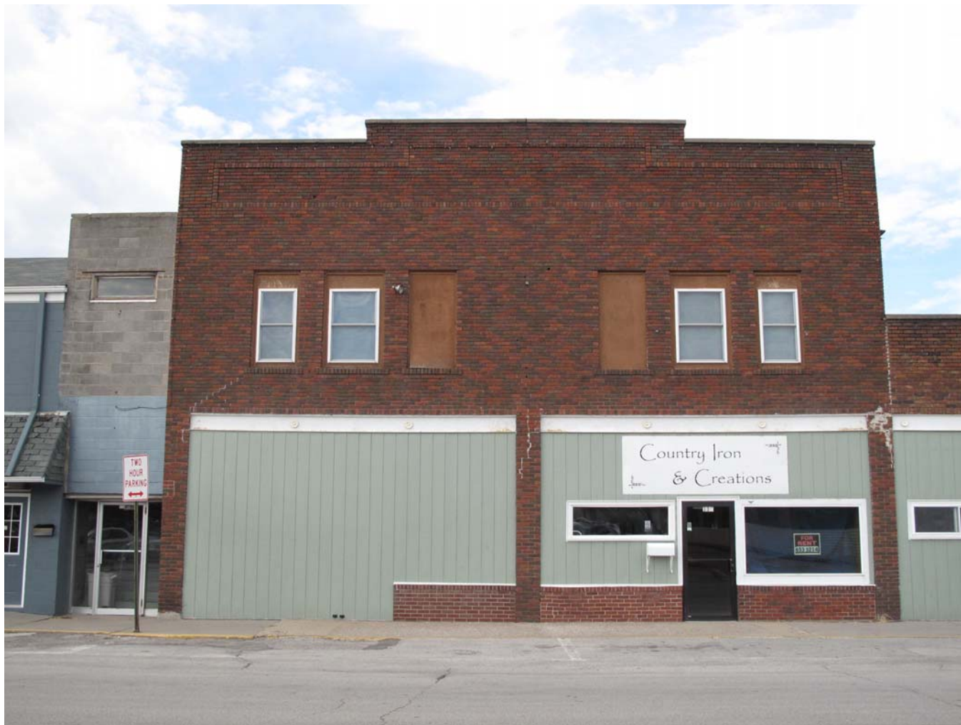
Photograph 92-00582-002 - South facade, looking north (, September 20, 2011)