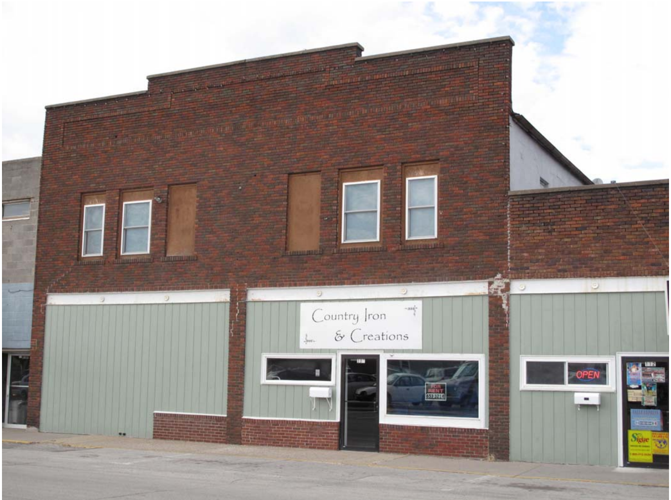
Photograph 92-00582-001 - South facade, looking northwest