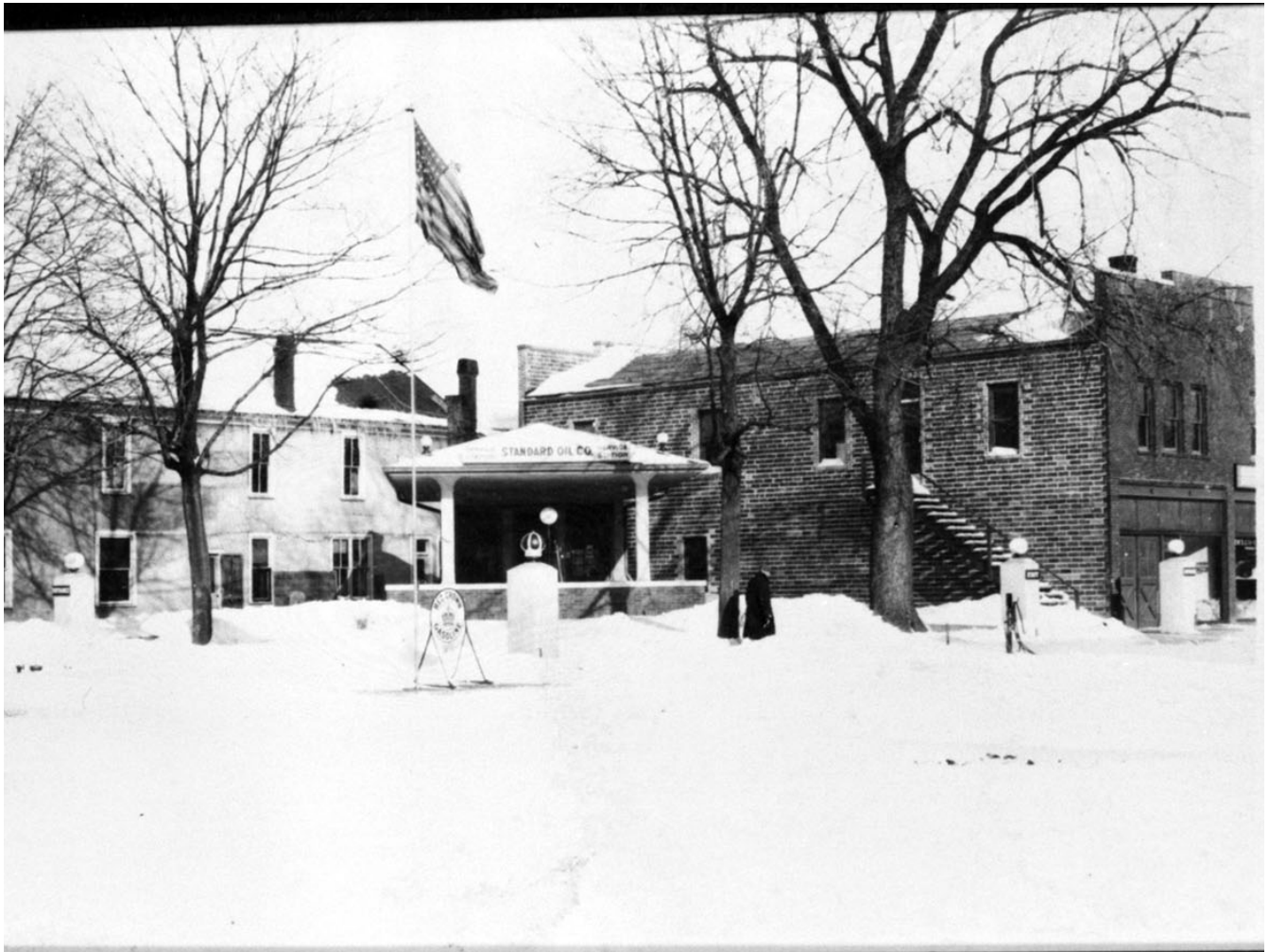
Northwest corner of 2nd Street and Marion Ave around 1920