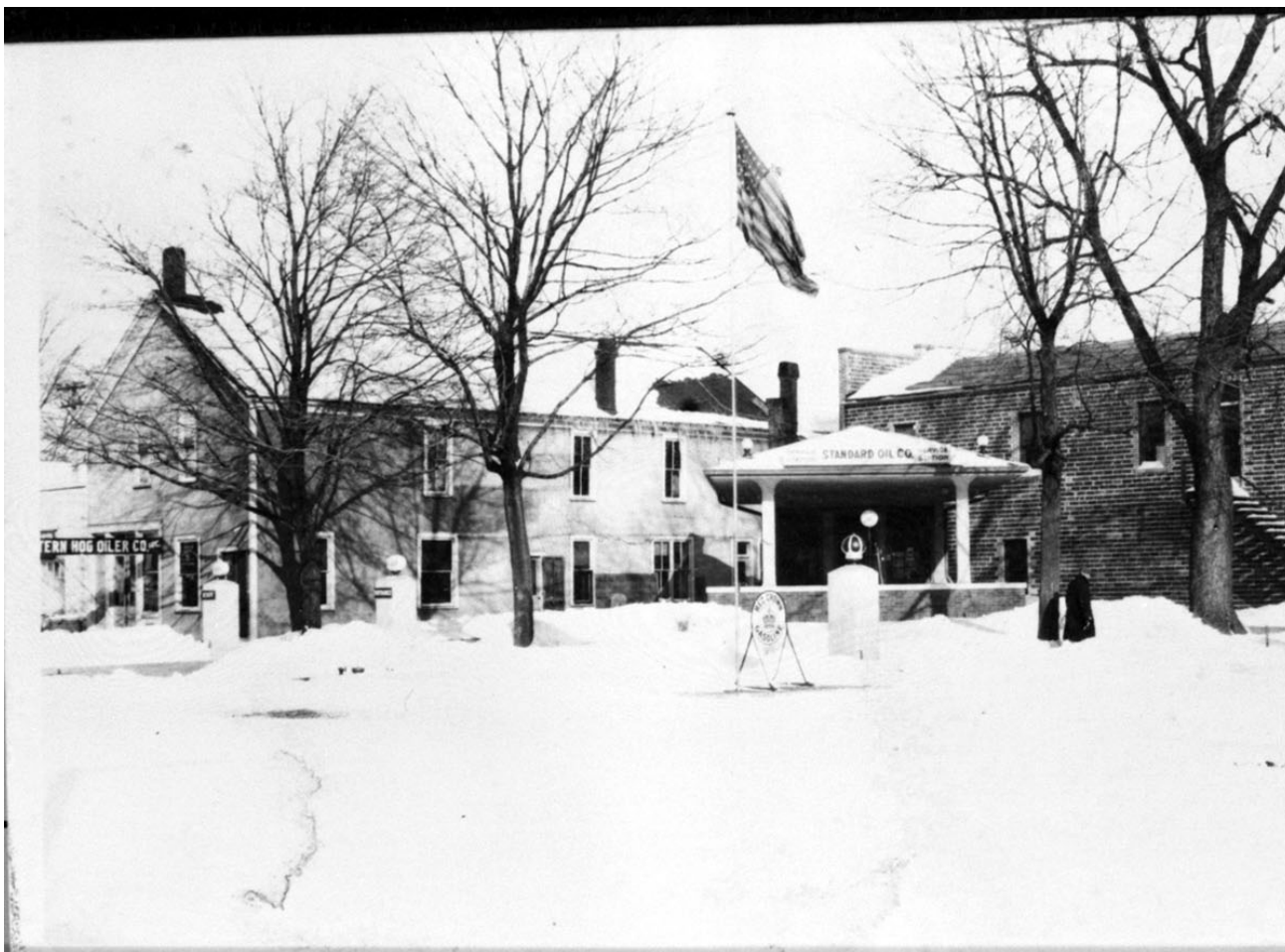
Northwest corner of 2nd Street and Marion Ave around 1920