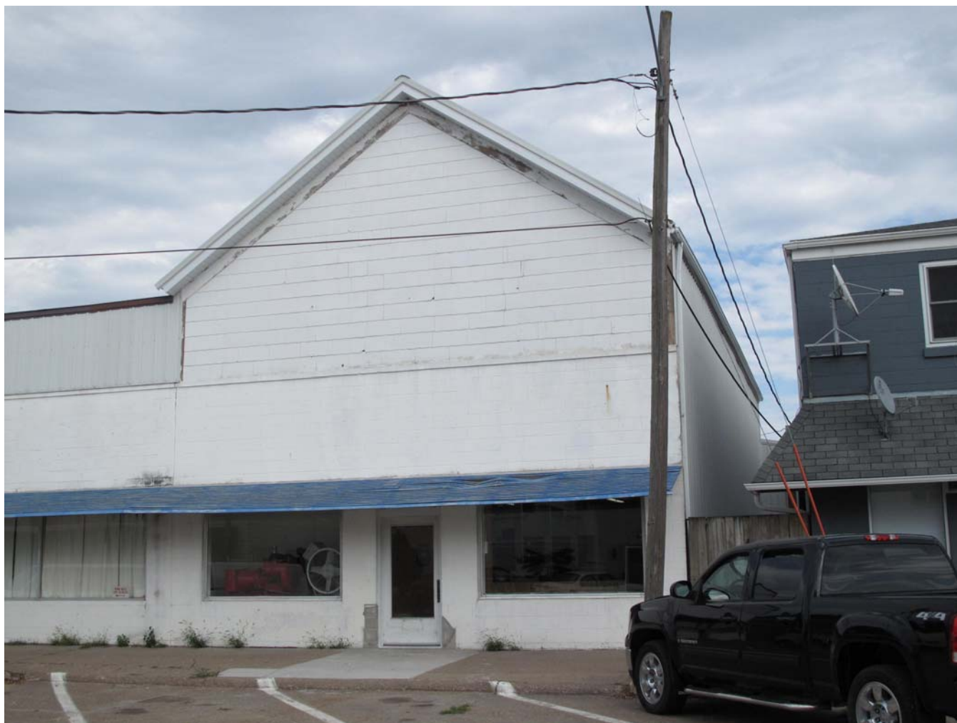
Photograph 92-00553-001 - West and south elevations, looking east-northeast