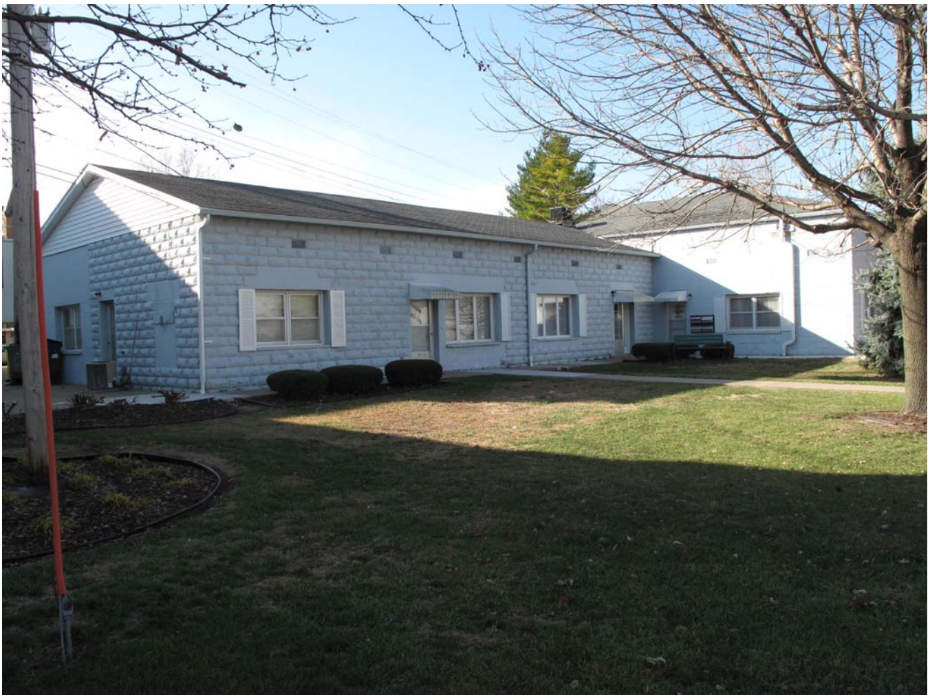
Photograph 92-00592-001 - East and north elevations of original section, looking southwest