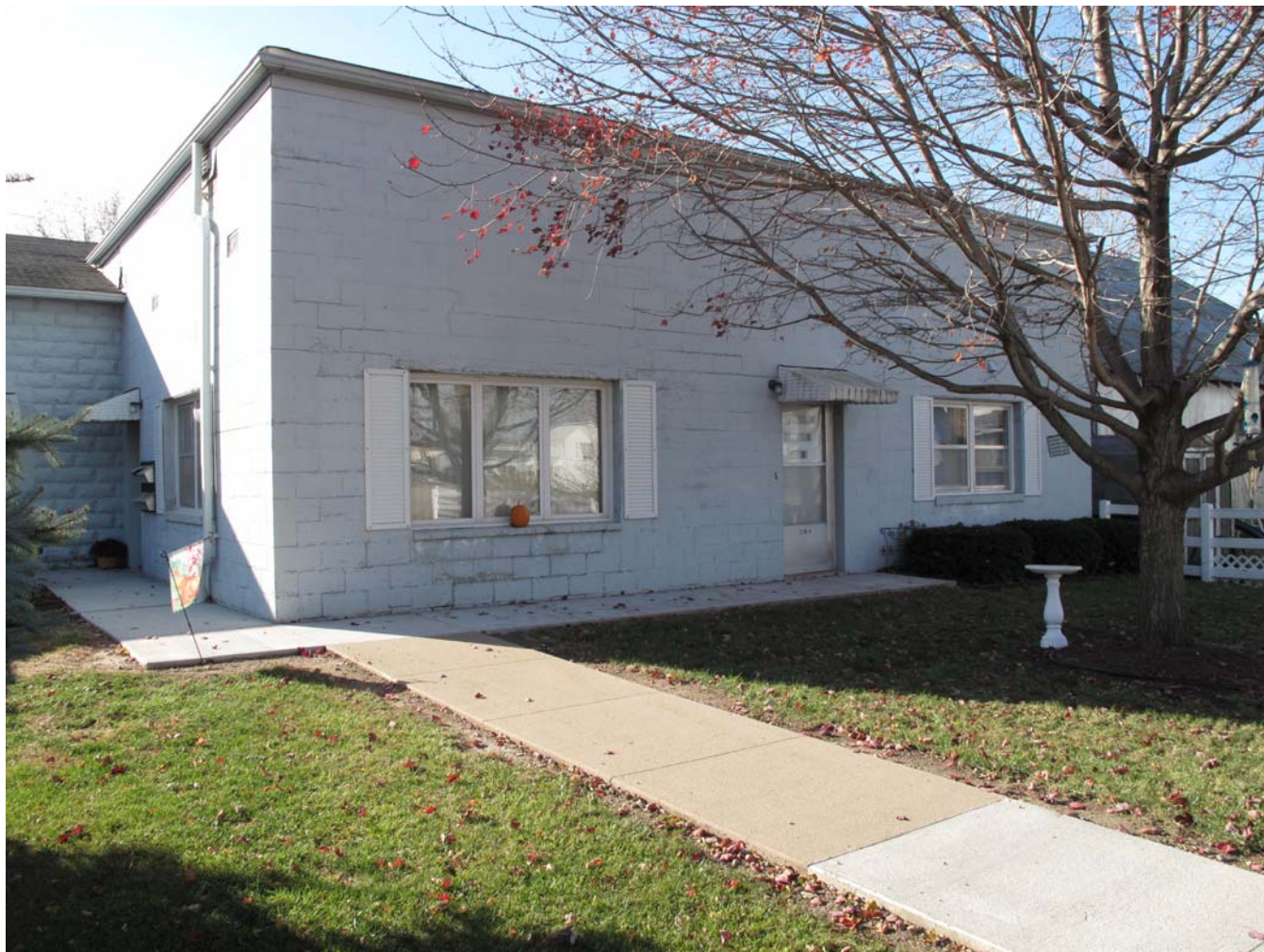
Photograph 92-00592-002 - North elevation of west addition, looking southwest