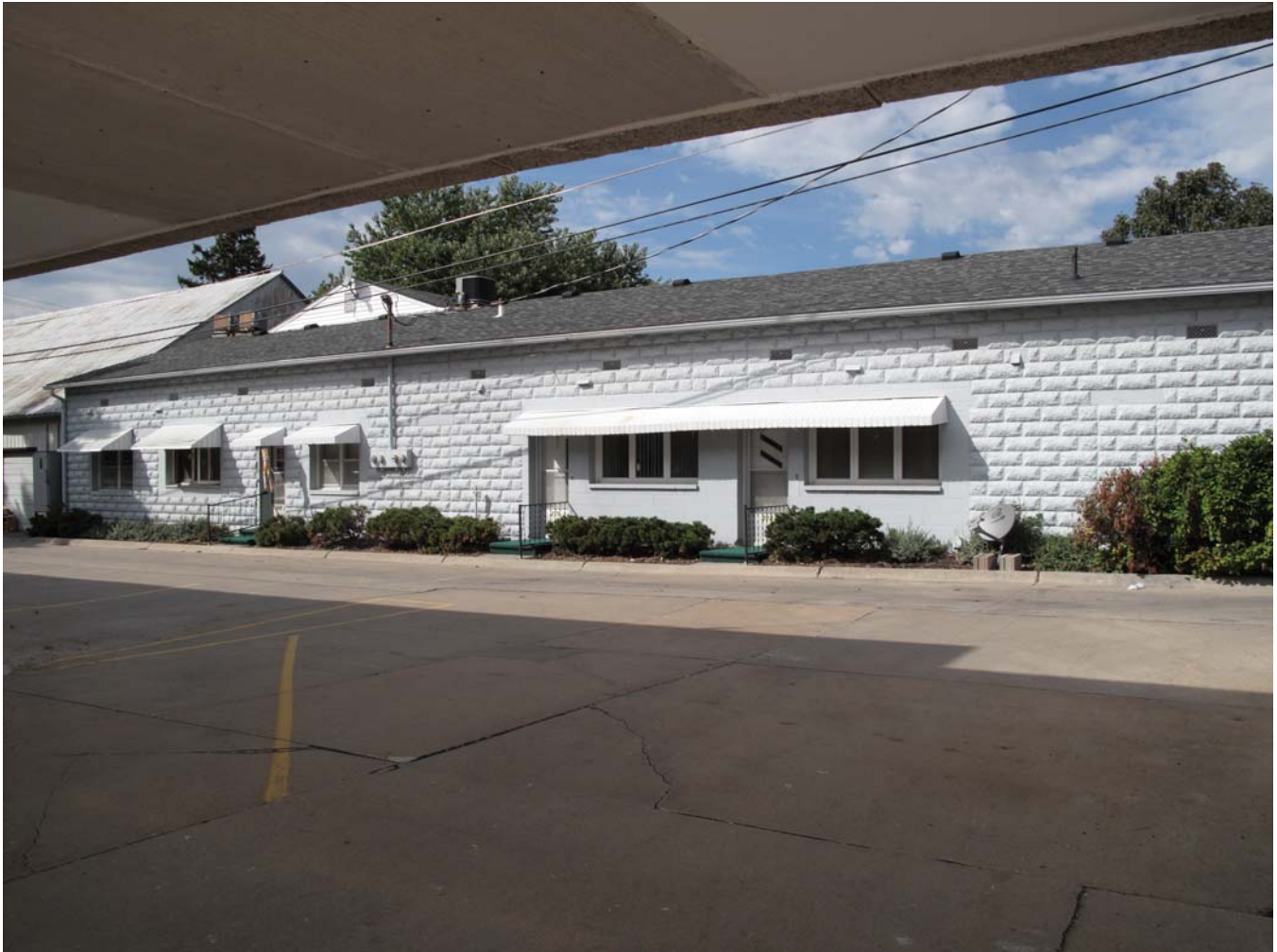
Photograph 92-00592-004 - South elevation of original section, looking north