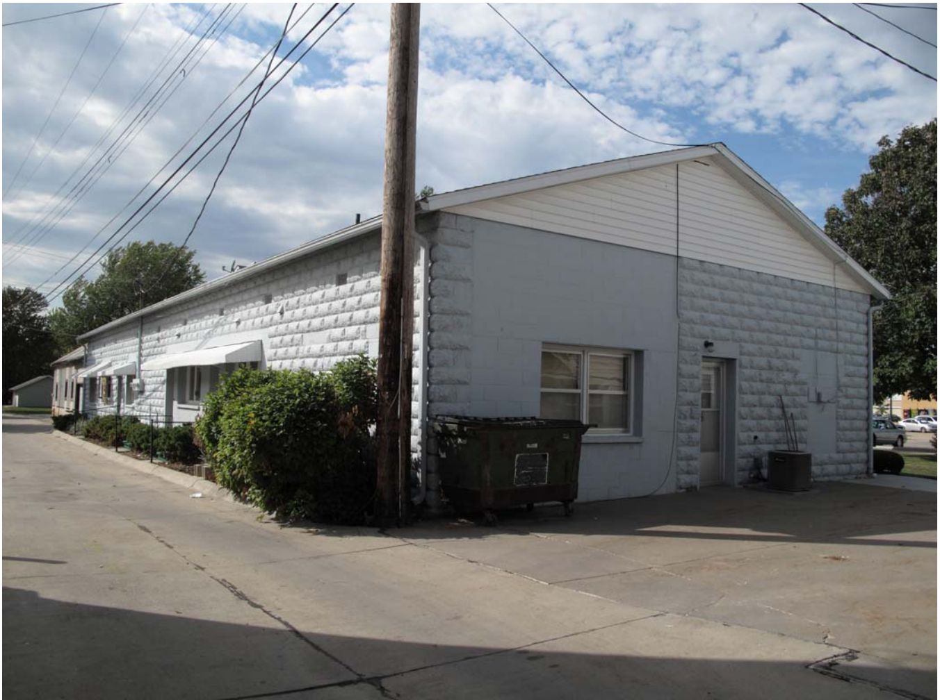
Photograph 92-00592-003 - South and east elevations of original section, looking northwest (, September 20, 2011)