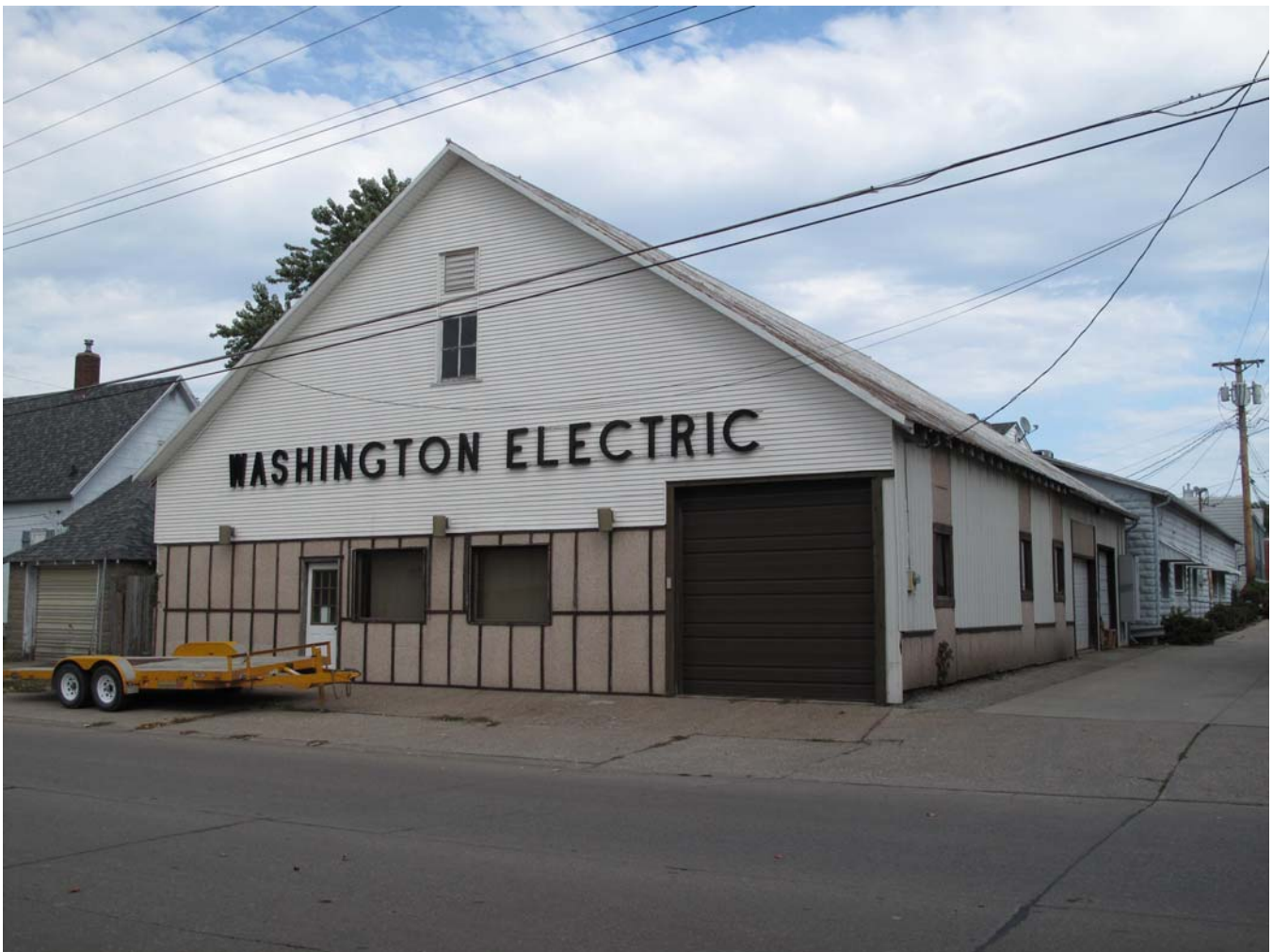
Photograph 92-00495-001 - West and south elevations, looking northeast