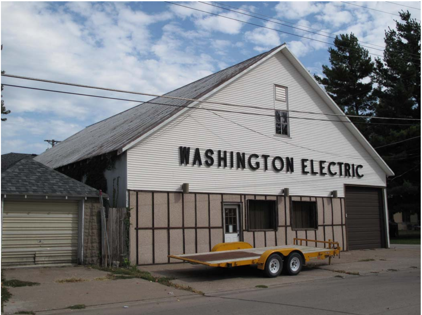
Photograph 92-00495-002 - North and west elevations, looking southeast