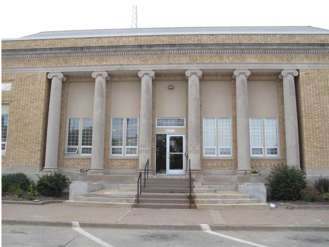
Photograph 92-00165-003 - East elevation, looking west