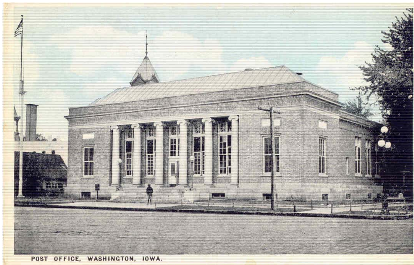
Postcard of building (Patterson collection).