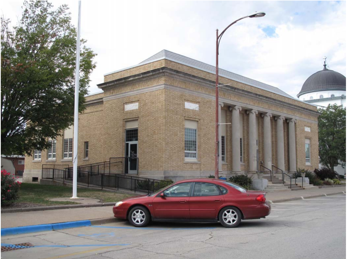
Photograph 92-00165-002 - South and east elevations, looking northwest