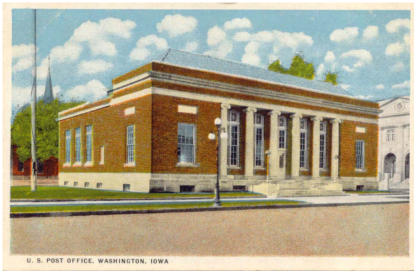
Postcard of building.