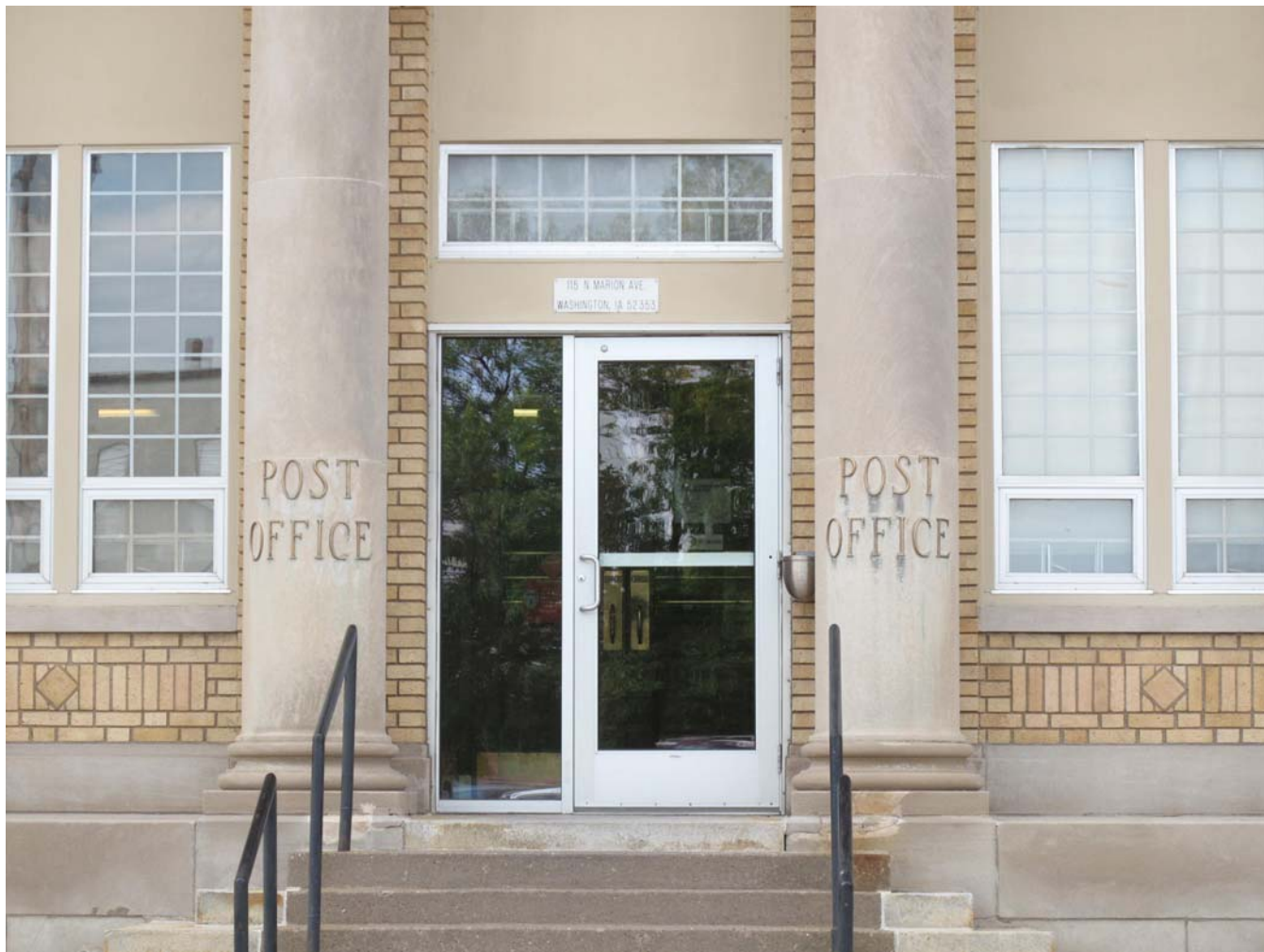
Photograph 92-00165-004 - Detail of east elevation, looking west