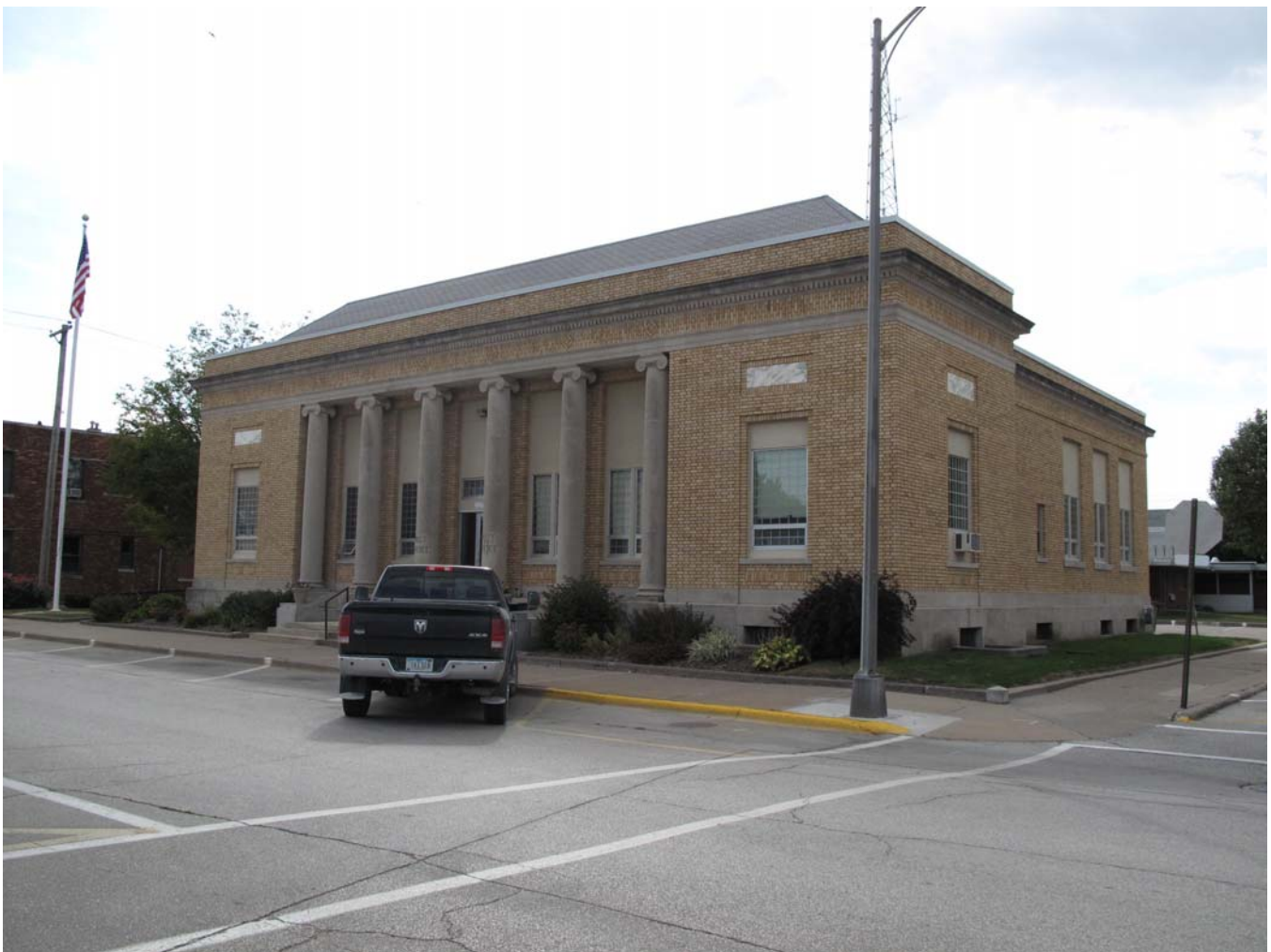
Photograph 92-00165-001 - East and north elevations, looking southwest