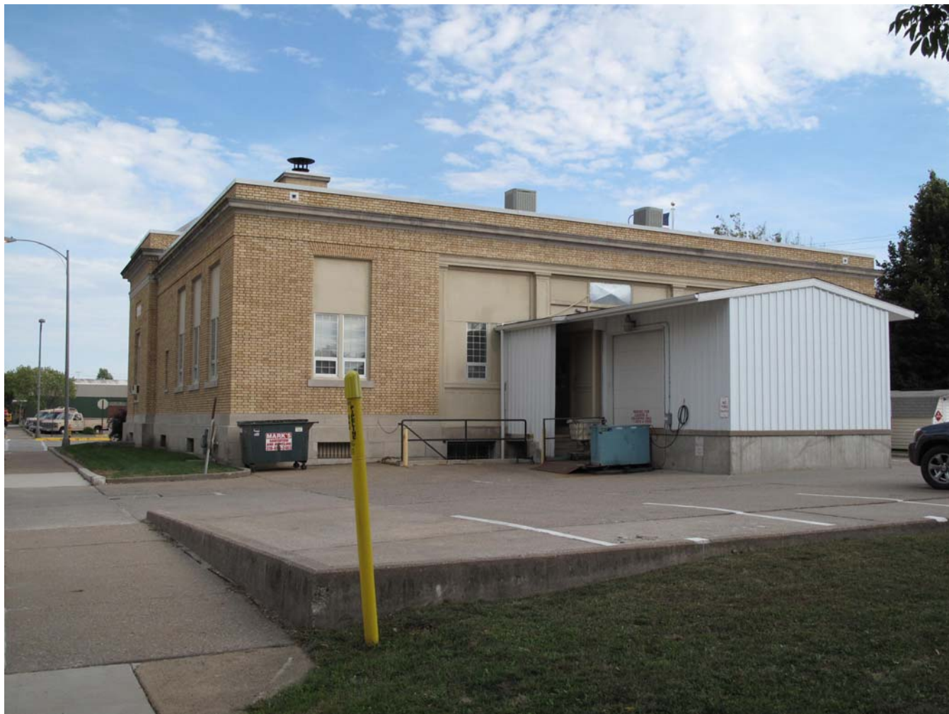
Photograph 92-00165-005 - West elevation, looking southeast