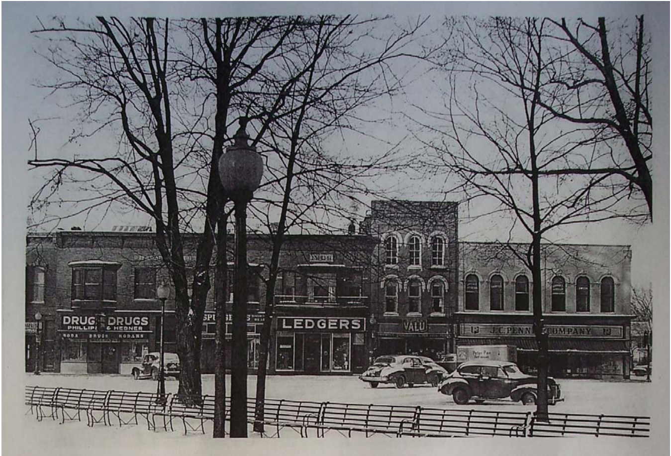
Building in late 1930s