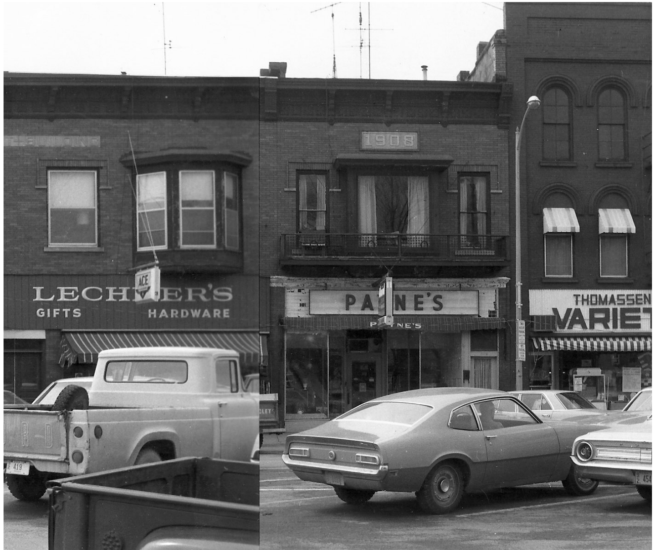
Building in 1971 (Wagner 1971).