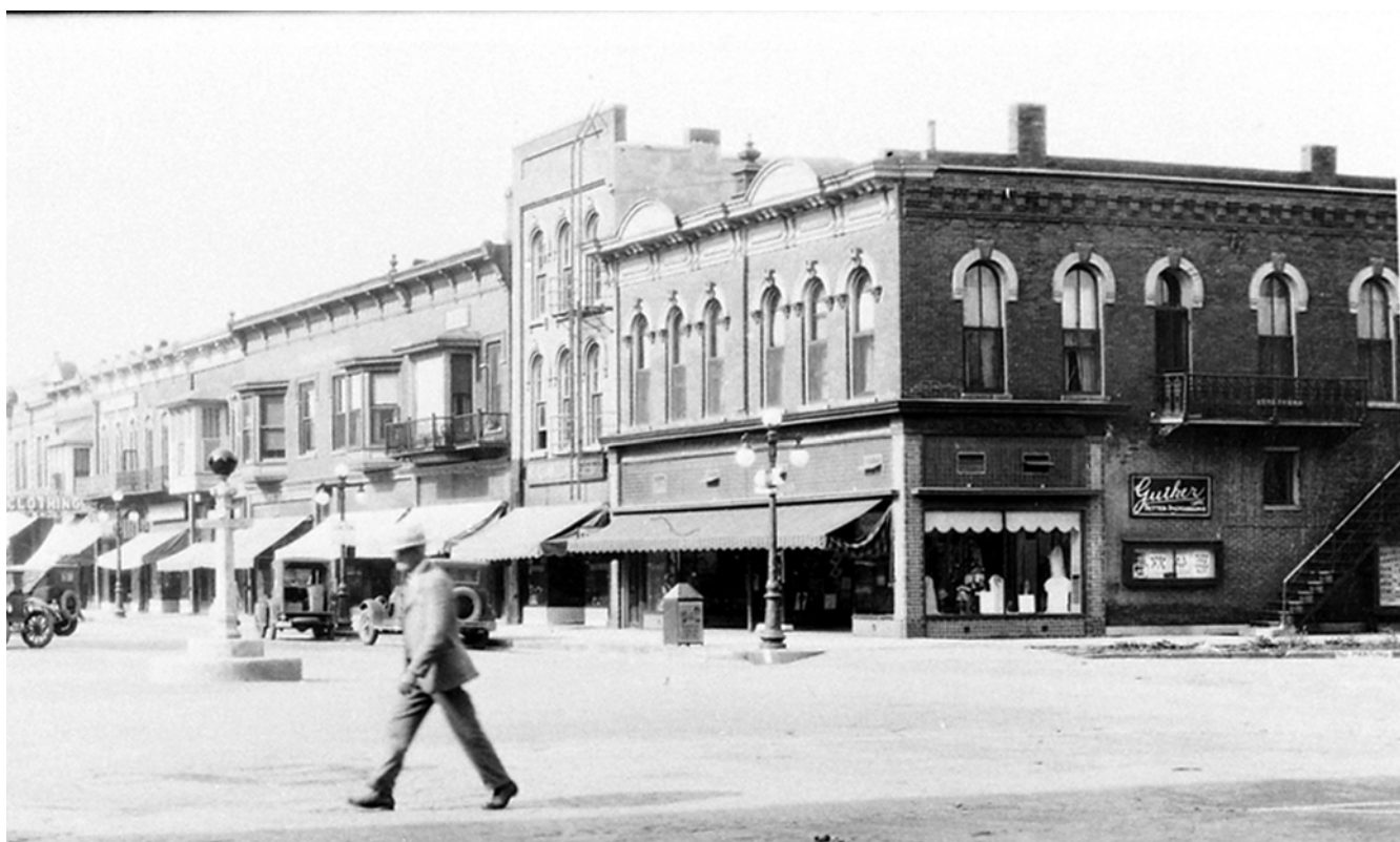
Building in 1920s