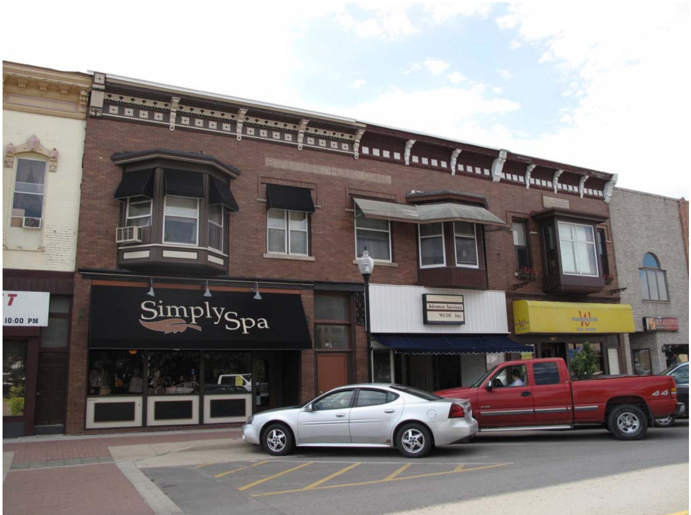
Photograph 92-00561-002 - East elevation of Stewart Building (111-109) and Mount Building (107), looking northwest