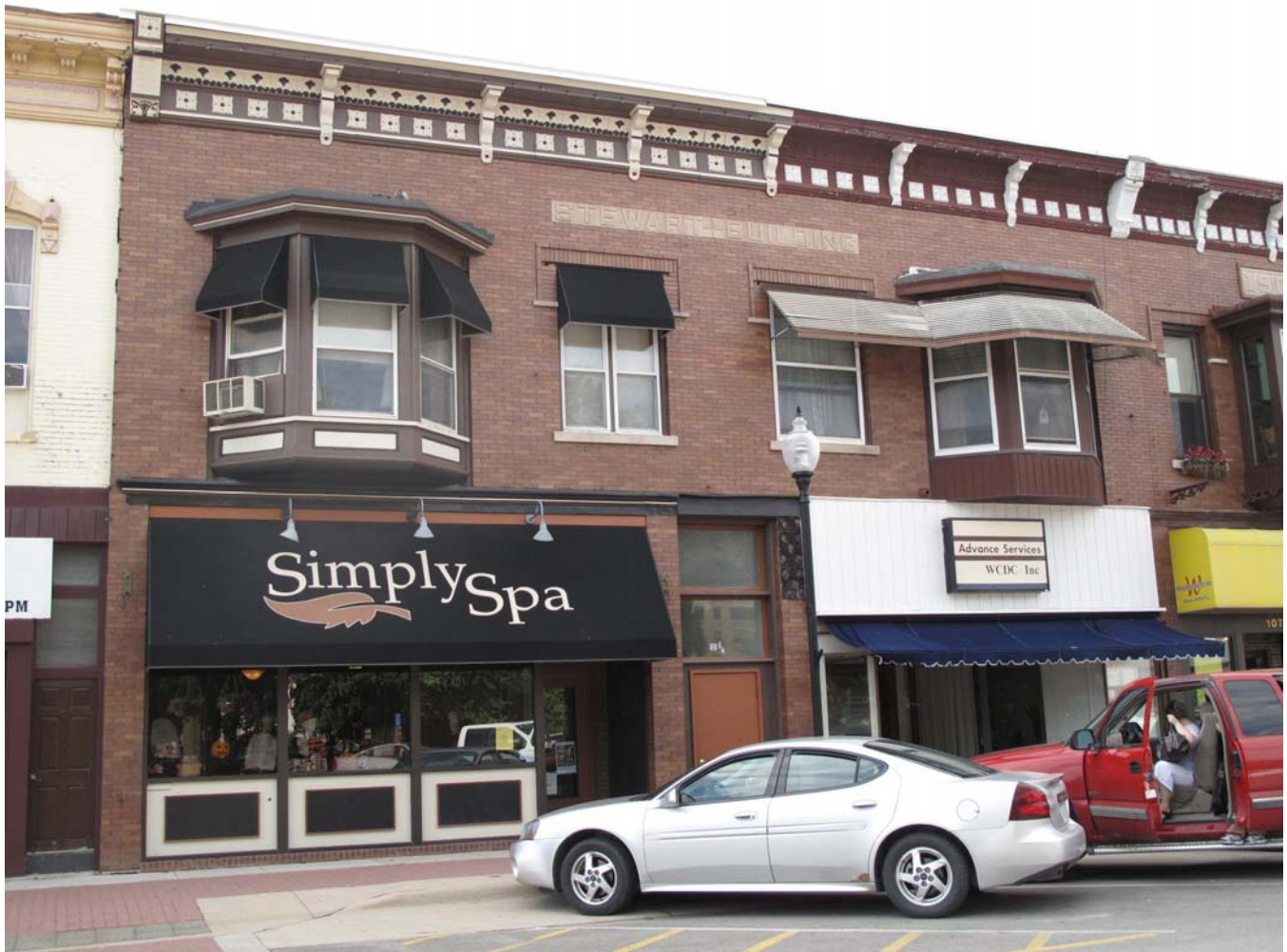
Photograph 92-00561-001 - East elevation, looking west (, September 20, 2011)