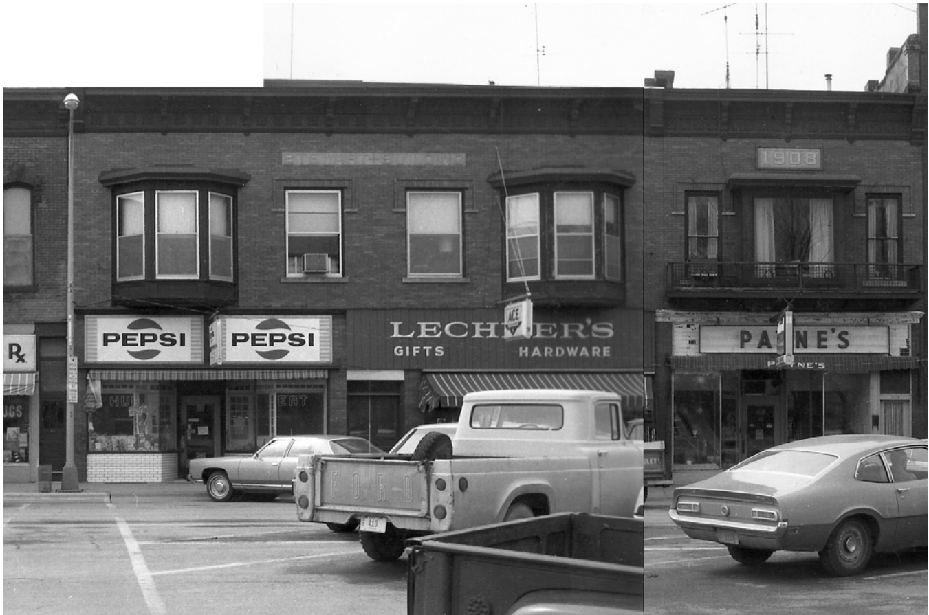
Building in 1971 (Wagner 1971).