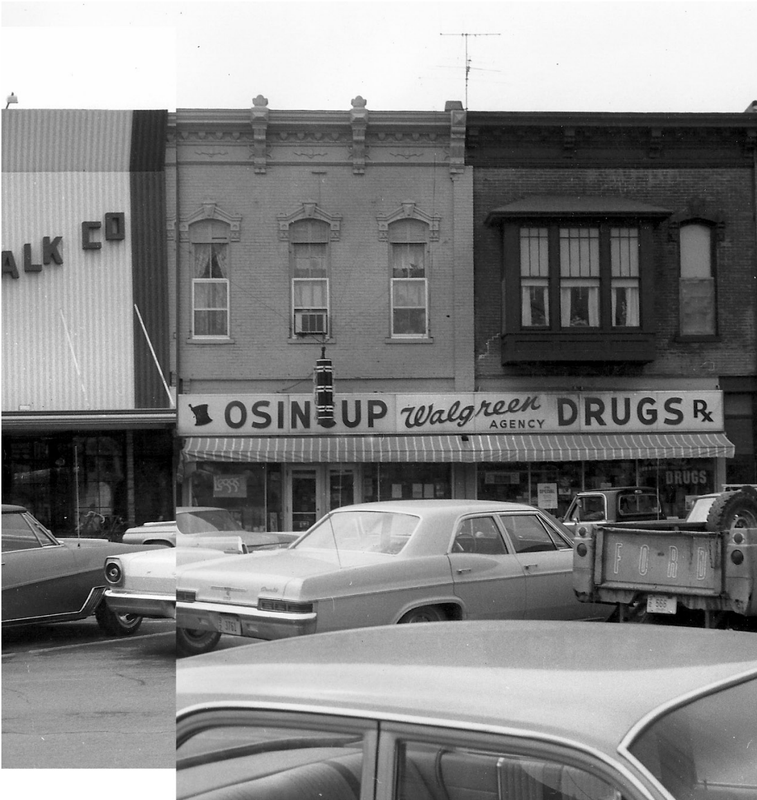
Building in 1971 (Wagner 1971)