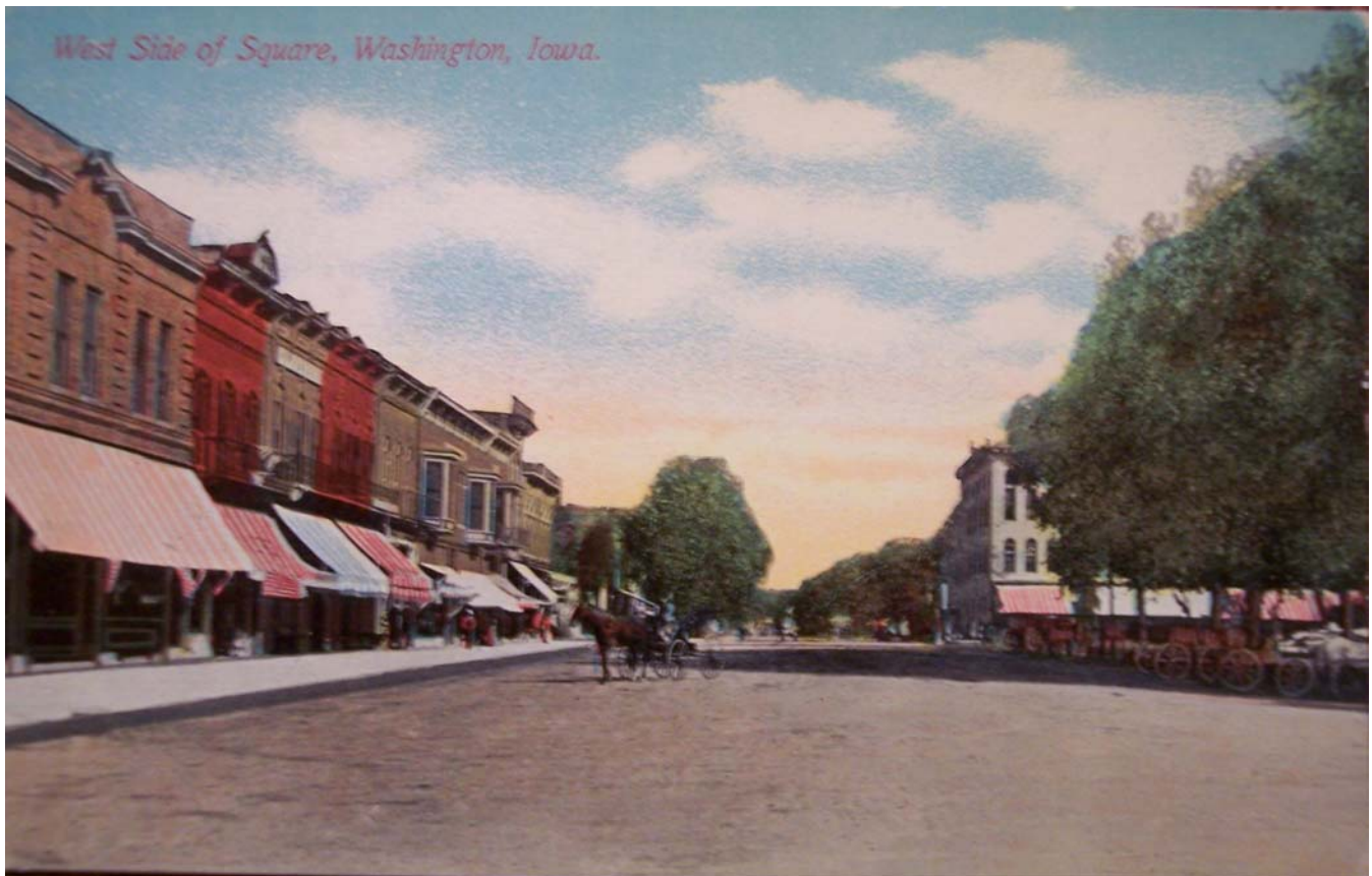
West side of square around 1910 (after 1908 remodel of buildings to north of 113)