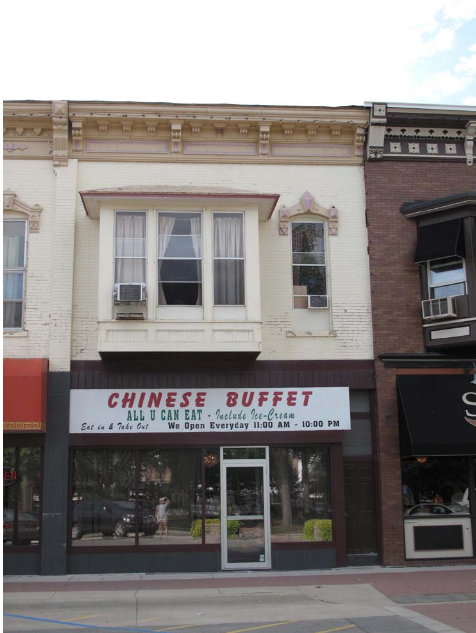
Photograph 92-00562-001 - East elevation, looking west