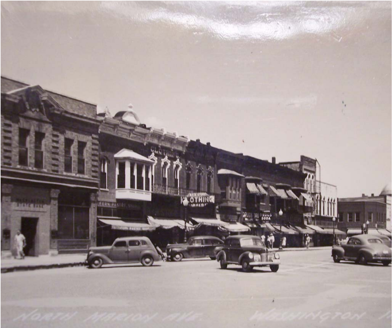
West side of square in 1930s - bay window added