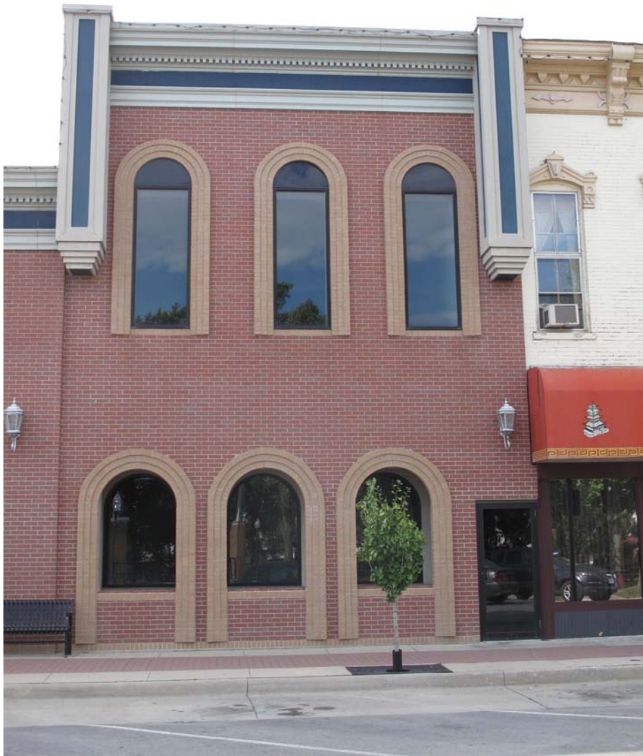
92-00564-001 - East elevation, looking west