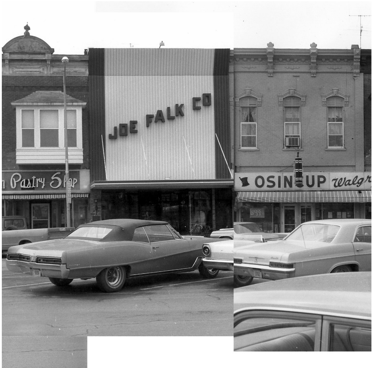
Building in 1971 (Wagner 1971)