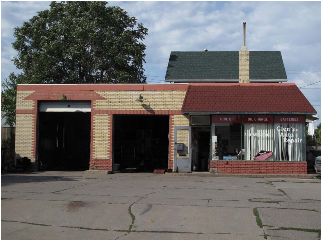
Photograph 92-00498-002 - South elevation, looking north