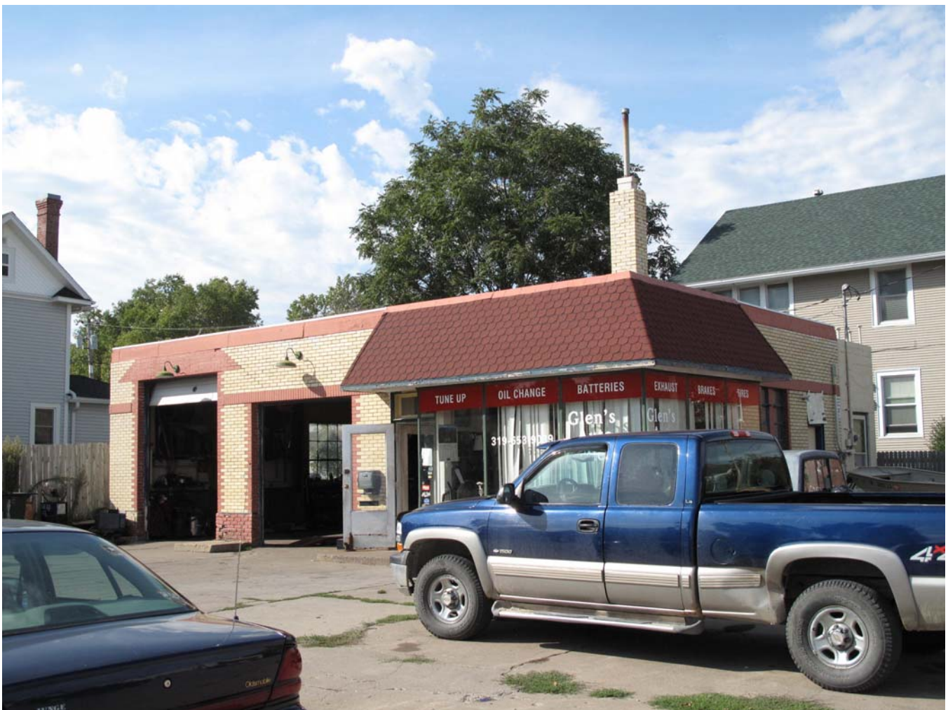
Photograph 92-00498-001 - South and east elevations, looking northwest