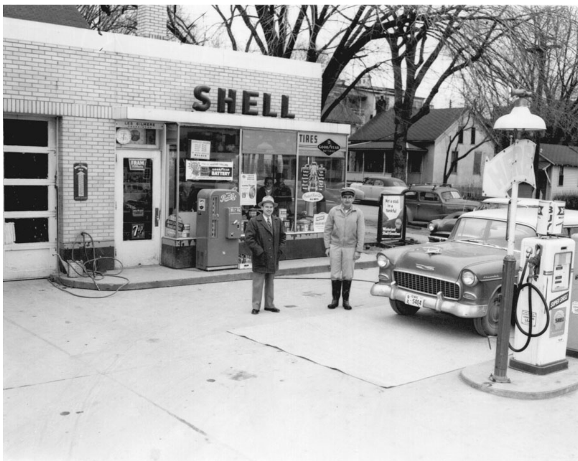
Building, unknown date