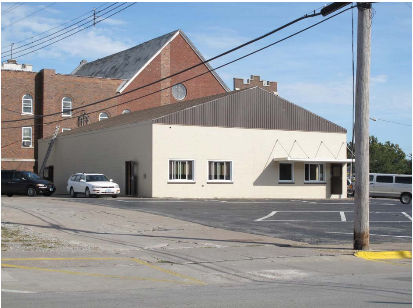
Photograph 92-00499-001 - North and west elevations, looking southeast