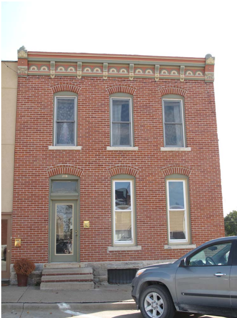
Photograph 92-00611-001 - North elevation, looking south