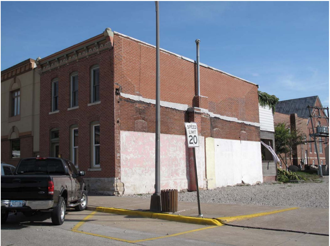
Photograph 92-00611-002 - North and west elevations, looking southeast (, September 20, 2011)