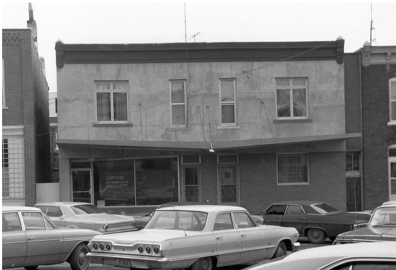
Building in 1971 after c.1957 remodel (Wagner 1971)