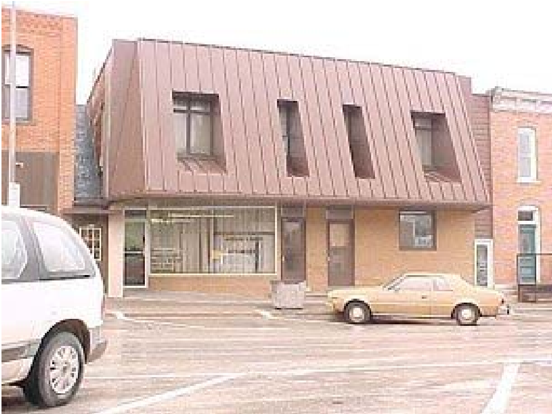
Photograph of building from assessor site from prior to 2006 remodel

McConnaughey Building _____ Name of Property County 209-211 W. Washington Washington Address City