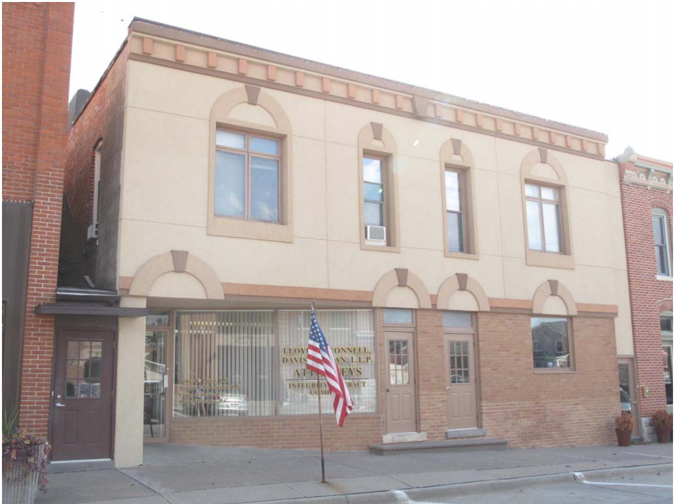
Photograph 92-00609-002 - North elevation, looking southwest