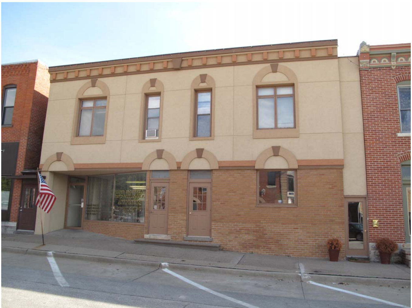
Photograph 92-00609-001 - North elevation, looking south