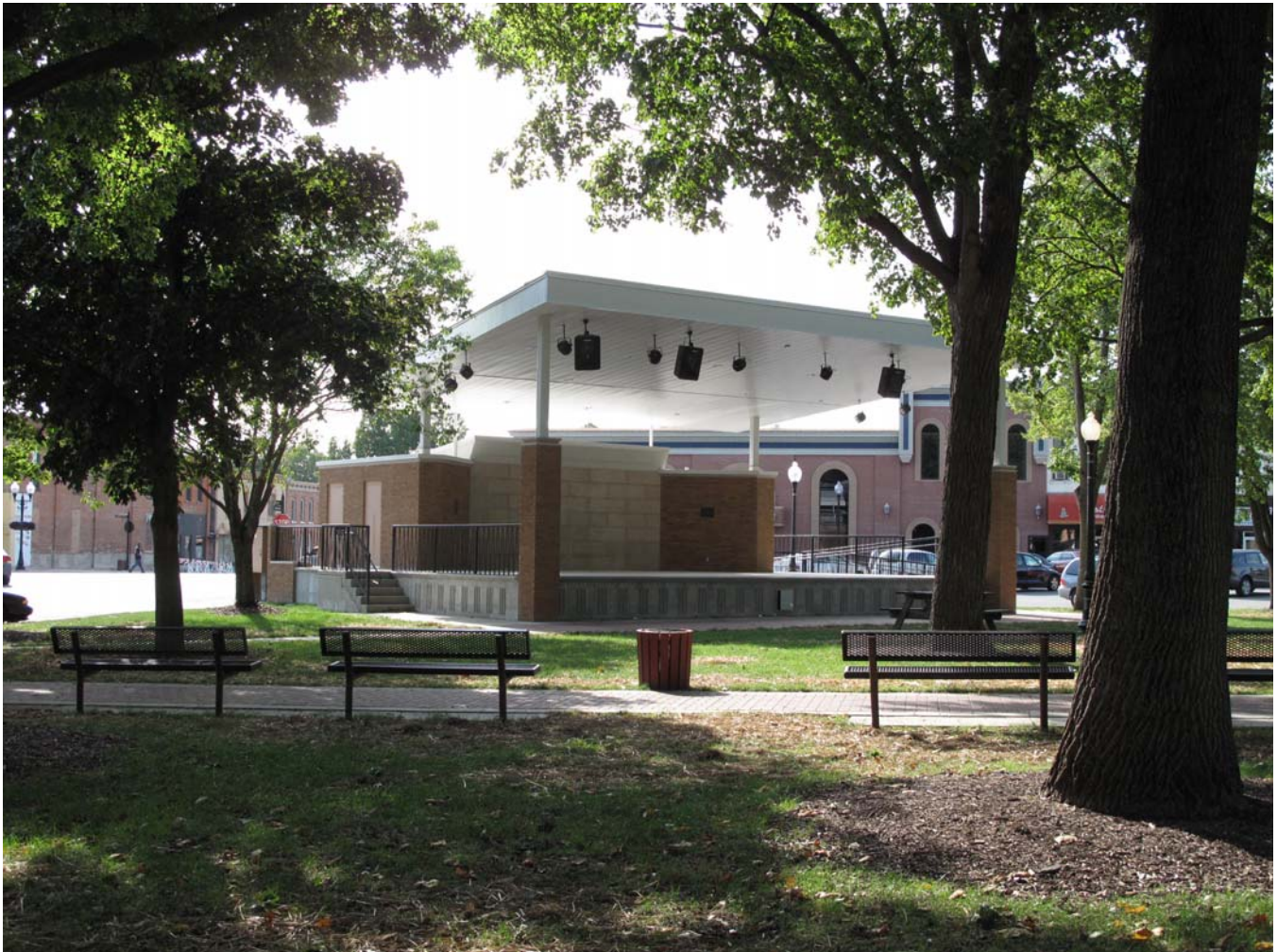
Photograph 92-00490-001 - Bandstand, looking southwest