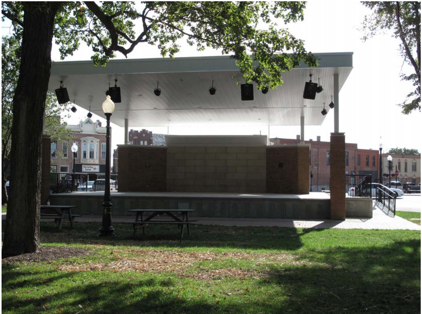
Photograph 92-00490-002 - Bandstand, looking southwest