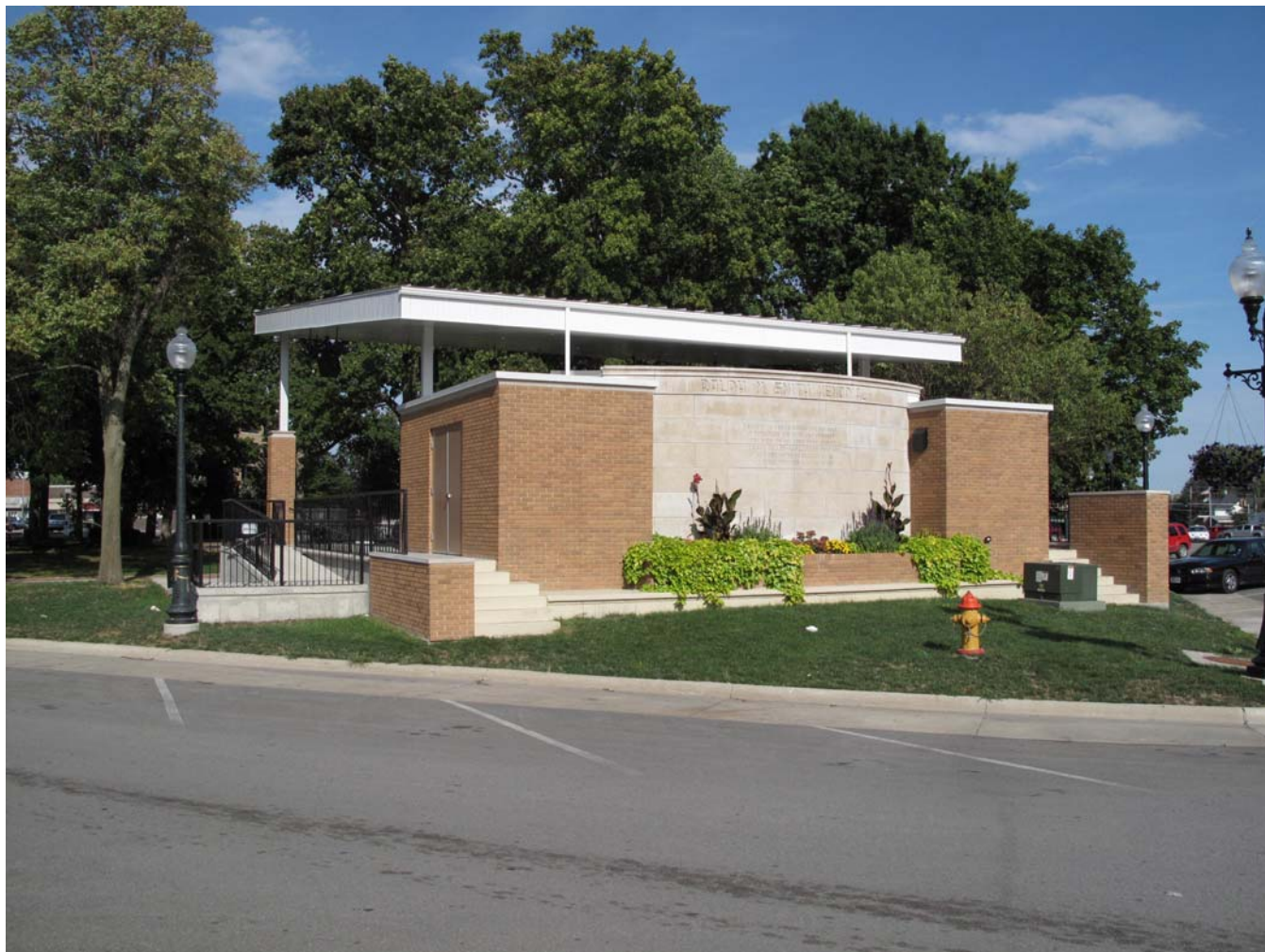
Photograph 92-00490-003 - Bandstand, looking northeast