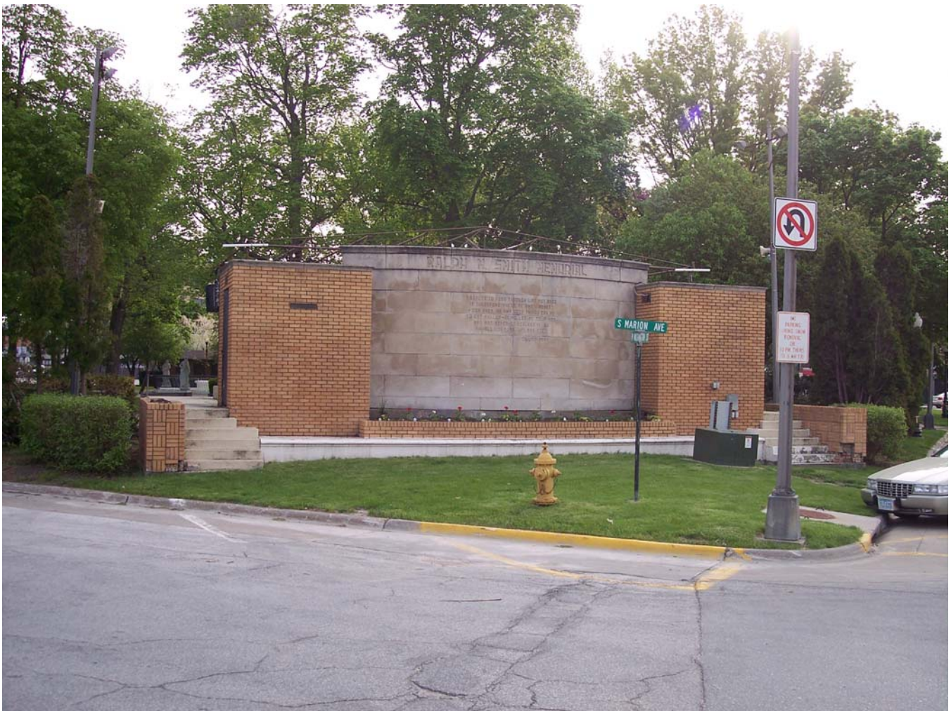
Bandstand before work (Patterson, May 15, 2008)