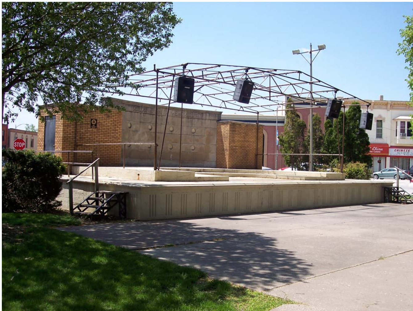
Bandstand before work (Patterson, May 15, 2008)