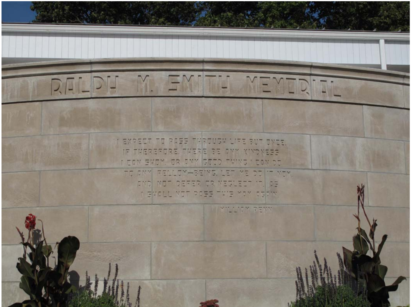
Photograph 92-00490-004 - Original wall in rebuilt bandstand, looking northeast