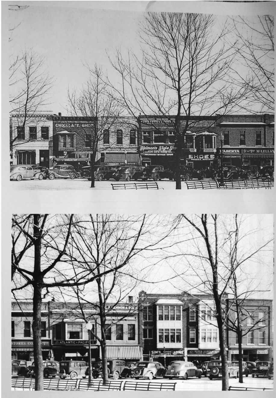
East side of the square in late 1930s (building at top right and bottom left)