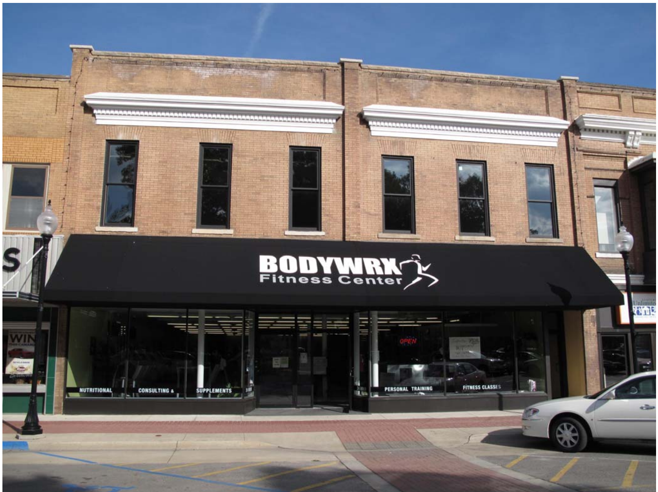
Photograph 92-00513-001 - West elevation, looking east