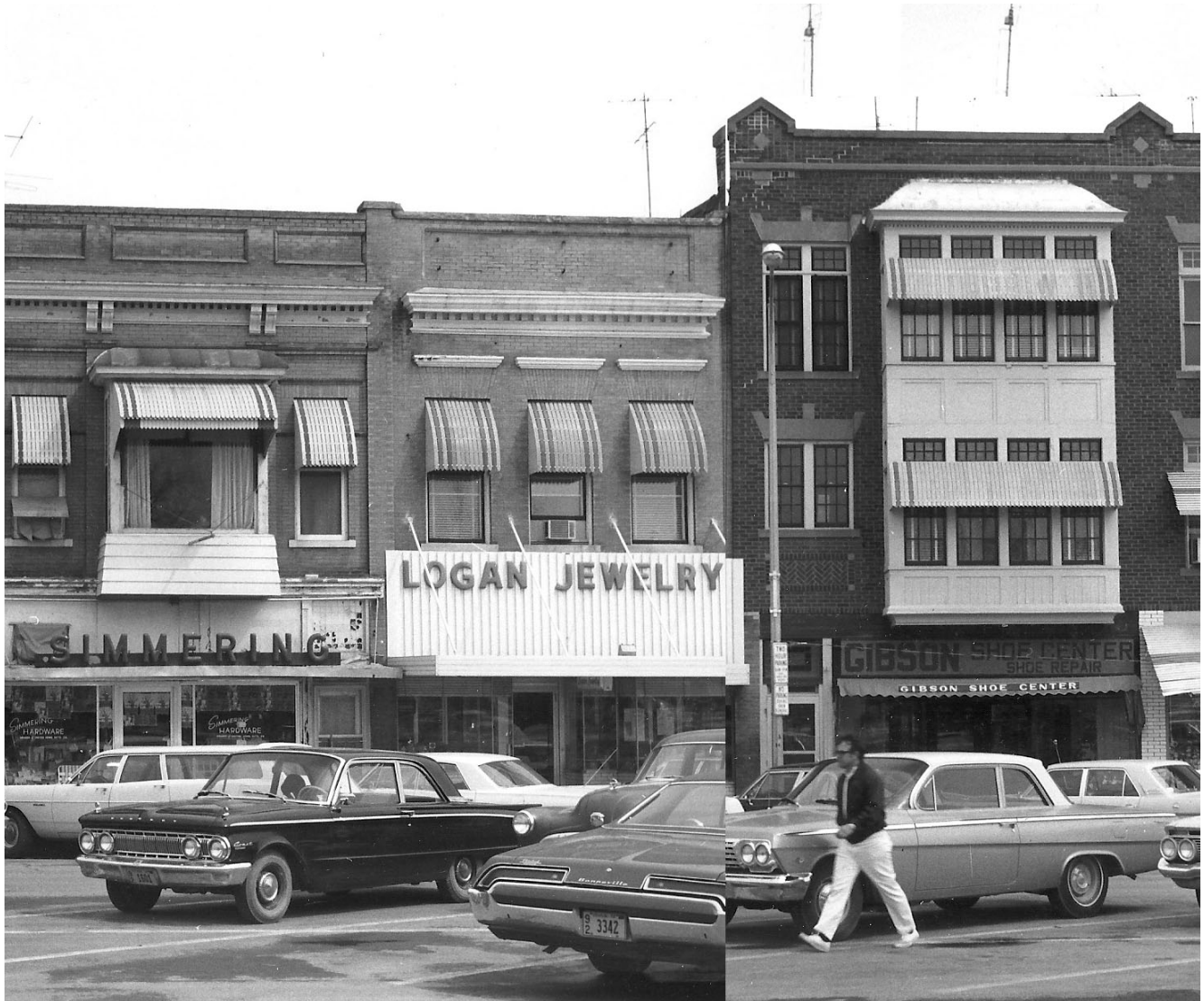
Building in 1971 (Wagner 1971)