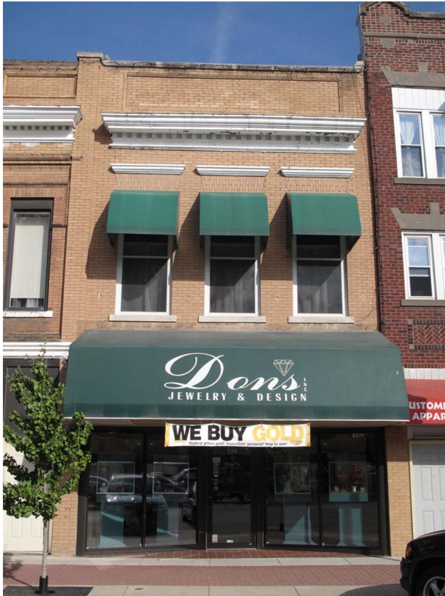
Photograph 92-00515-001 - West elevation, looking east (, September 20, 2012)