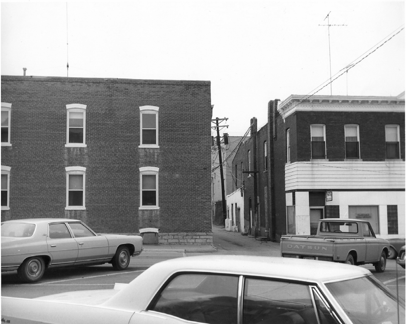
Part of building in 1971 (Wagner 1971)