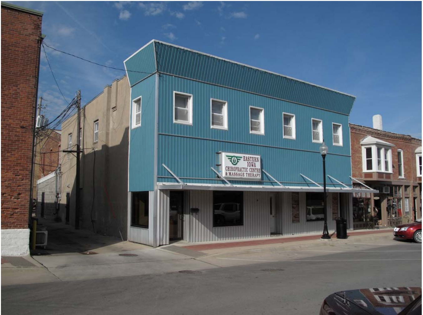
Photograph 92-00595-001 - West and south elevations, looking northeast