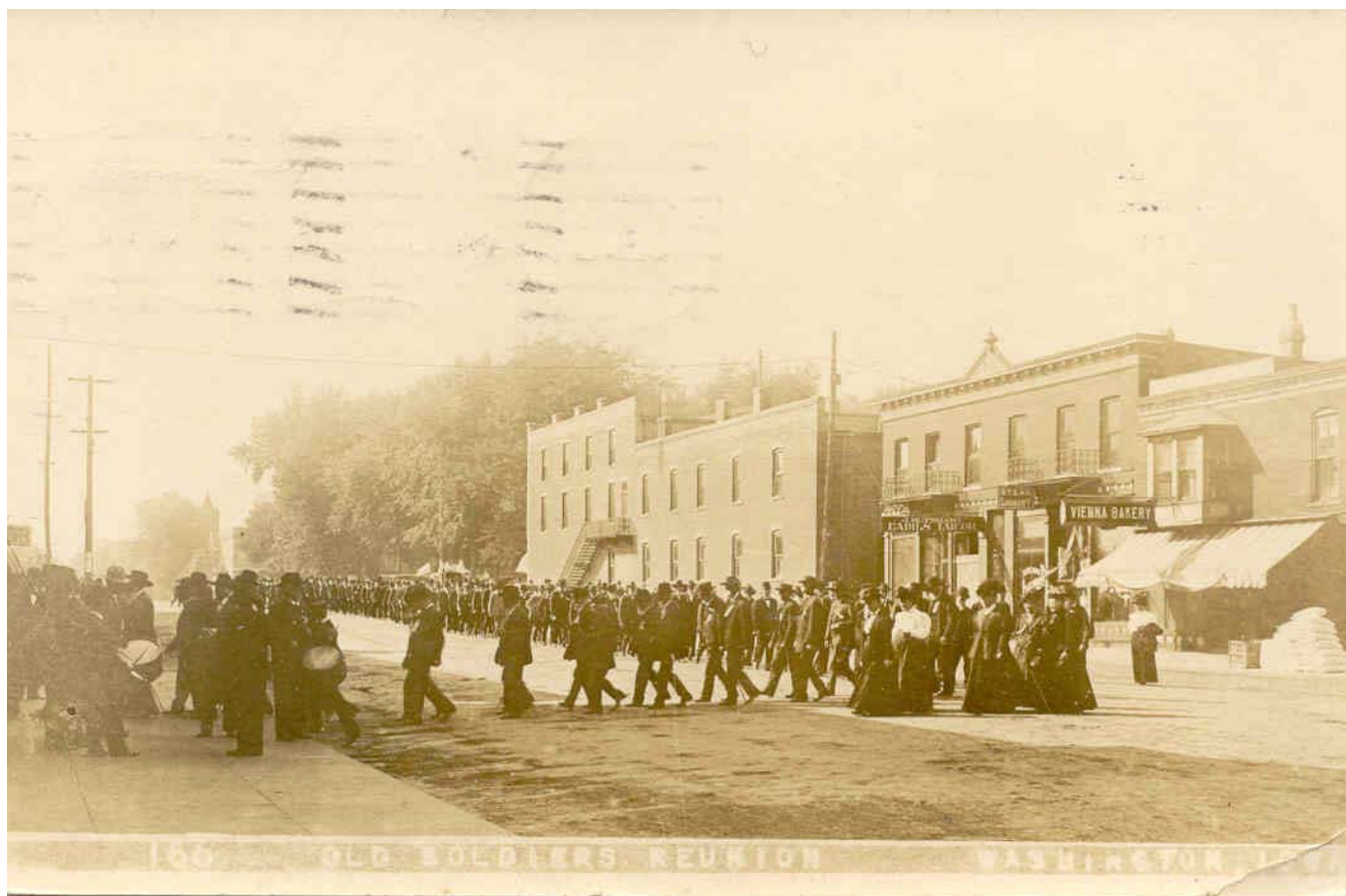
Postcard from 1910 showing building at right