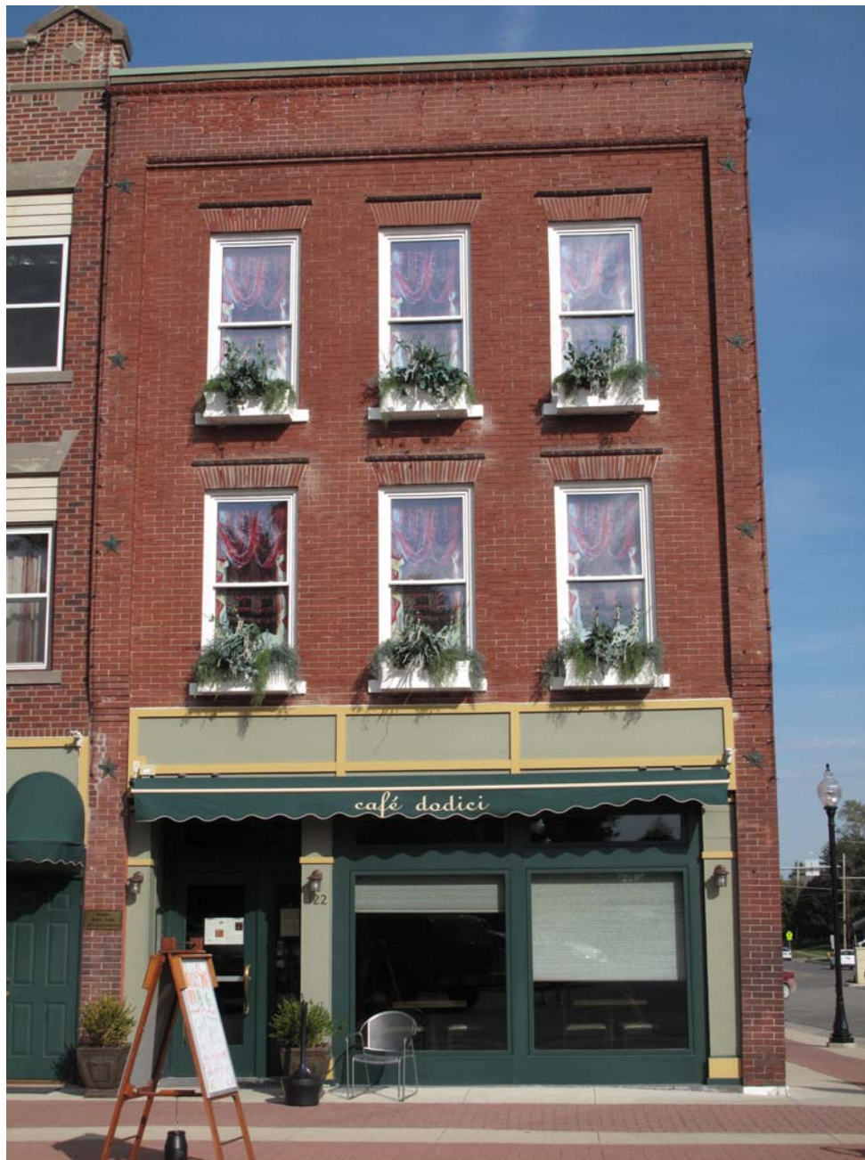
Photograph 92-00517-002 - West elevation, looking east