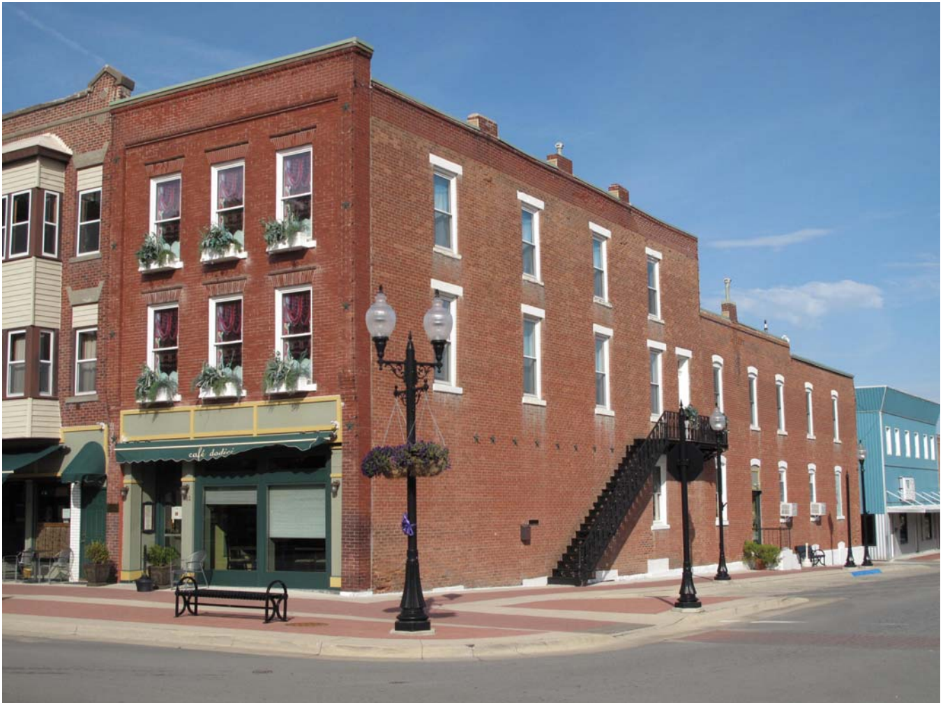
Photograph 92-00517-001 - West and south elevations, looking northeast (, September 20, 2011)