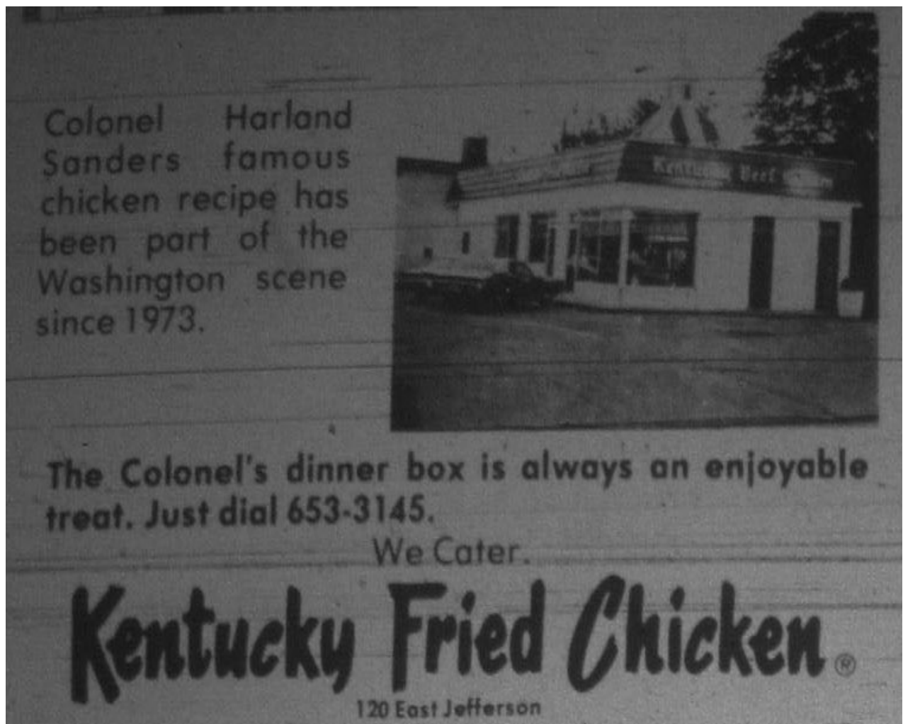
Evening Journal, July 1, 1976, p125