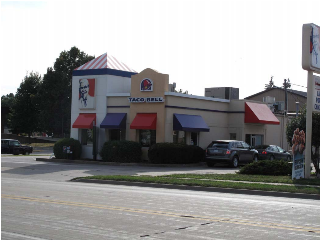
92-00531-001 - East and north elevations, looking southwest (, September 20, 2011)