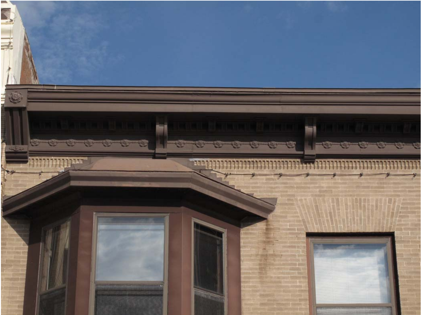
Photograph 92-00519-002 - Detail on west elevation, looking east