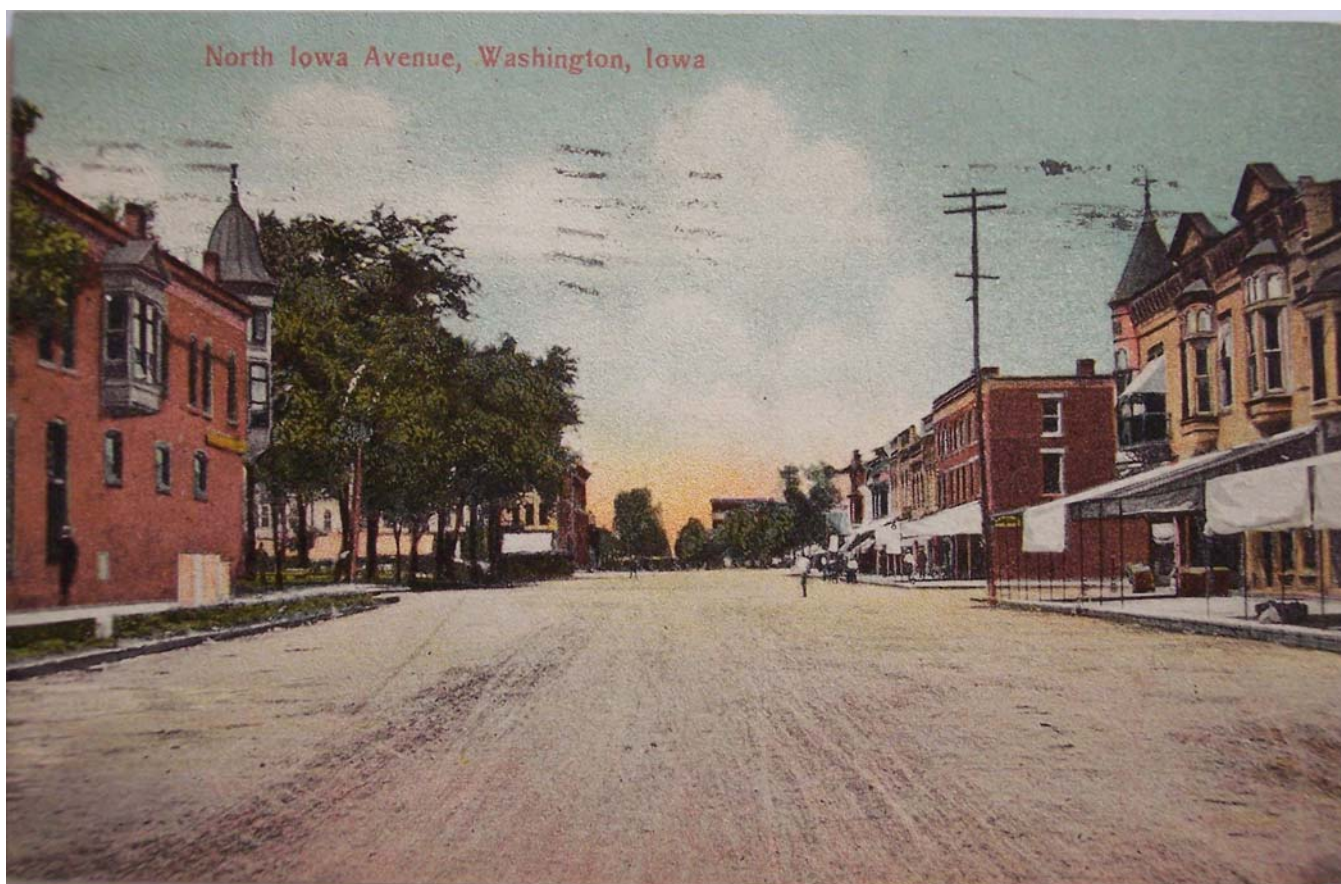
Postcard looking north on S. Iowa from 200 block - building at right