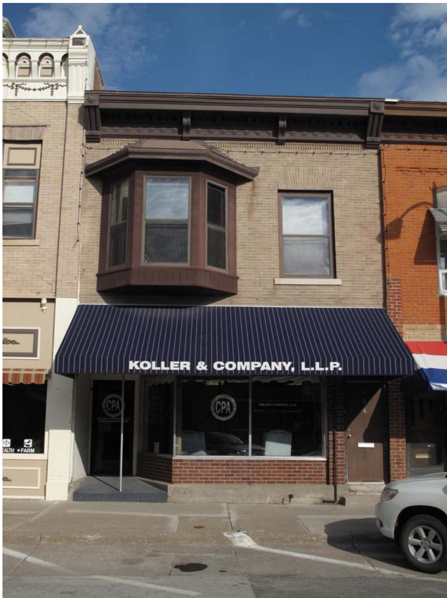
Photograph 92-00519-001 - West elevation, looking east