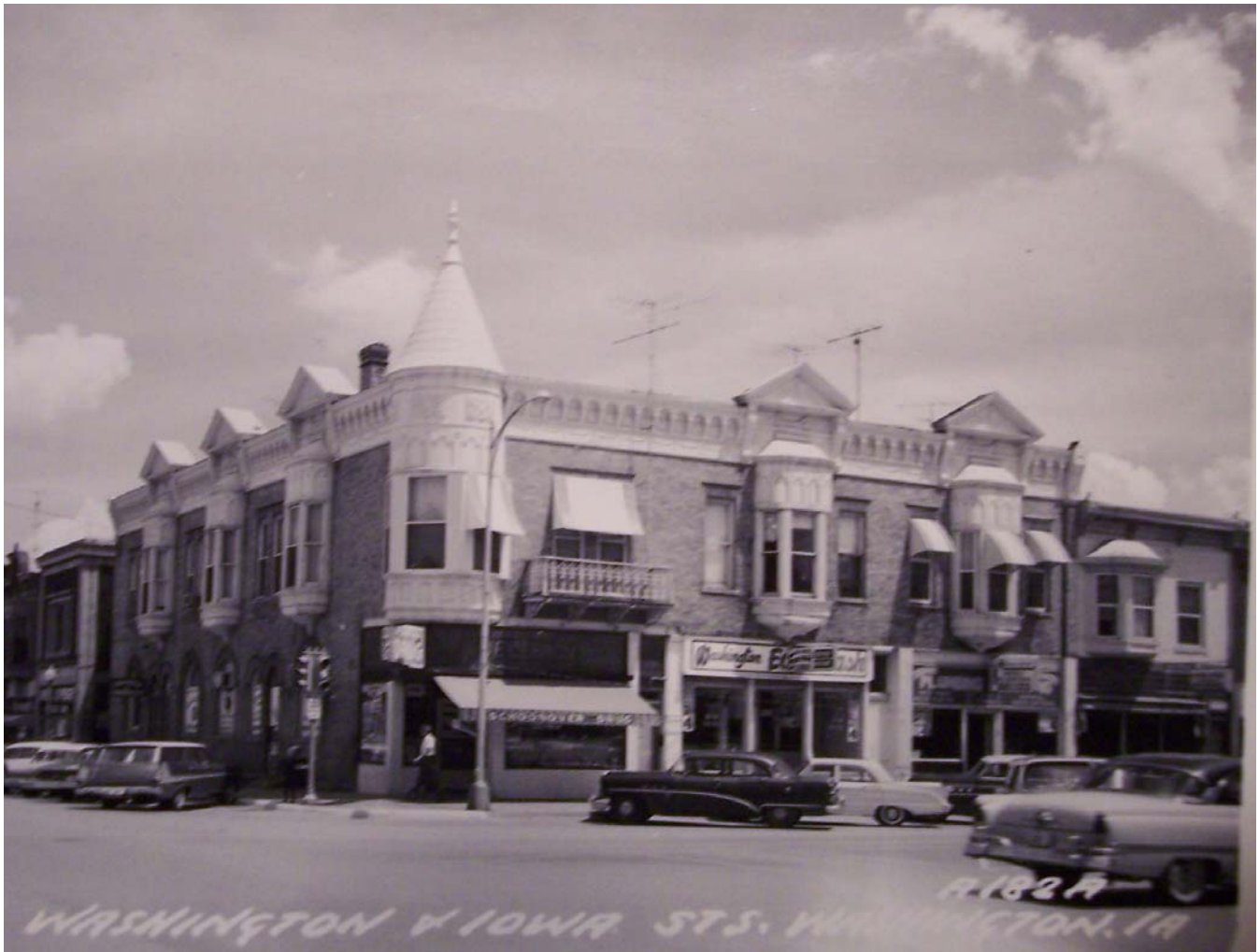
Postcard showing building in c.1950s