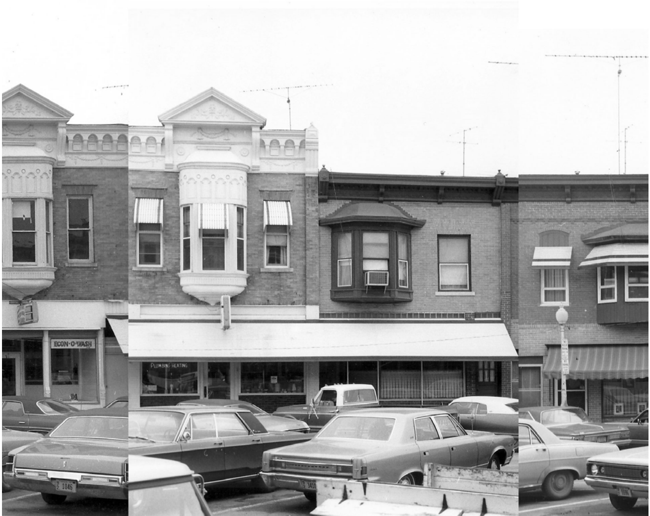
West side of building in 1971 (Wagner 1971)