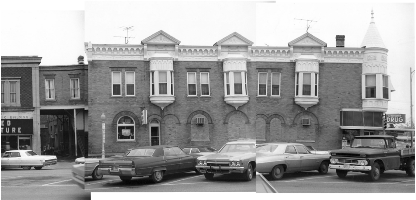
Collage of photos showing the north side of building in 1971 (Wagner 1971)