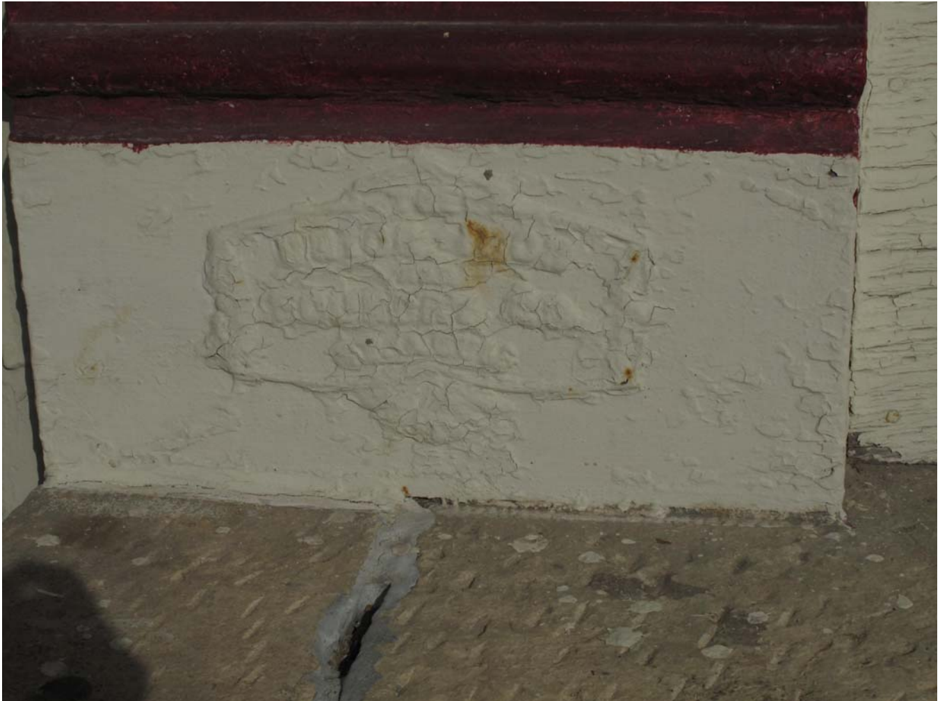
Photograph 92-00518-007 - Detail of stamp on left column on 202 storefront, looking east (, September 20, 2011)