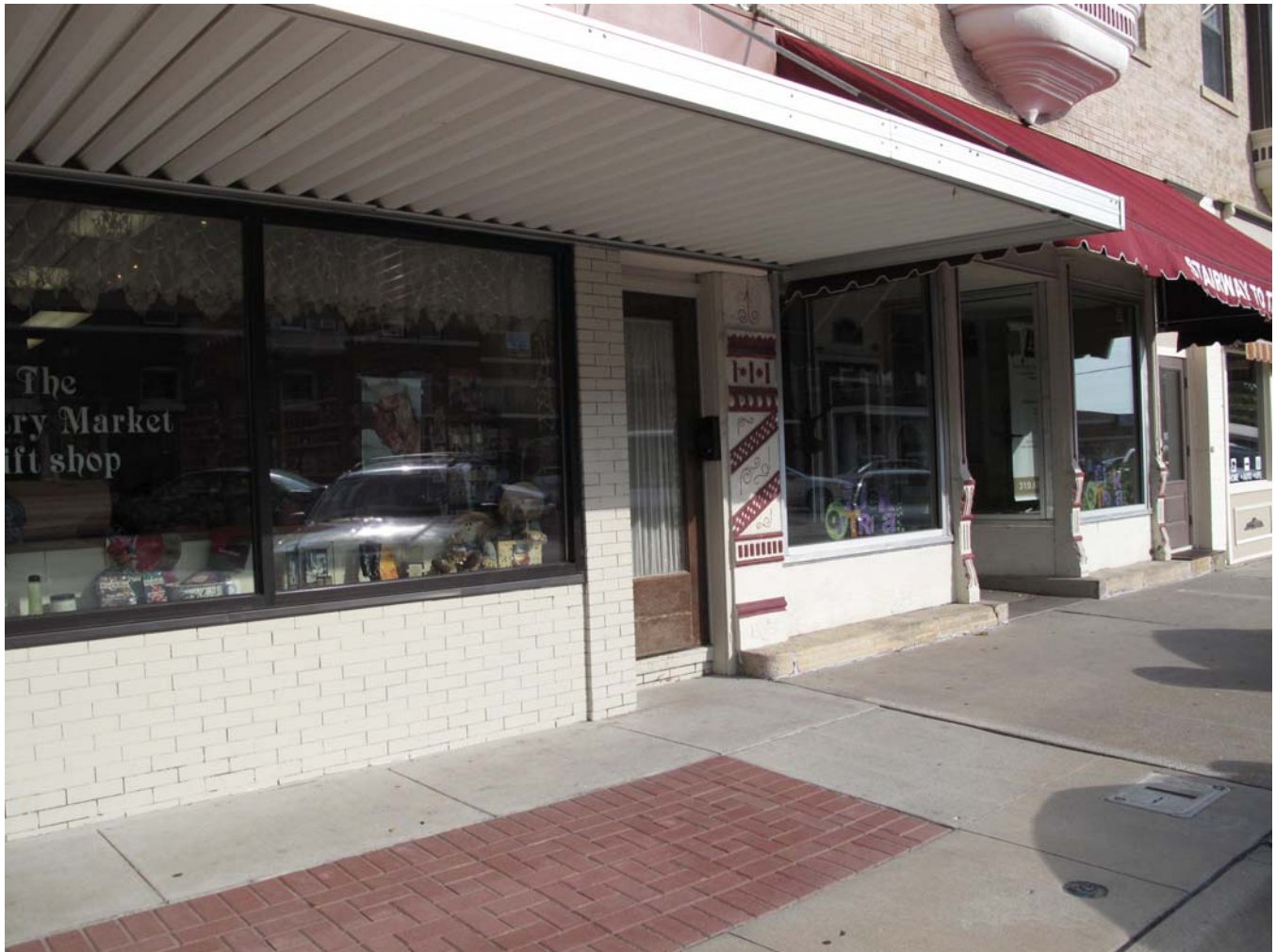
Photograph 92-00518-005 - 200 and 202 storefronts, looking southeast