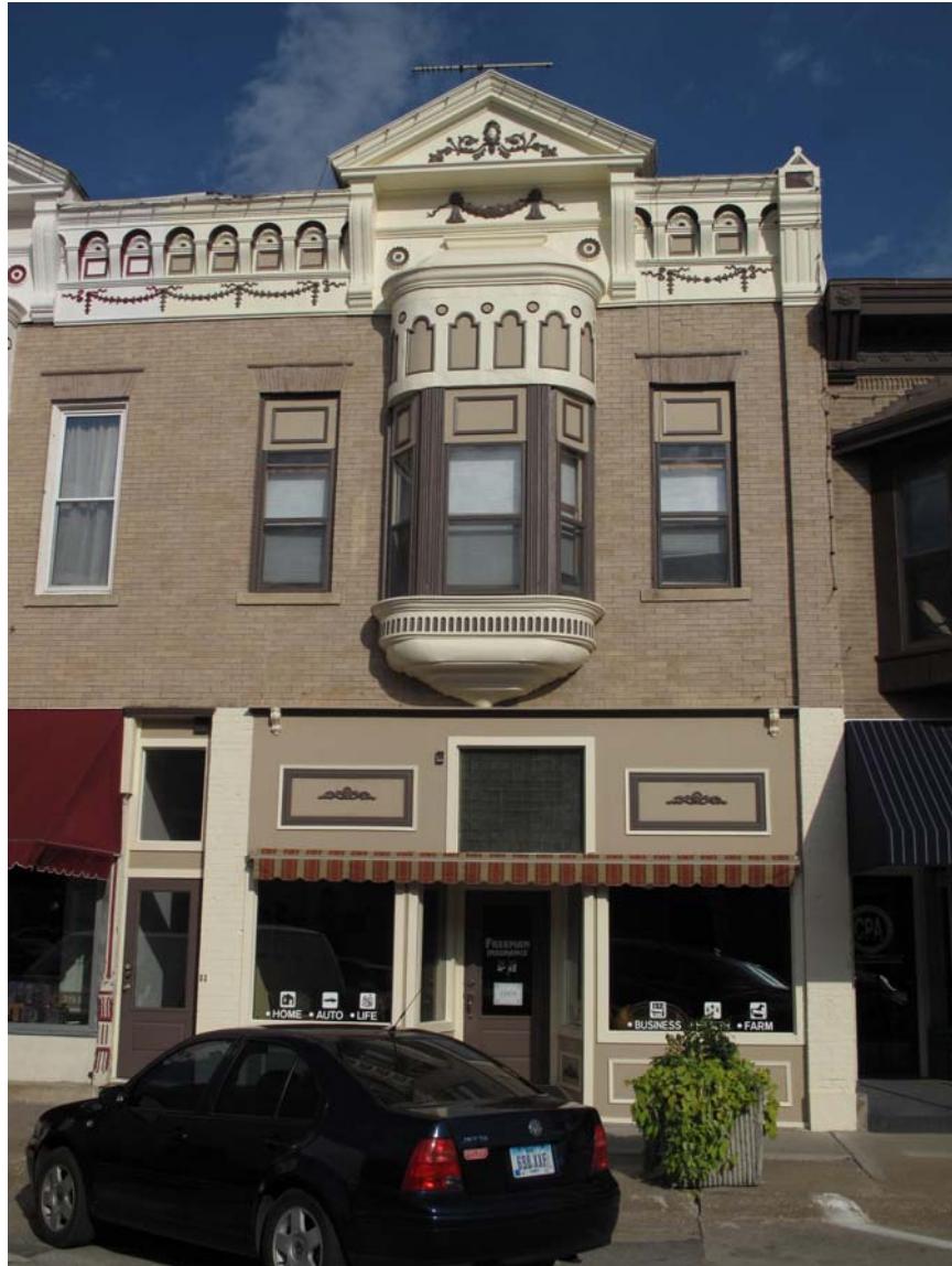
Photograph 92-00518-003 - Detail of 204 section, looking east