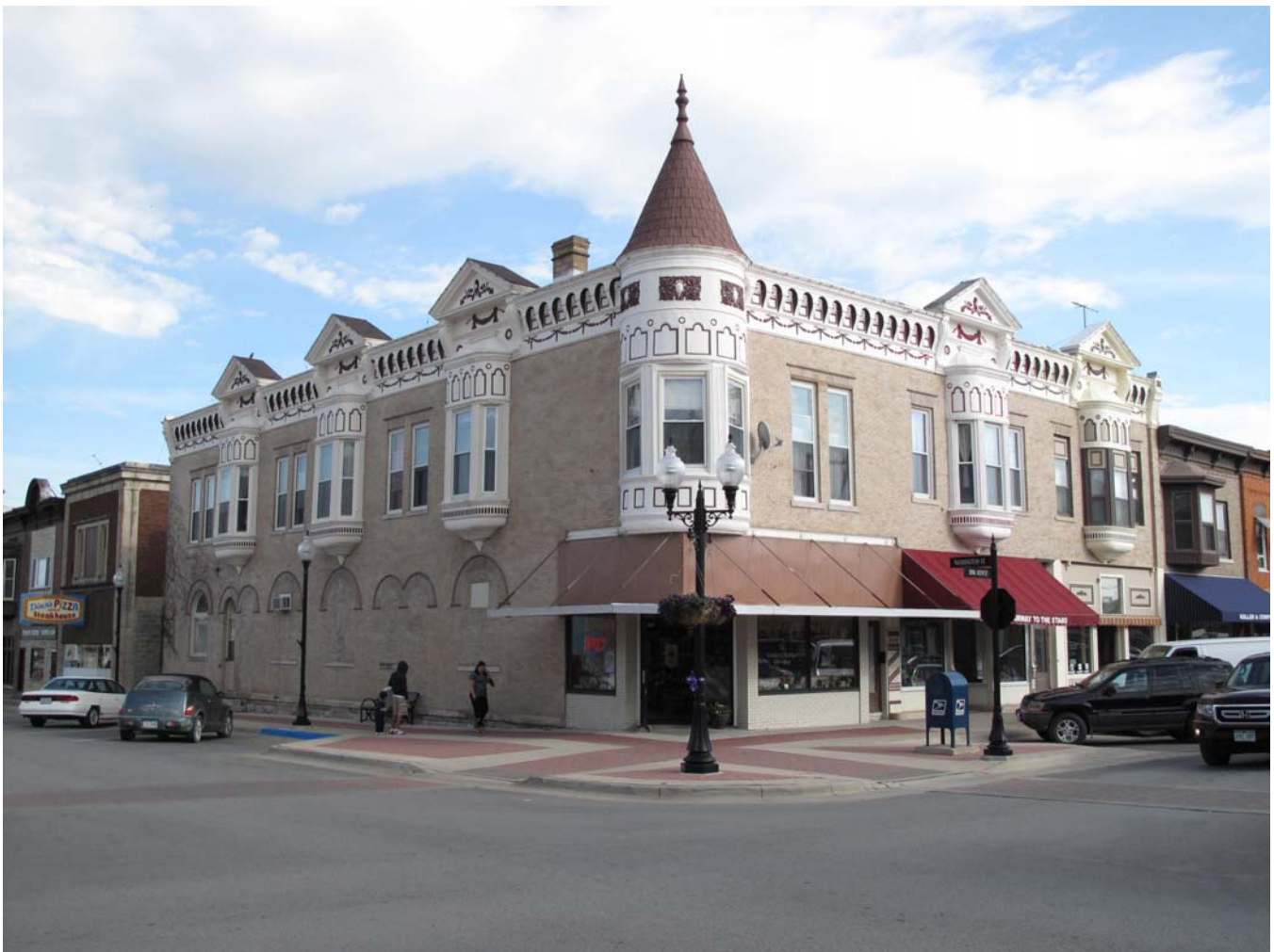
Photograph 92-00518-001 - North and west sides, looking southeast