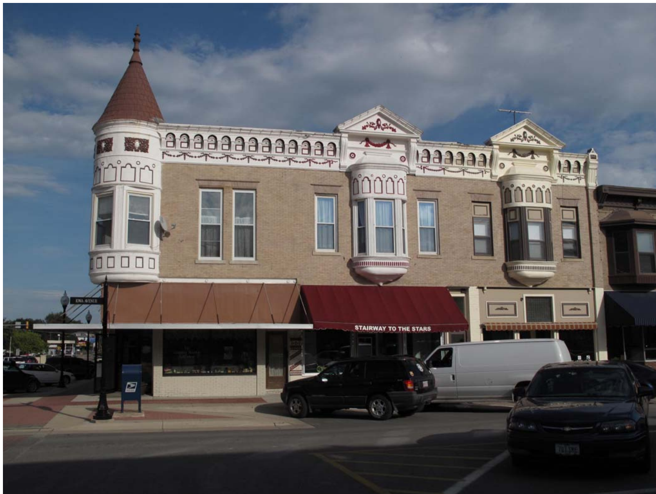
Photograph 92-00518-002 - West side, looking east (, September 20, 2011)