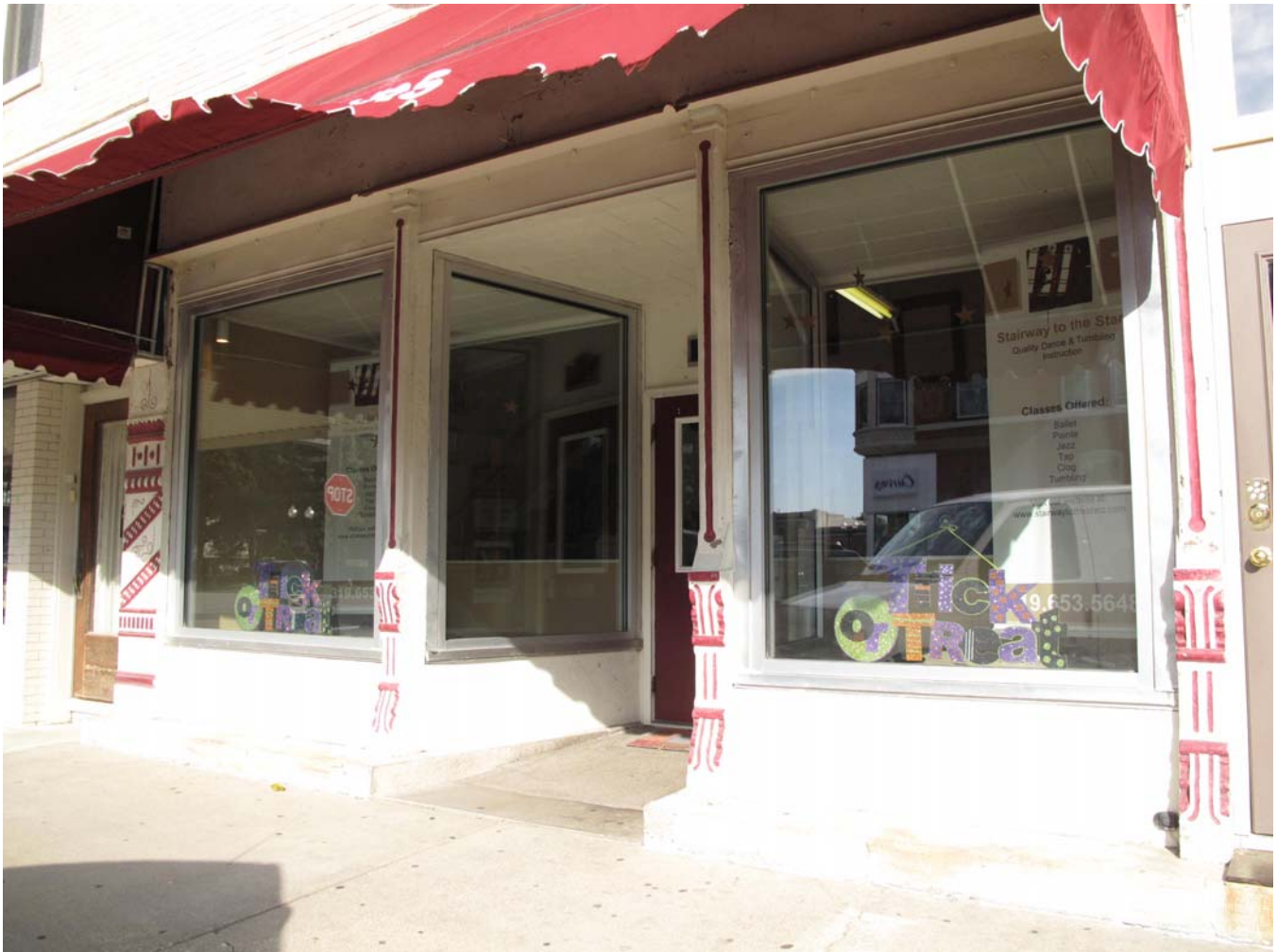
Photograph 92-00518-006 - 202 storefront, looking northeast