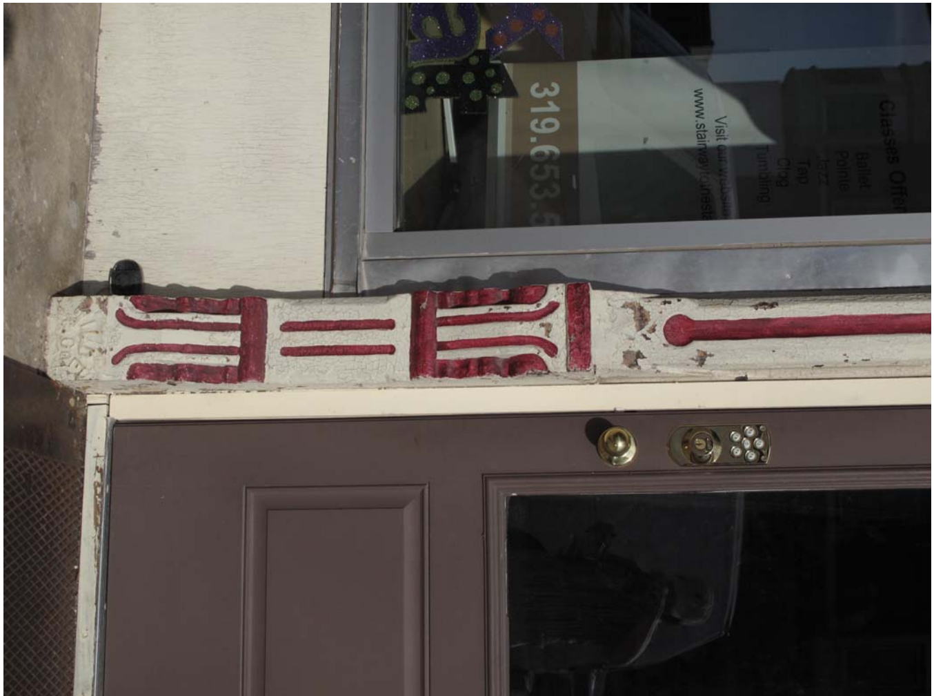
Photograph 92-00518-008 - Middle column of 202 storefront, looking east (, September 20, 2011)