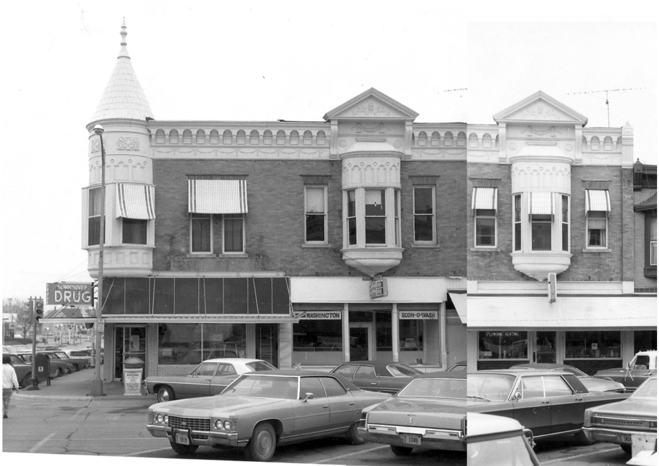
West side of building in 1971 (Wagner 1971)