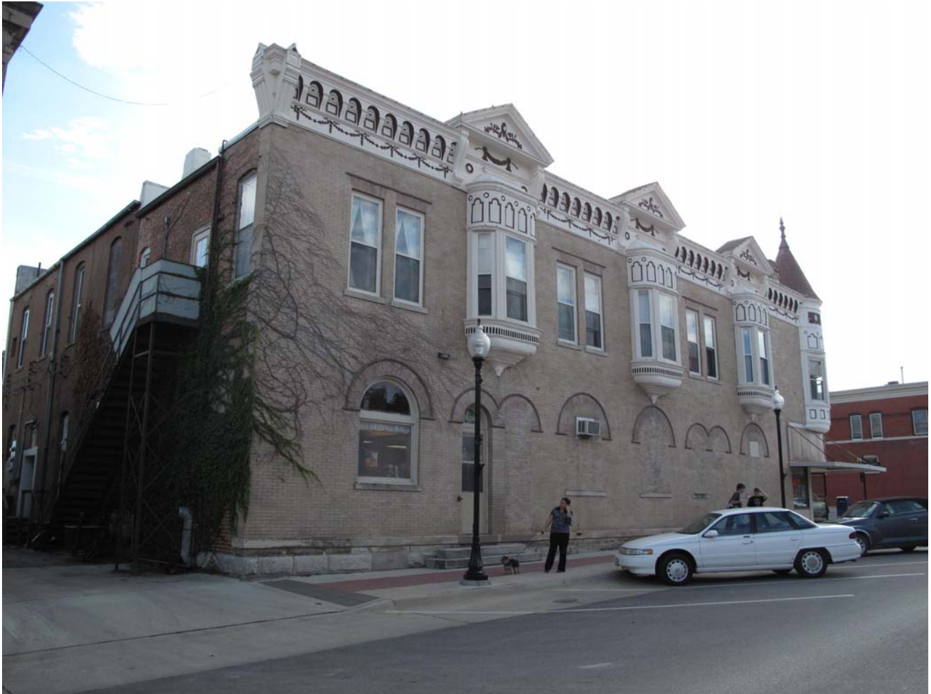
Photograph 92-00518-004 - East and north sides, looking southwest (, September 20, 2011)