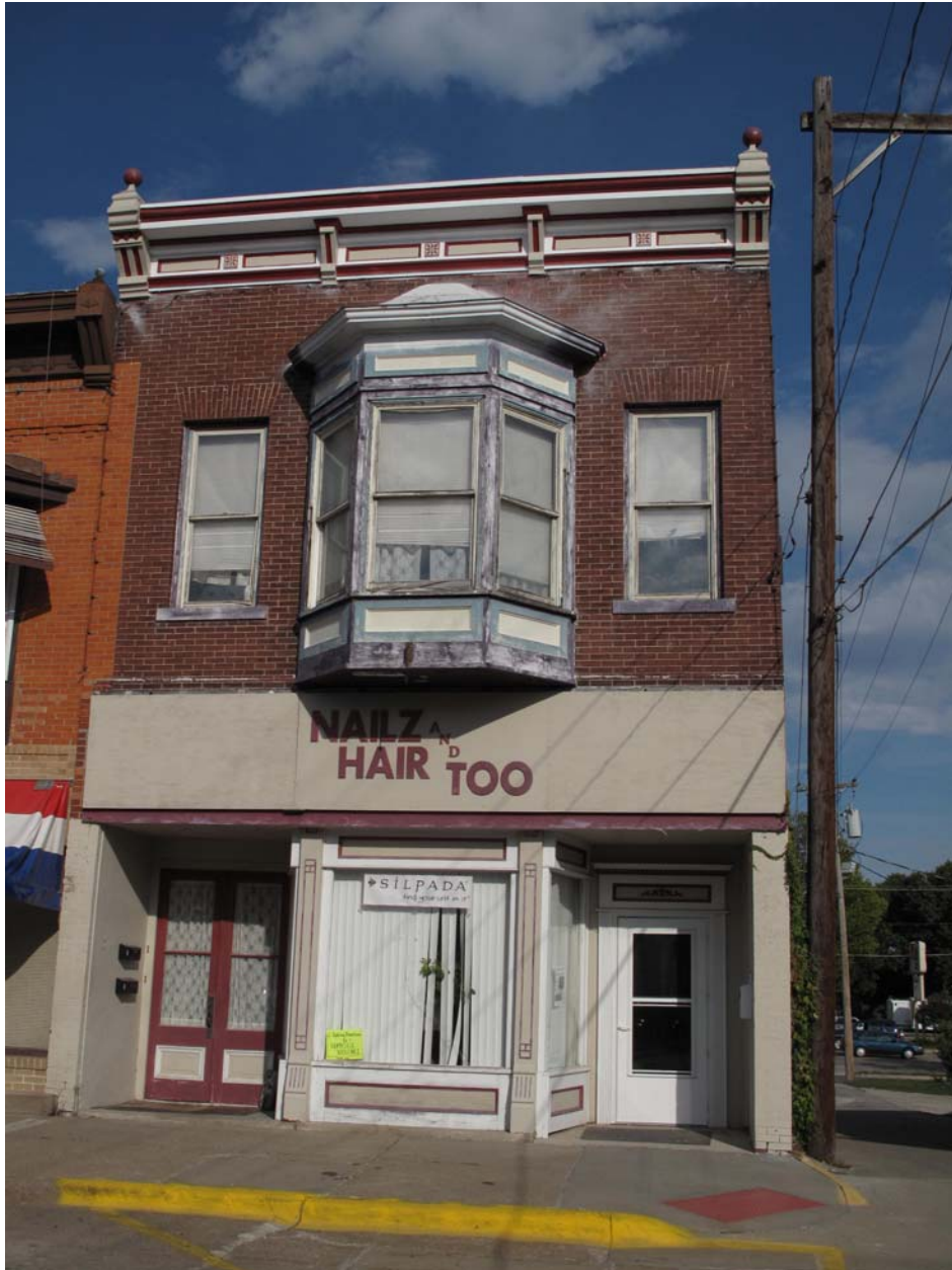
Photograph 92-00521-003 - West elevation, looking east