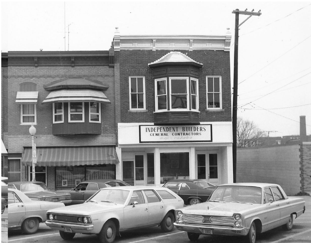
Building in 1971 (Wagner 1971)