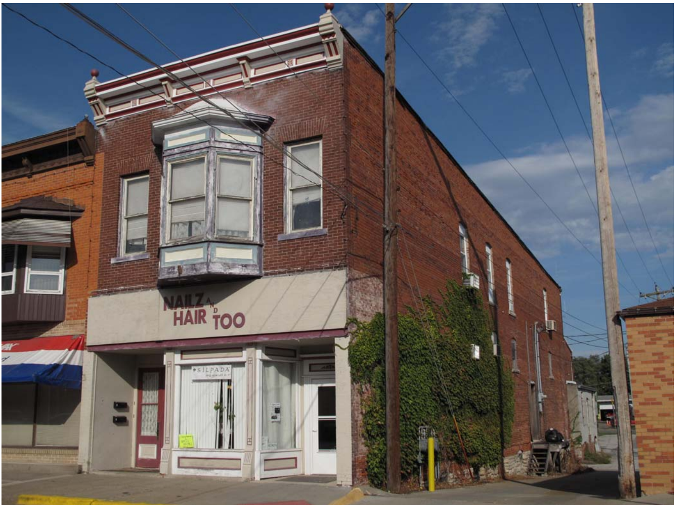
Photograph 92-00521-001 - West and south elevations, looking northeast