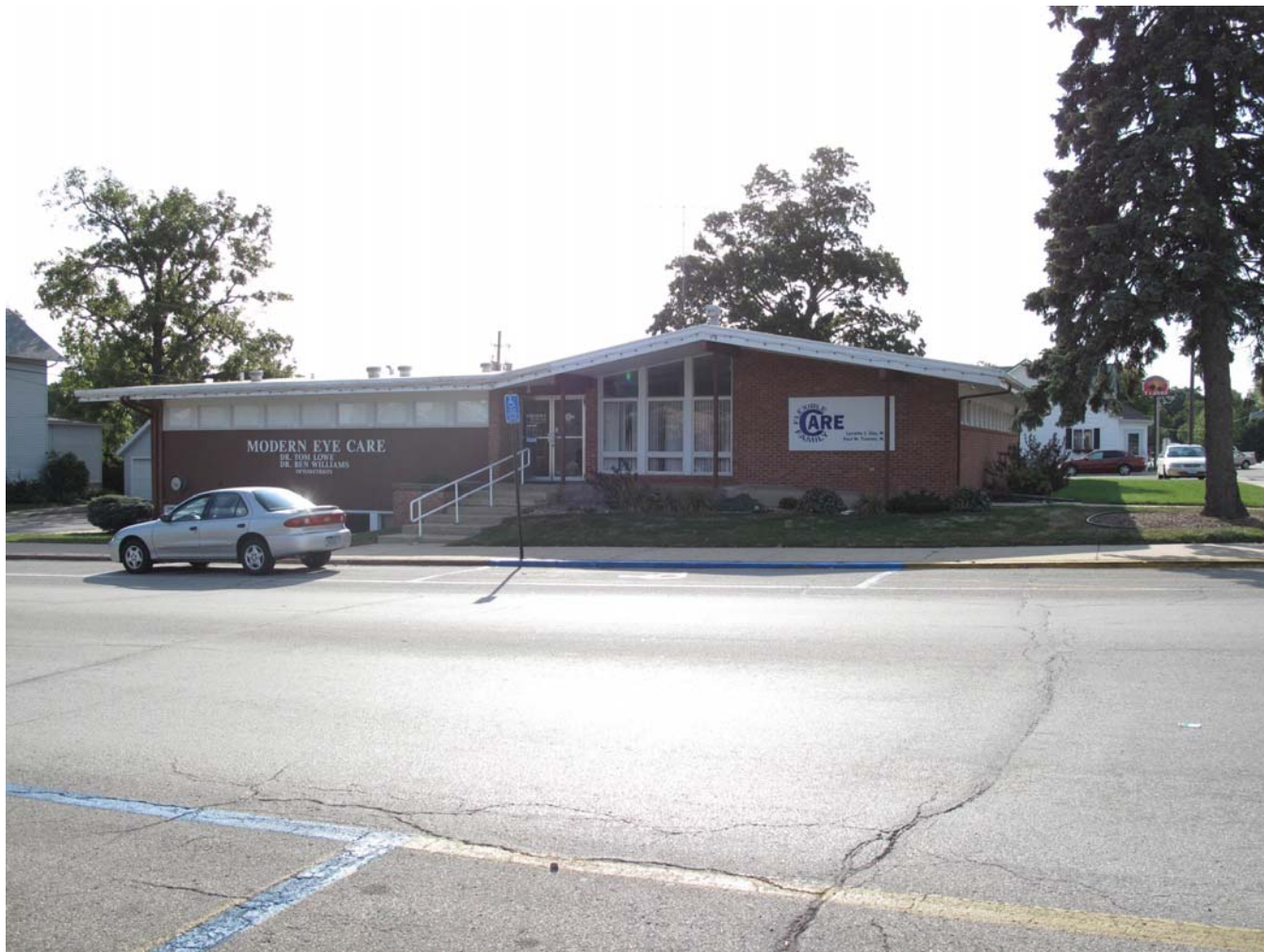
Photograph 92-00529-002 - East elevation, looking west