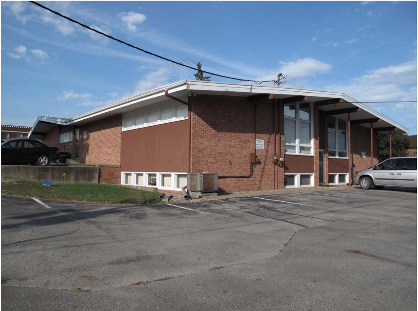
Photograph 92-00529-004 - West and south elevations, looking northeast