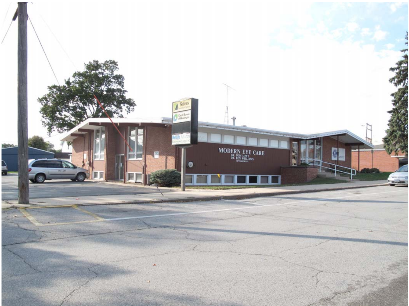
Photograph 92-00529-001 - South and east elevations, looking northwest