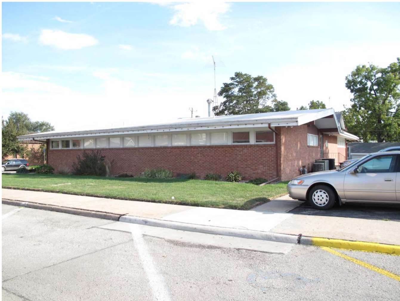
Photograph 92-00529-003 - North and west elevations, looking southeast