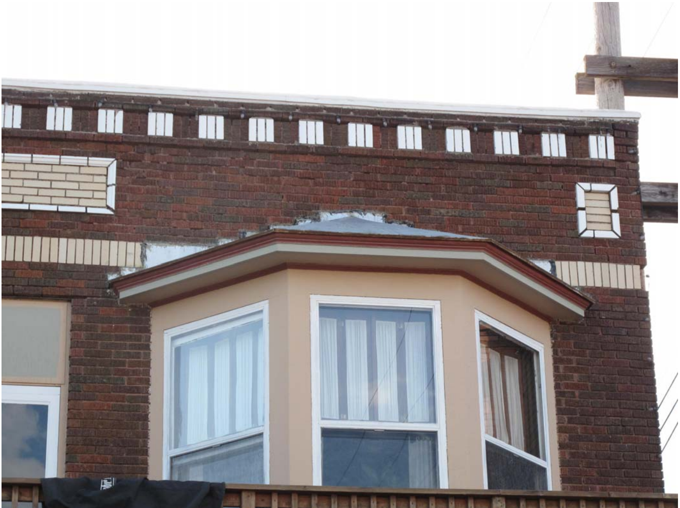
92-00523-003 - Detail on east elevation, looking west