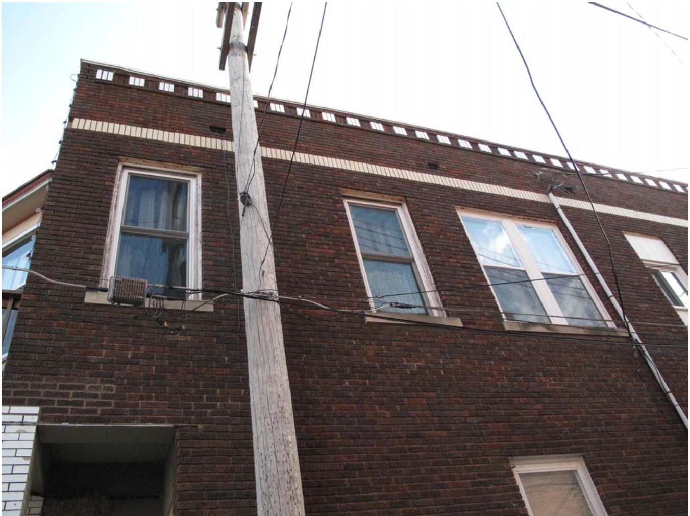
92-00523-005 - Detail on north elevation, looking south (, September 20, 2011)