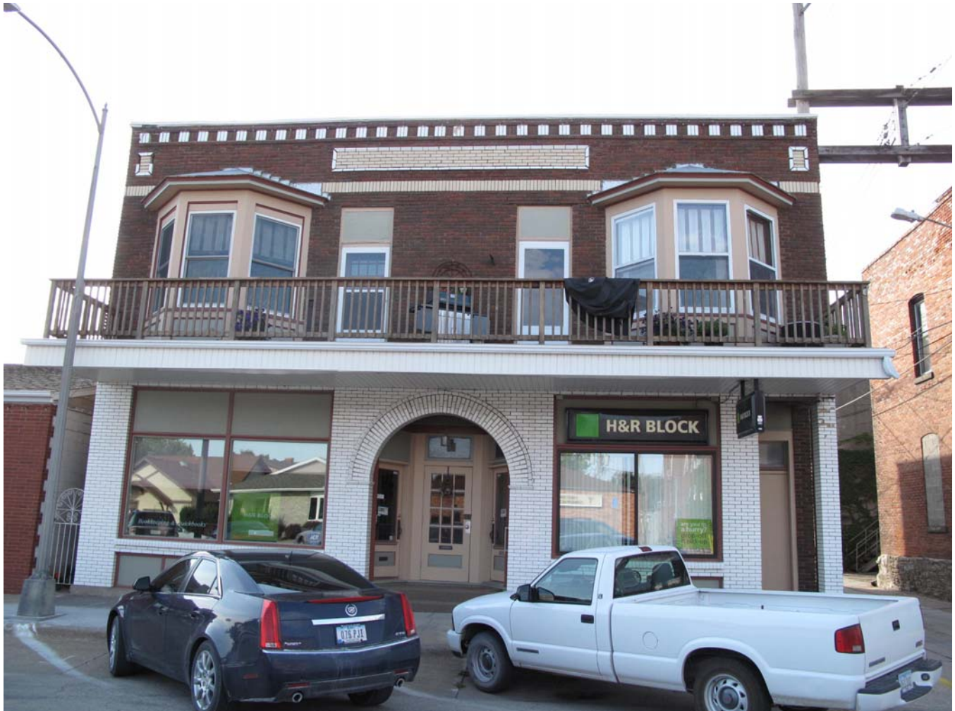
92-00523-002 - East elevation, looking west (, September 20, 2011)