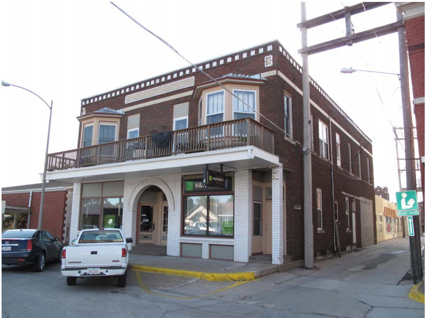
92-00523-001 - East and north elevations, looking southwest (, September 20, 2011)