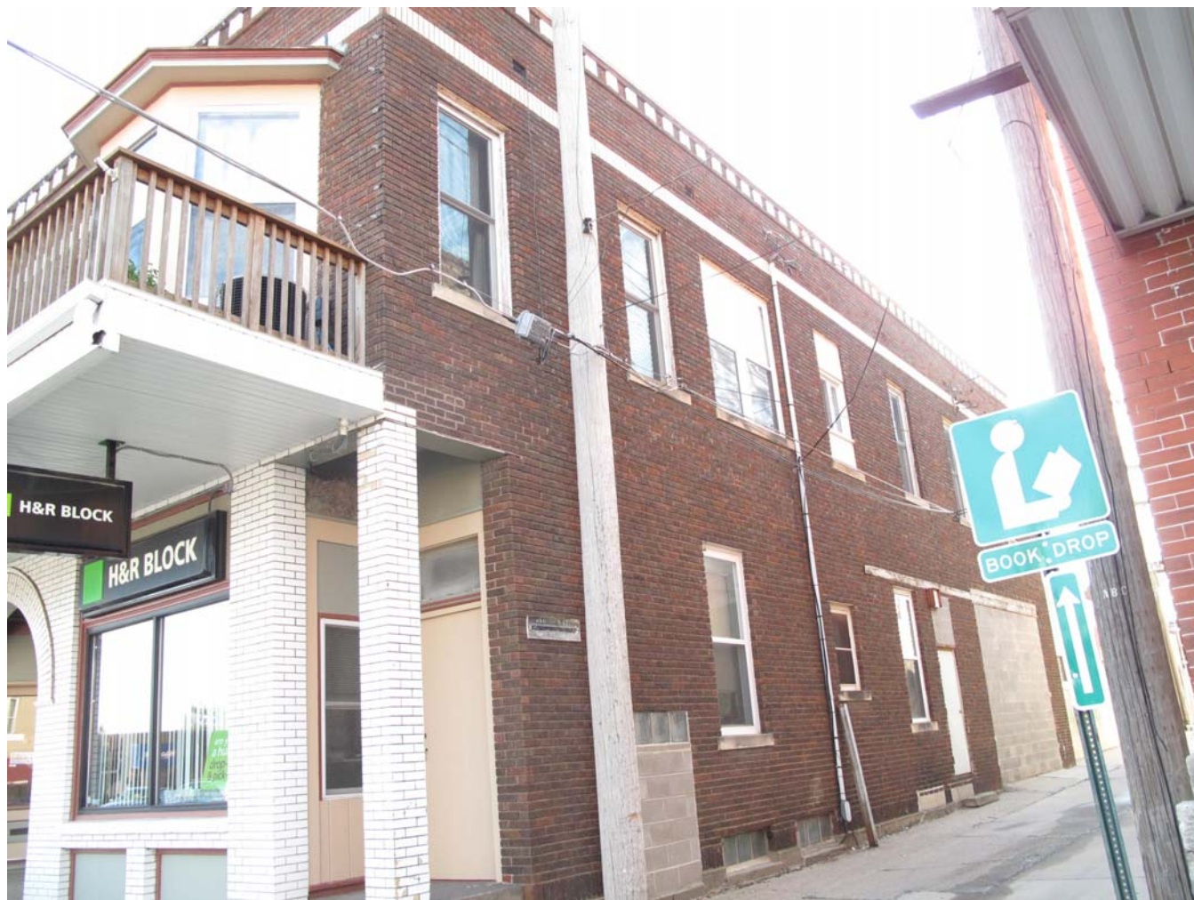
92-00523-004 - North elevation, looking southwest (, September 20, 2011)