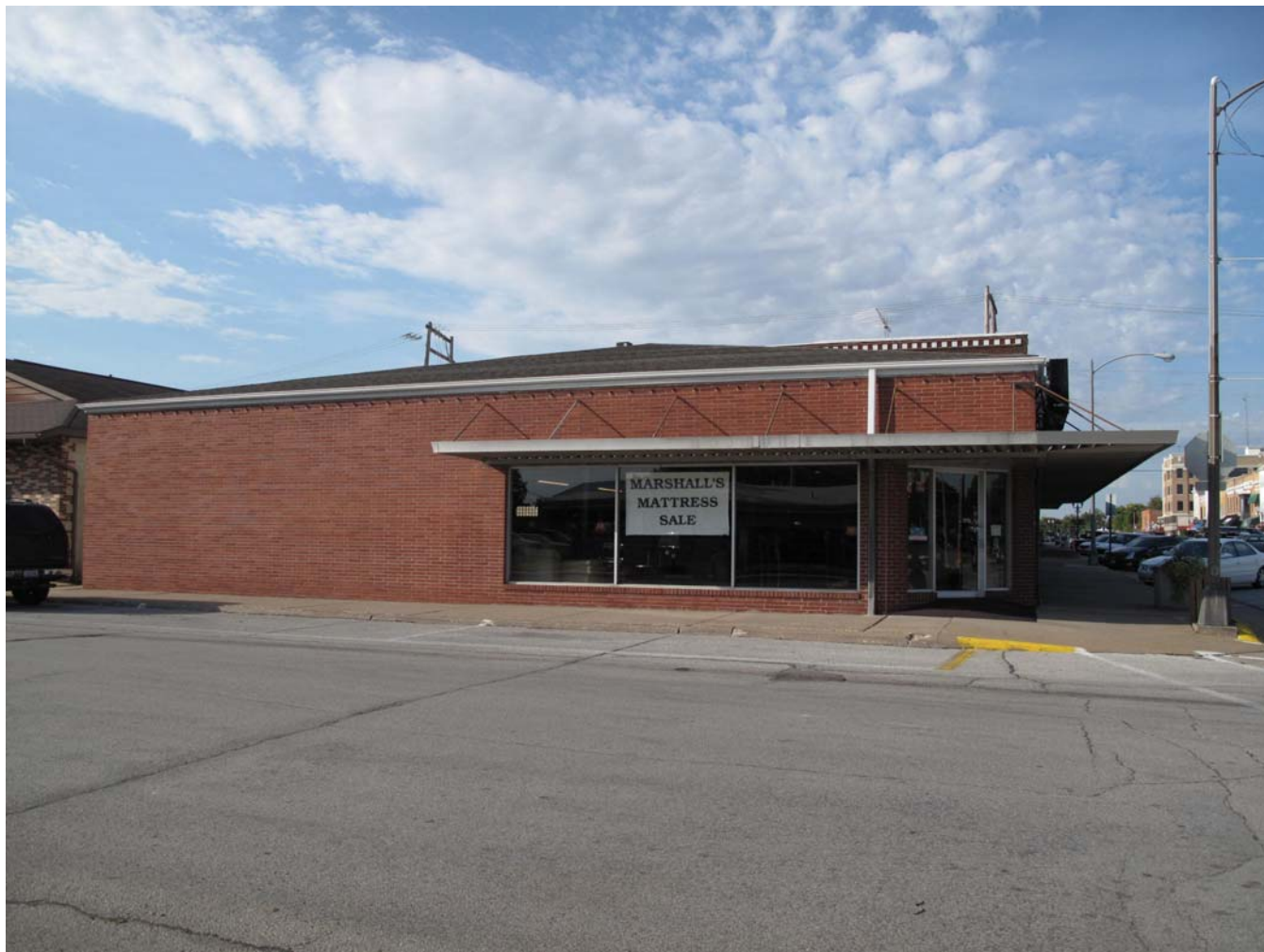
Photograph 92-00525-002 - South elevation, looking north