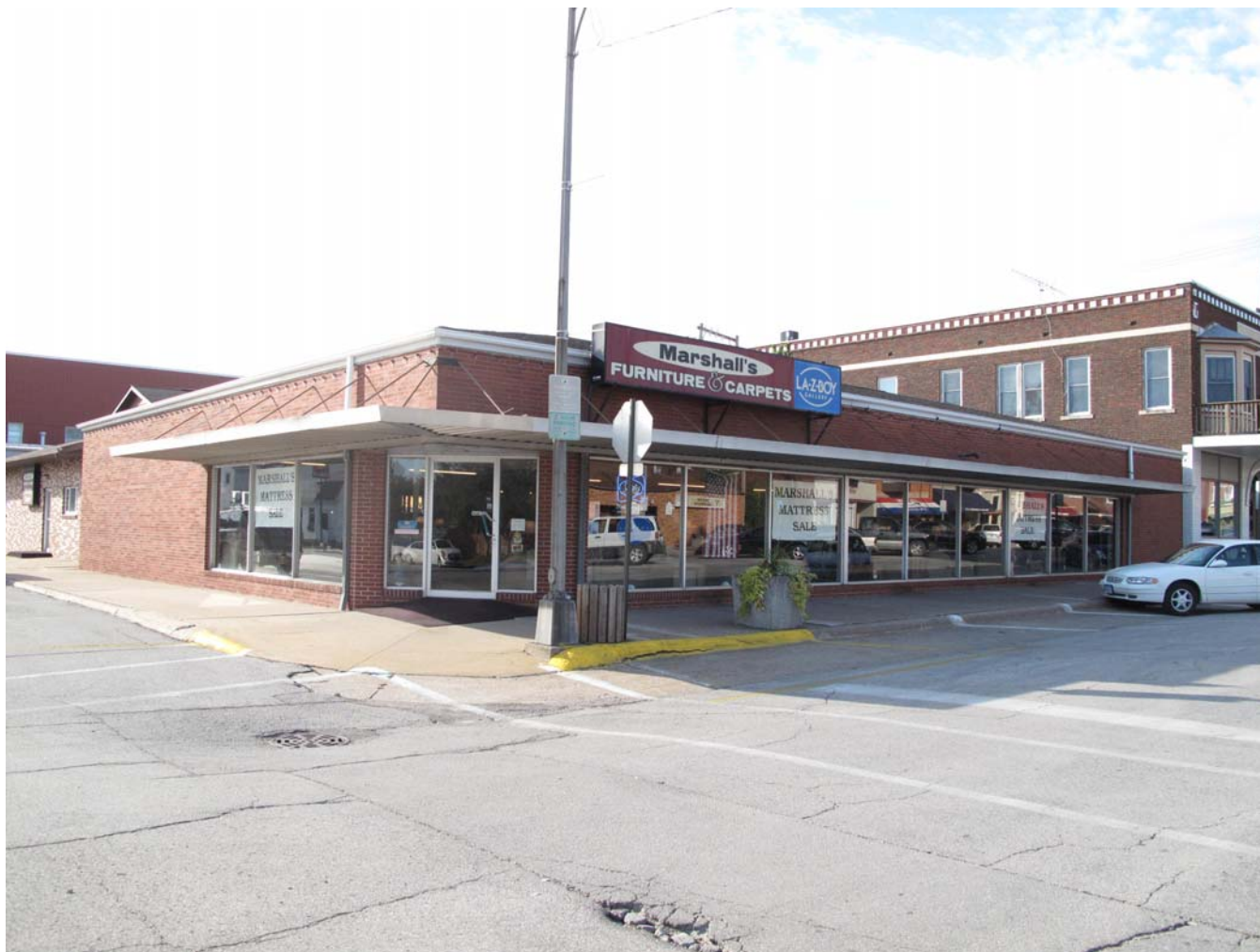
Photograph 92-00525-001 - South and east elevations, looking northwest