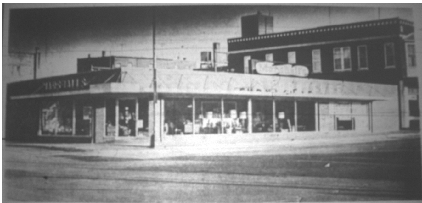
Bicentennial Edition, Evening Journal , July 1, 1976, page 29