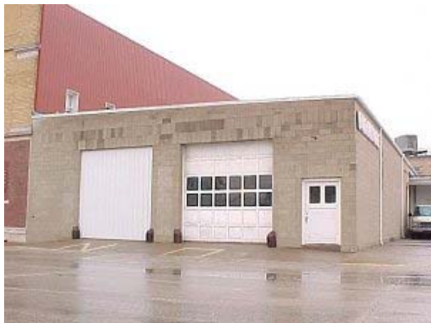
assessor photo of building prior to addition in 2003