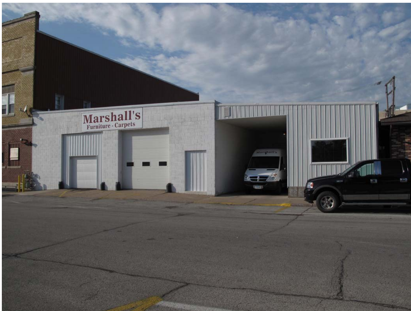
Photograph 92-00527-001 - South elevation, looking north