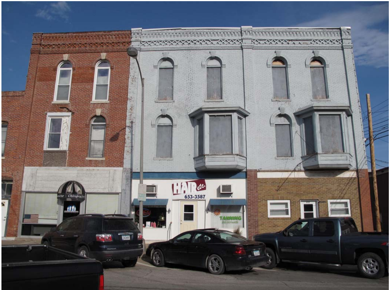
Photograph 92-00596-002 - West elevation, looking east