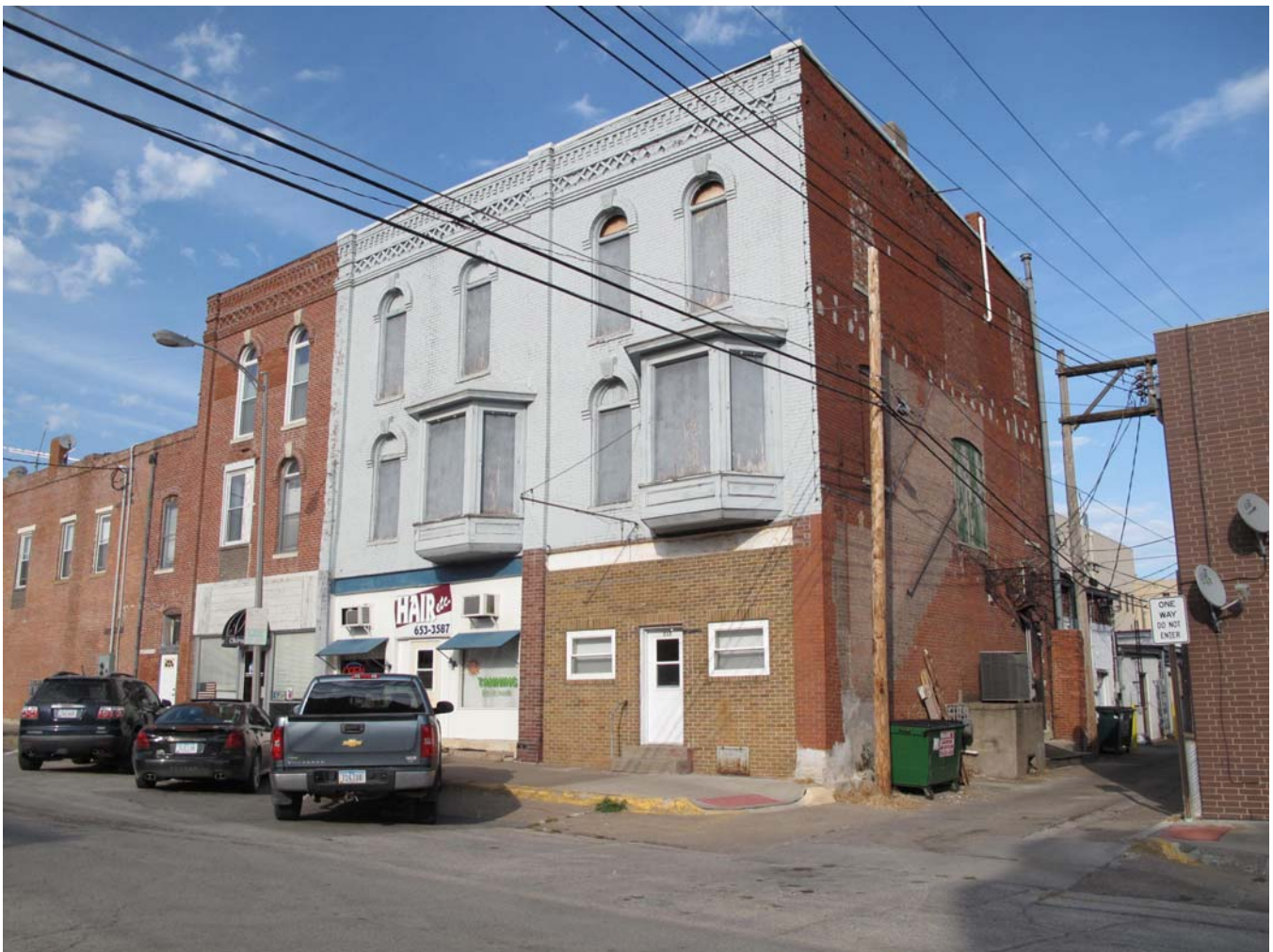
Photograph 92-00596-001 - West and south elevations, looking northeast