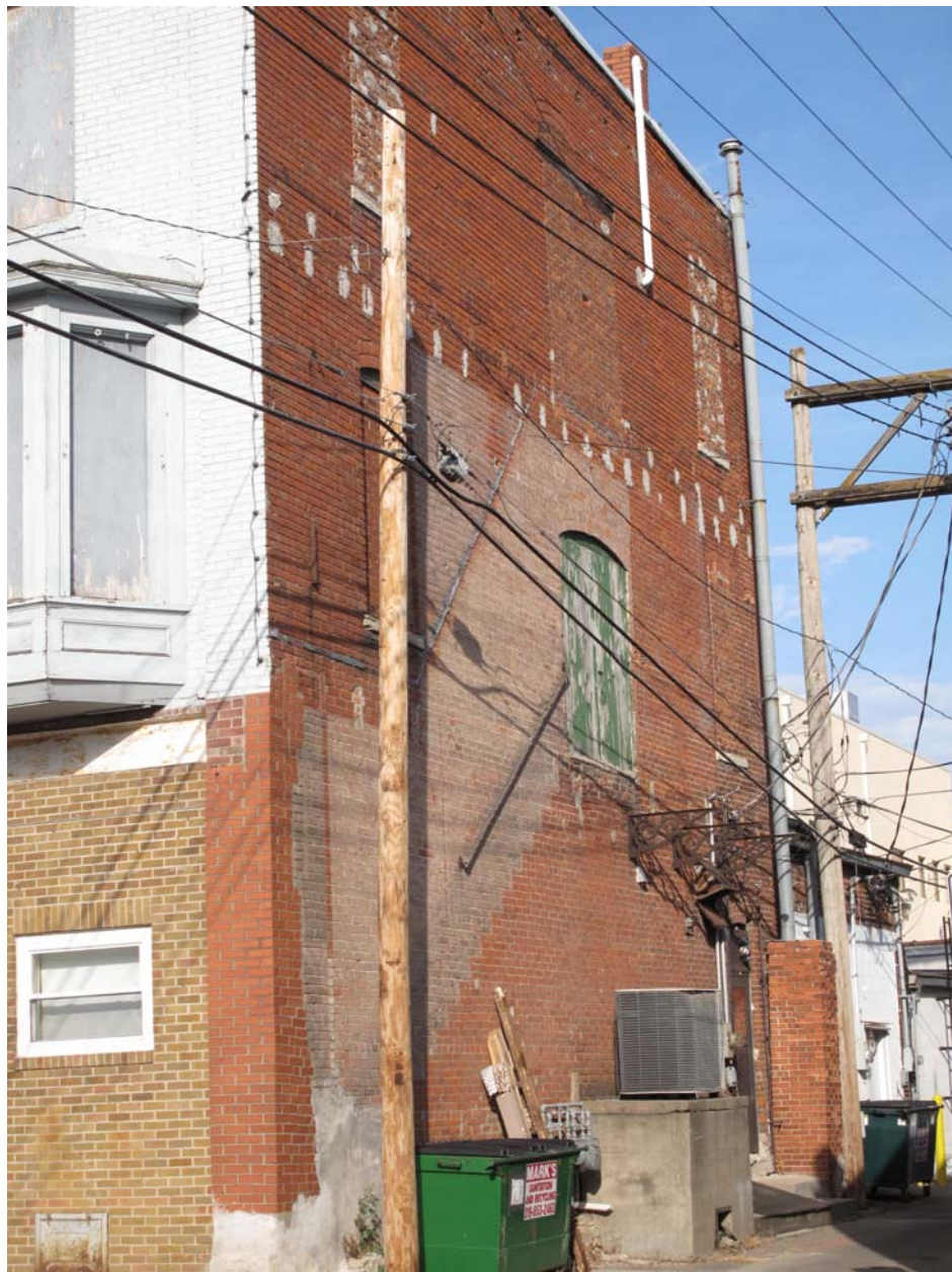
Photograph 92-00596-004 - South elevation, looking northeast