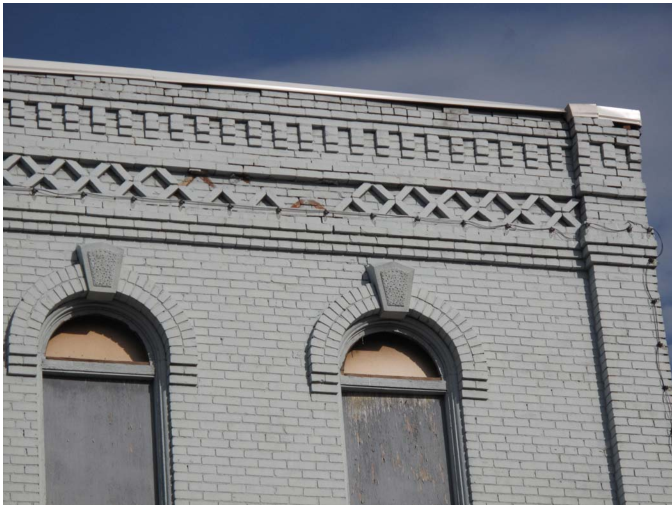
Photograph 92-00596-003 - West elevation, looking east