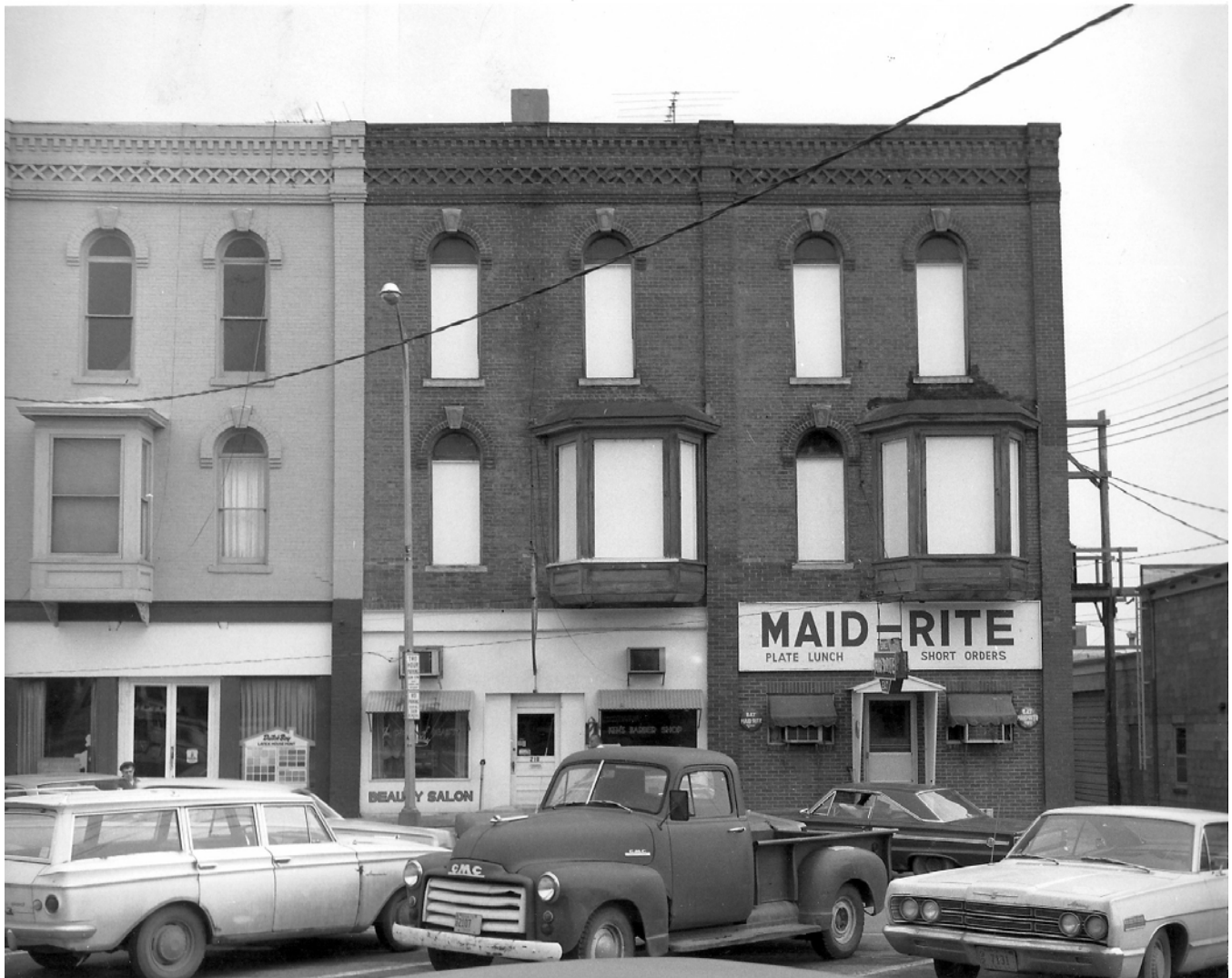
Building in 1971 (Wagner 1971)