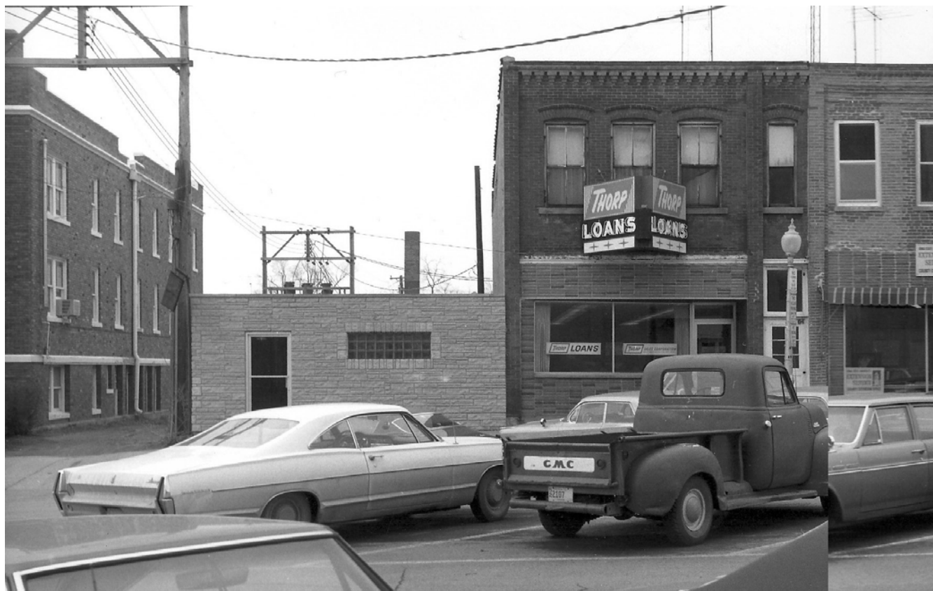
Building in 1971 (Wagner 1971)