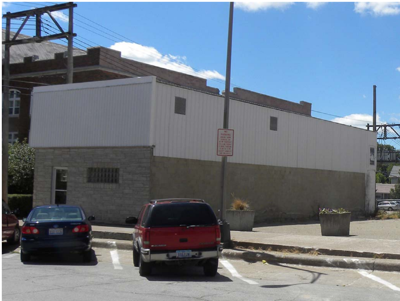
Photograph 92-00571-002 - East and north elevations, looking southwest