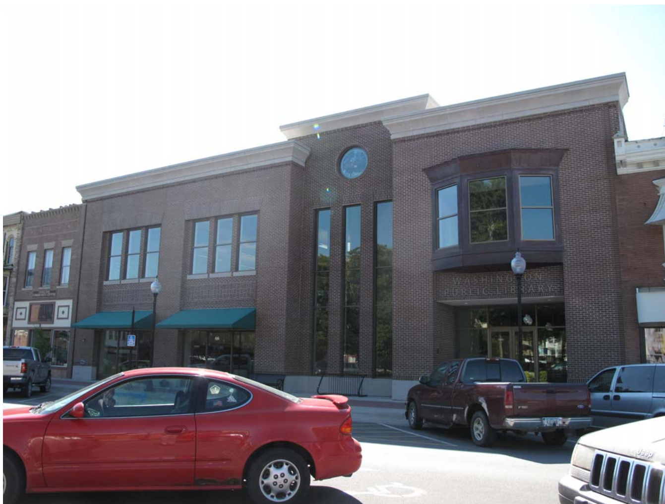
Photograph 92-00604-001 - North elevation, looking south