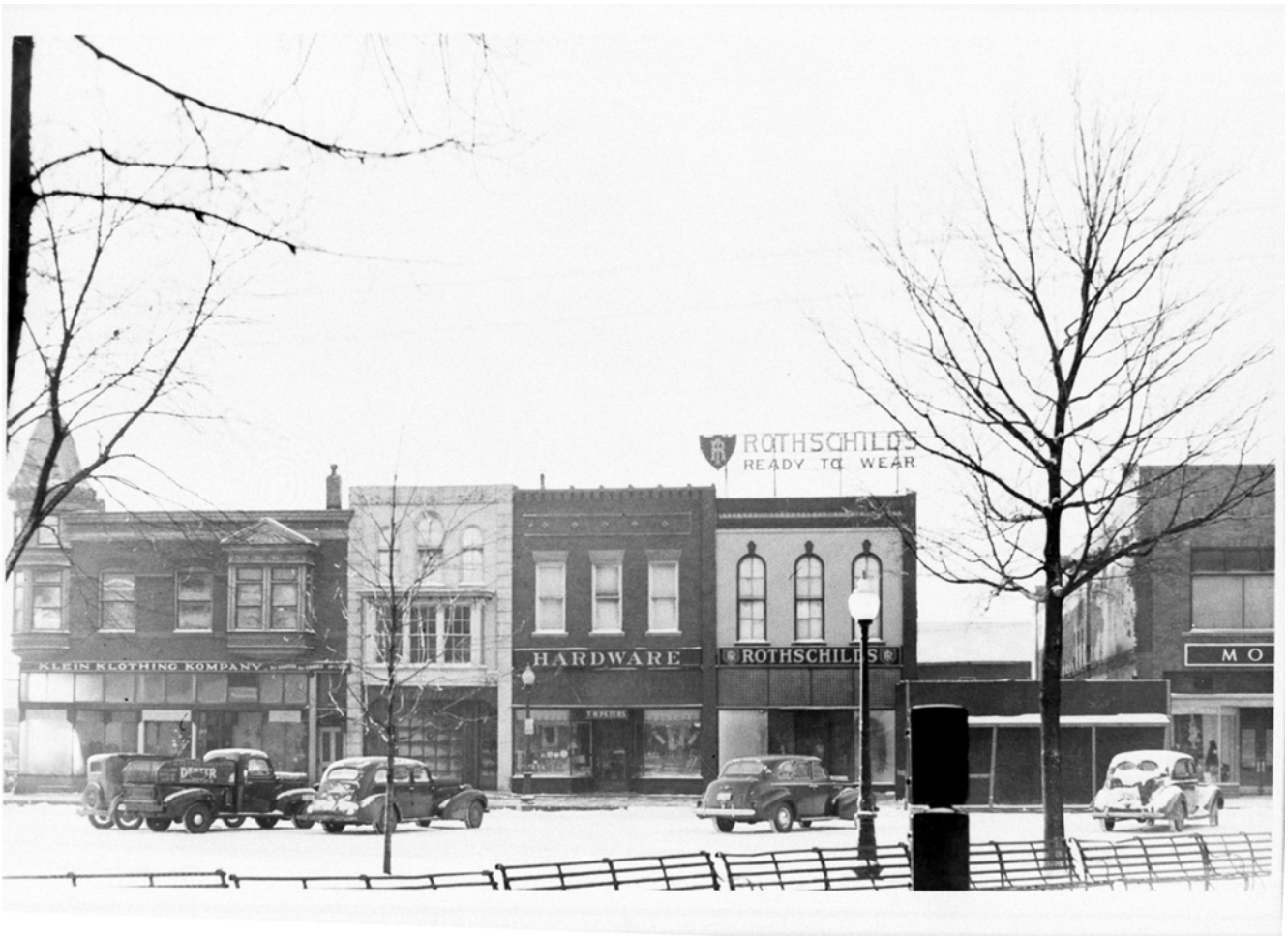
South side of the square in the late 1930s