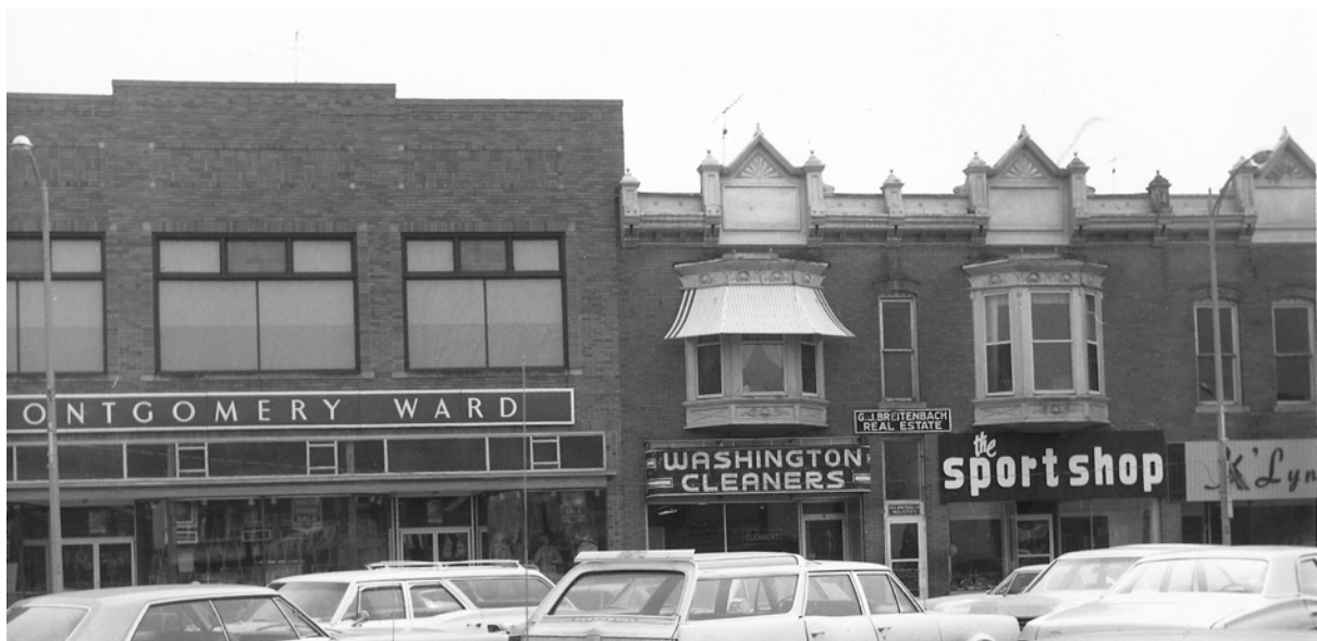
Buildings on site of future library in 1971 (Wagner 1971)