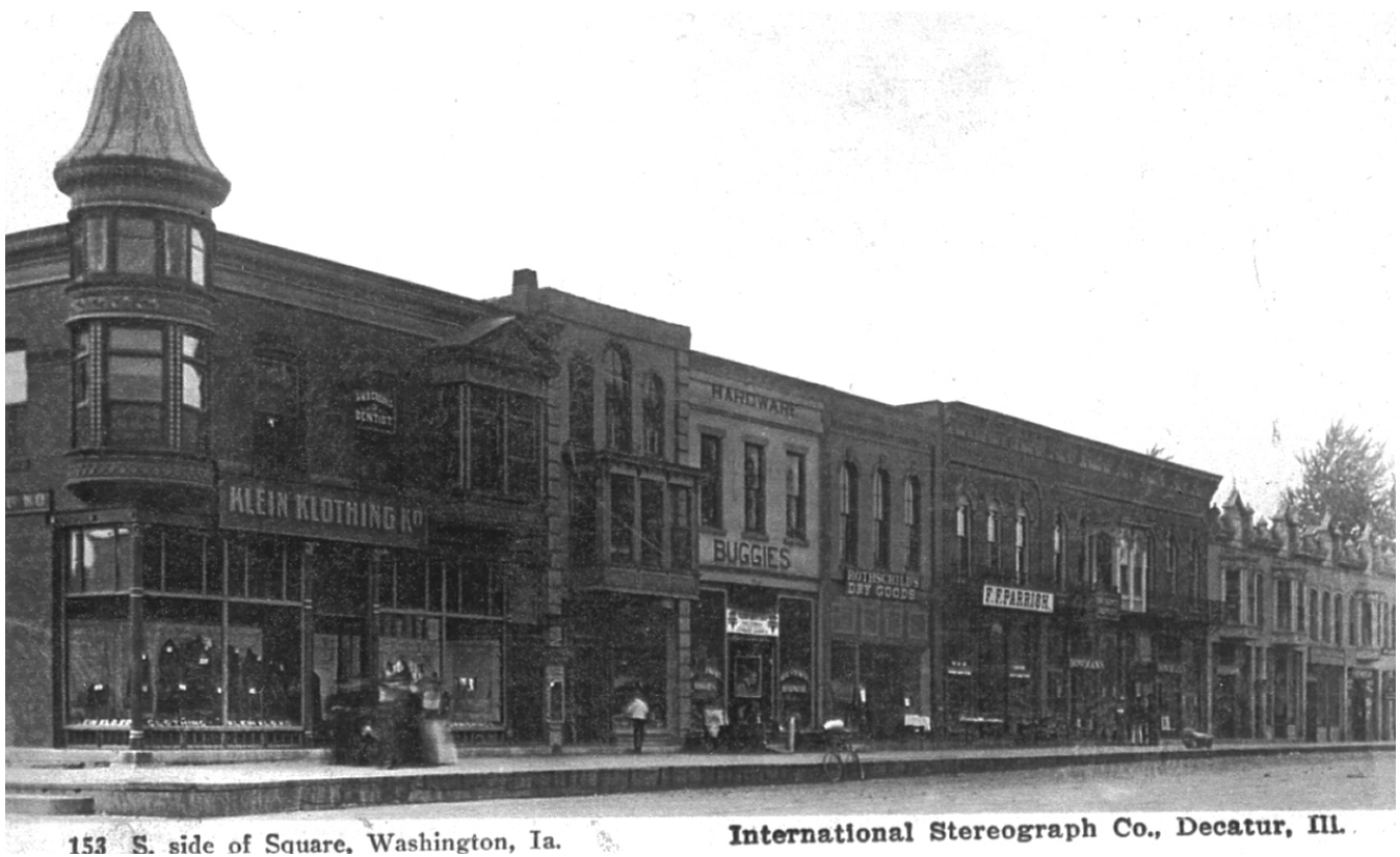
South side of the square in the 1910s