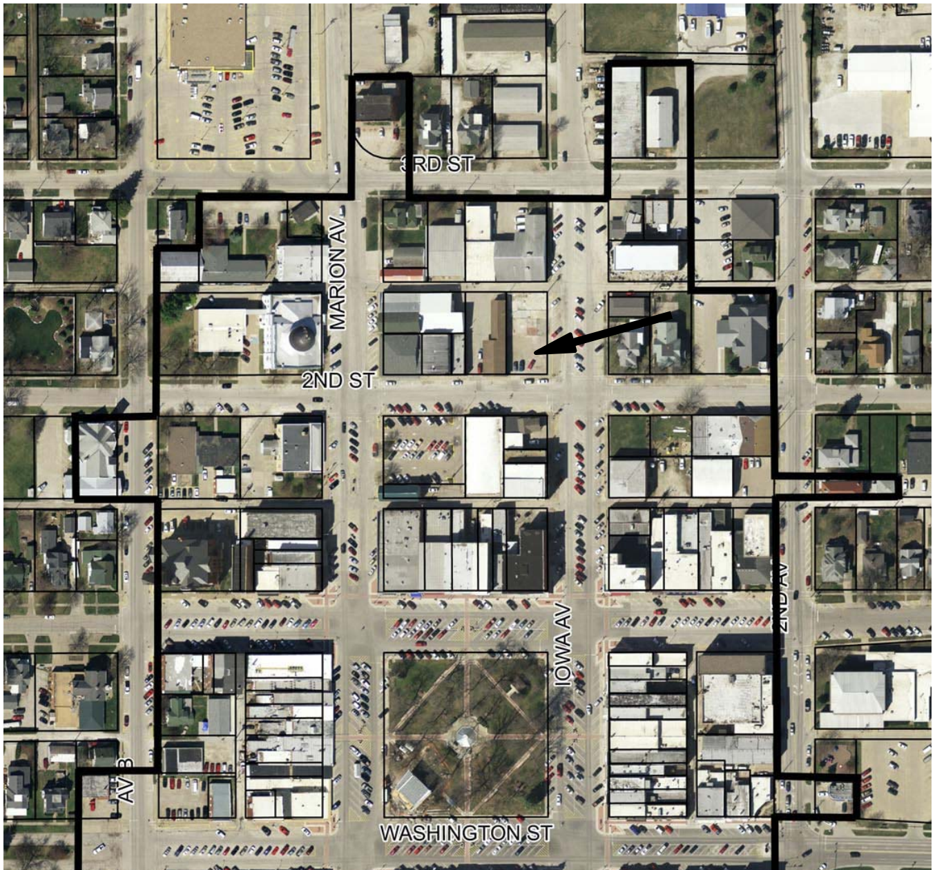
2009 aerial photograph (Washington County) – line indicates survey/research area boundary