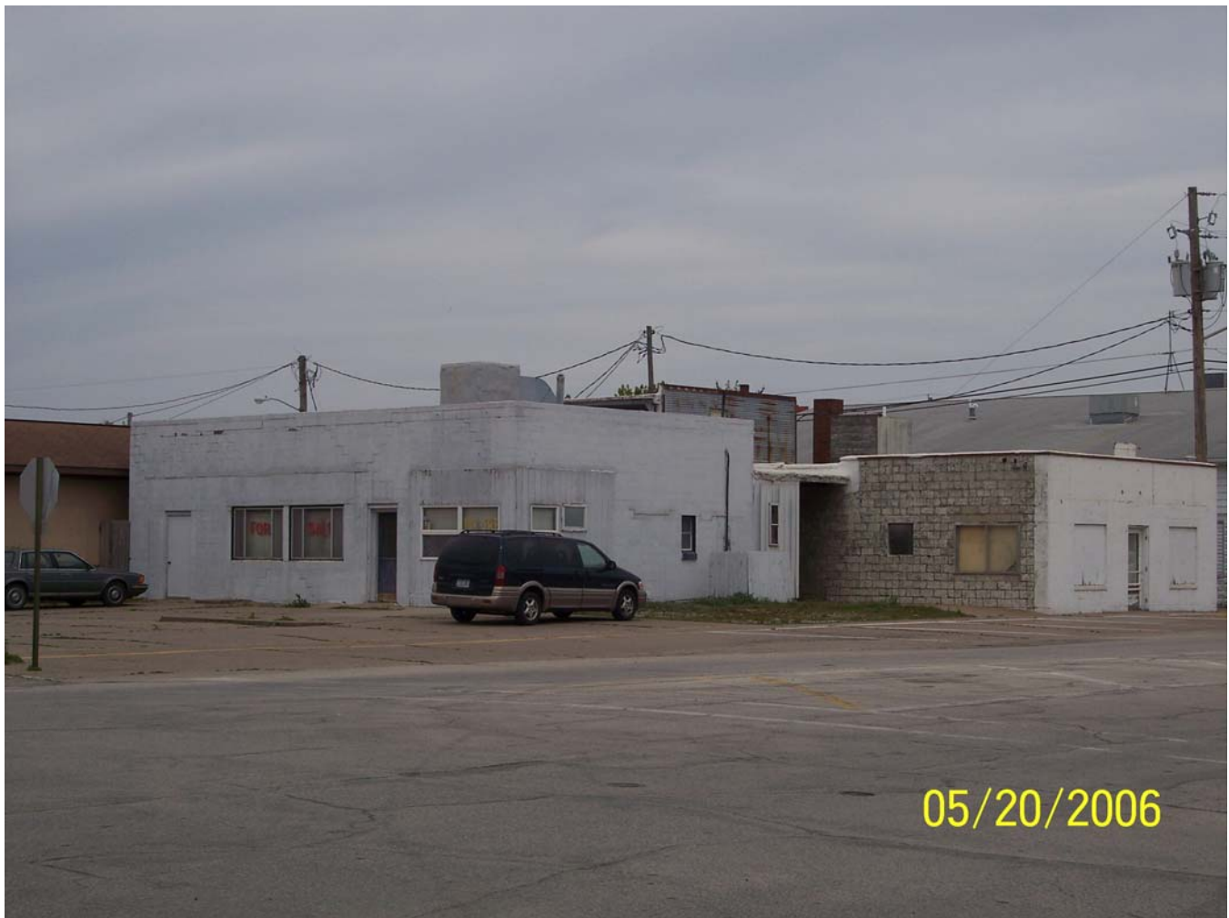
gas station at 201 N Iowa