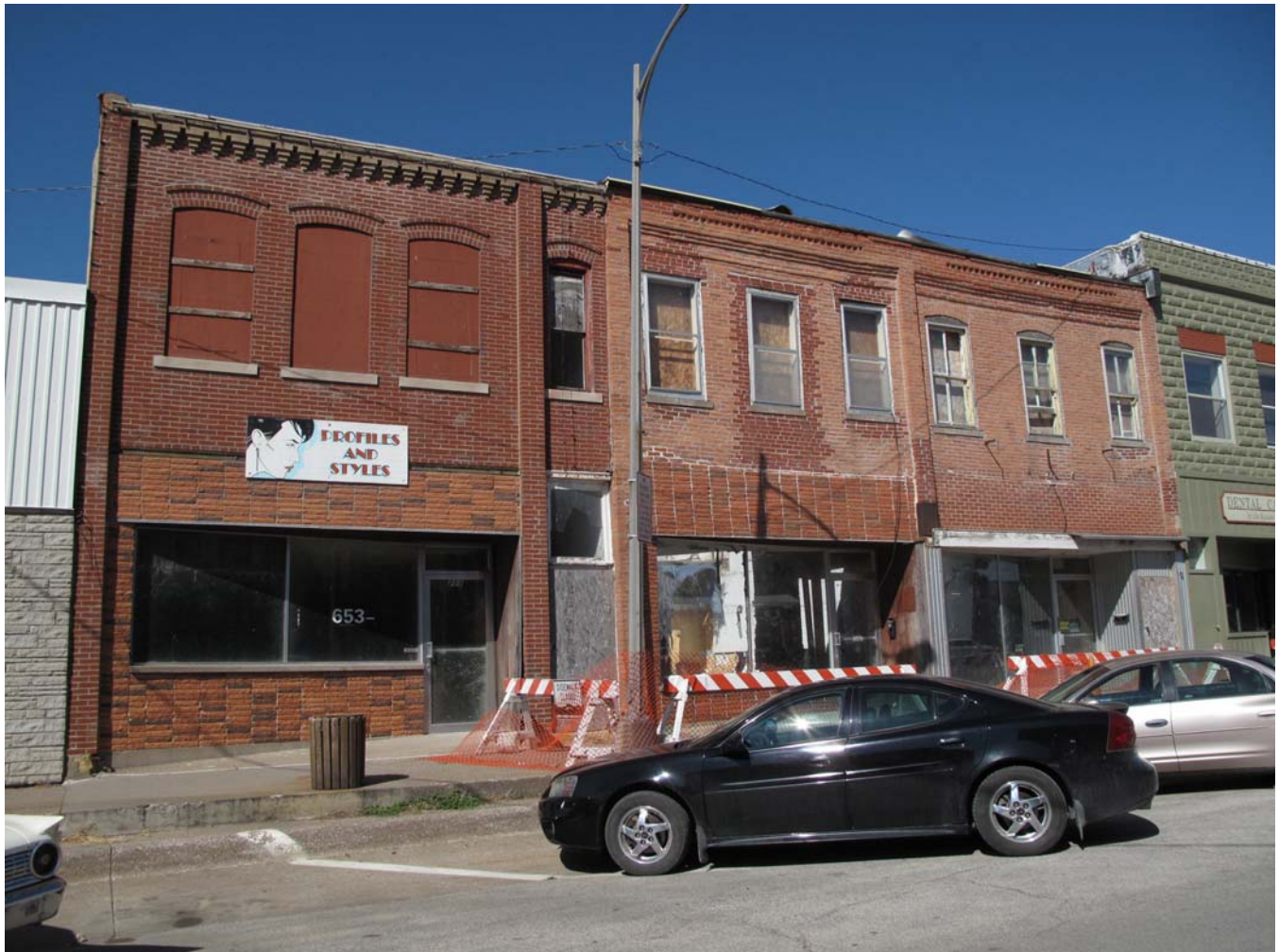
Photograph 92-00570-002 - East elevations of 211-209-207, looking west (September 20, 2011)