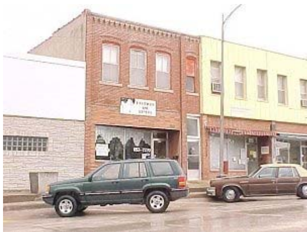
assessor photo - c.2008?