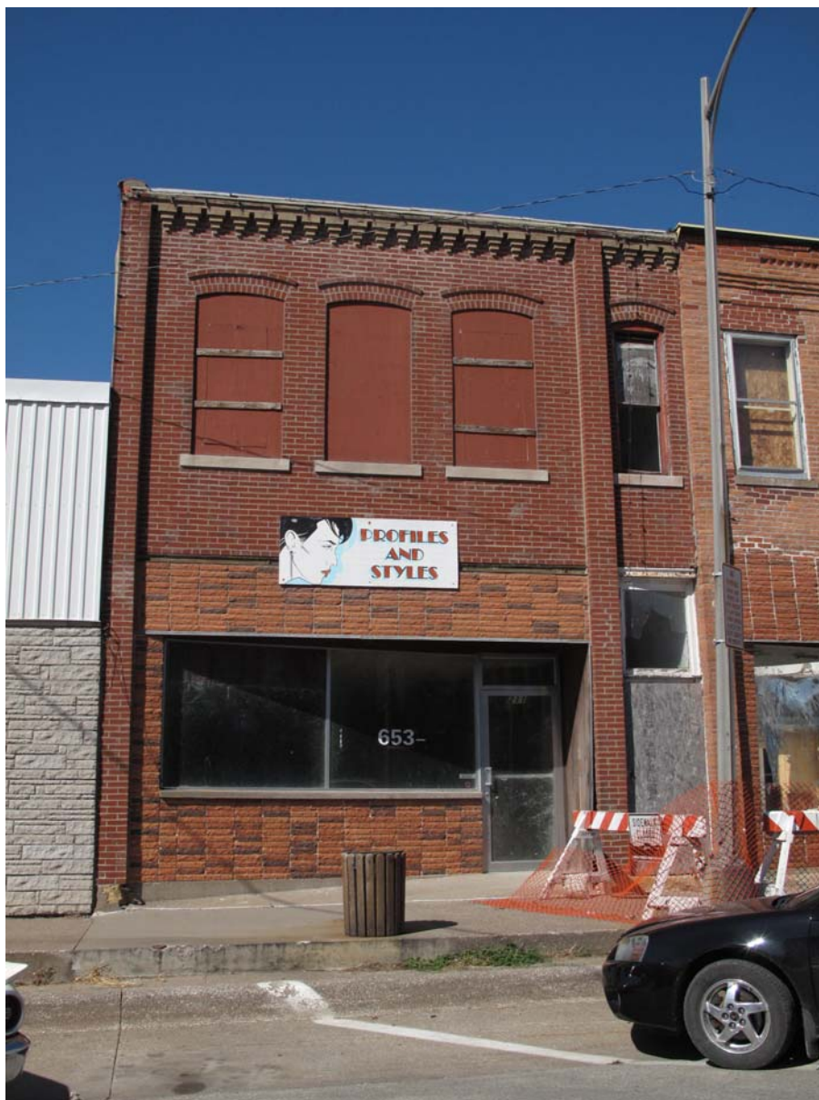
Photograph 92-00570-001 - East elevation, looking west (September 20, 2011)