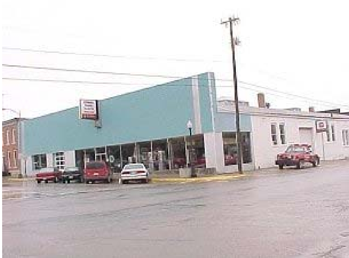
Assessor photo from c.2008 of 215-217 jointly clad with 221-225 to the west/right