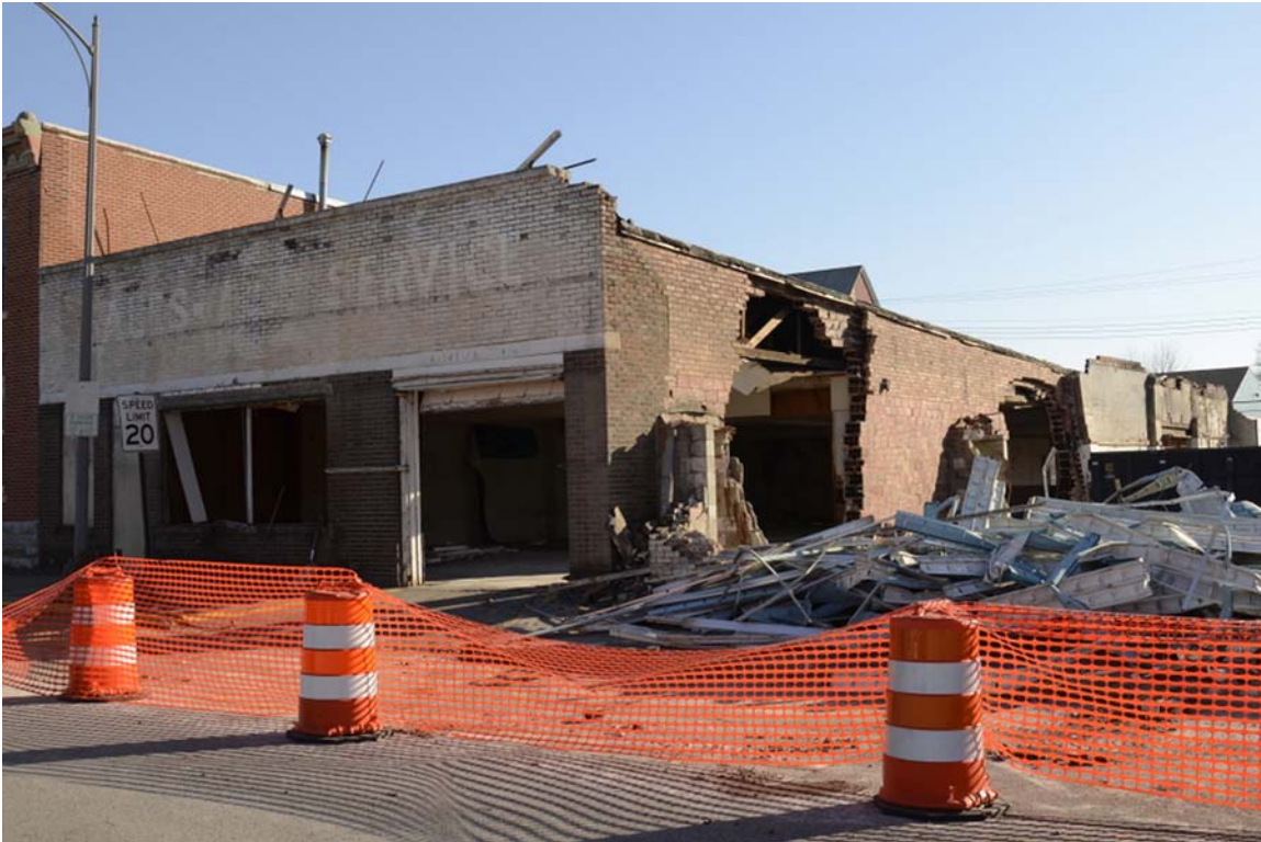
Photograph 92-00612-002 - North and west elevations of 215-217 W. Washington, looking southeast (December 2, 2010)