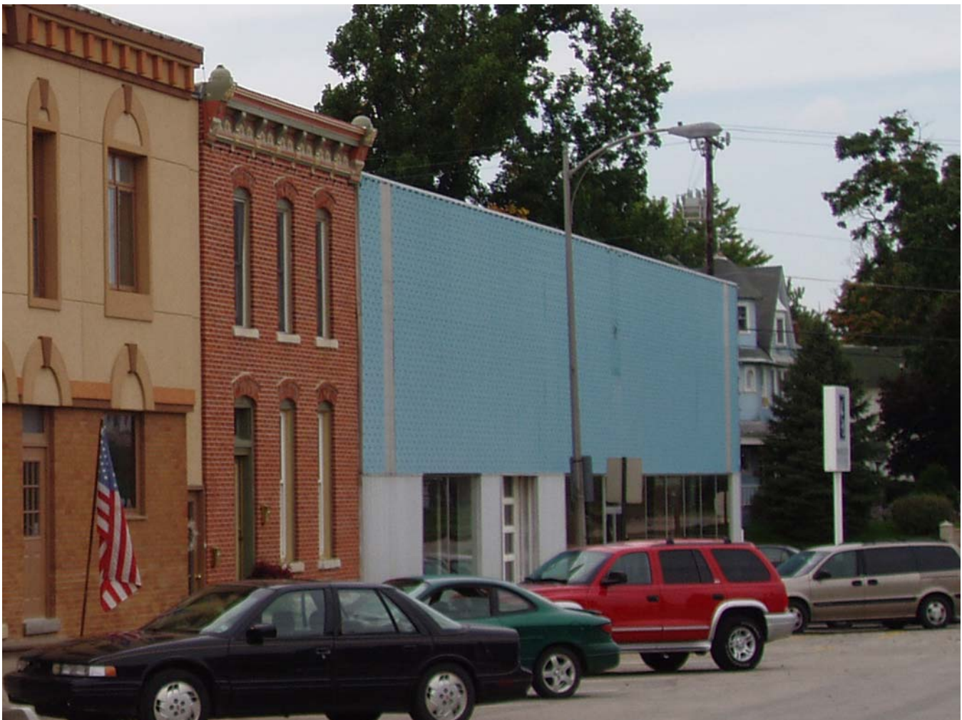
Photograph 92-00612-001 - North elevations of 215-217 and 221-225 W. Washington, looking southwest