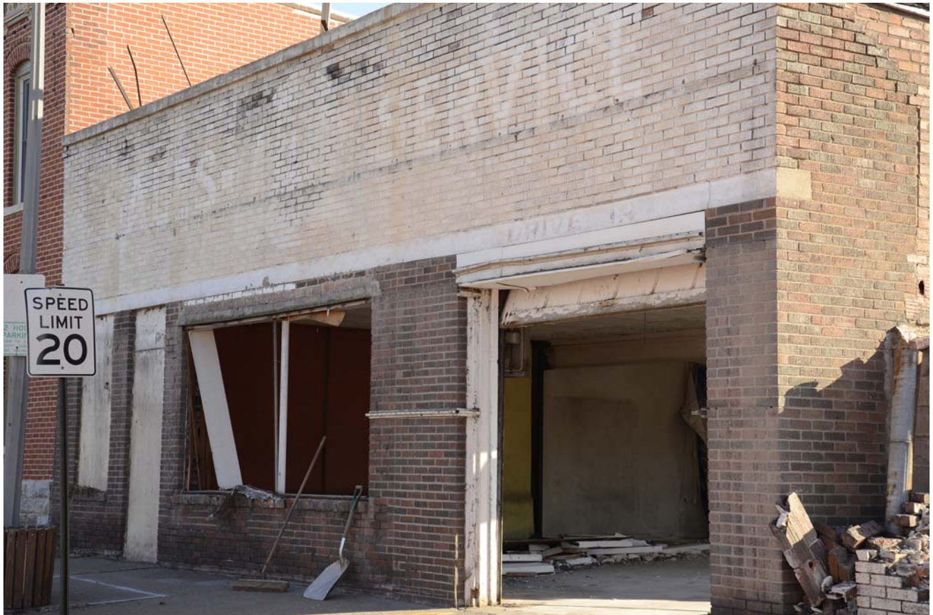
Photograph 92-00612-003 - North elevation of 215-217 W. Washington, looking southeast (December 2, 2010)