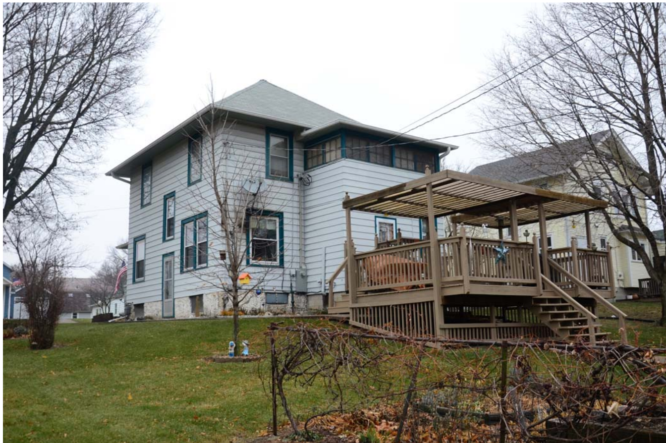
Photograph 92-00754-003 - House, looking northeast (December 2014)