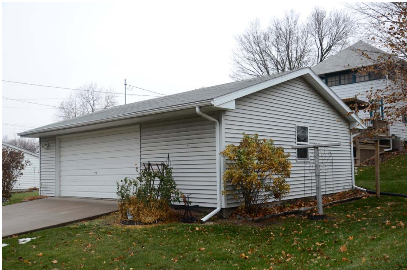
Photograph 92-00754-004 - Garage, looking northwest (December 2014)