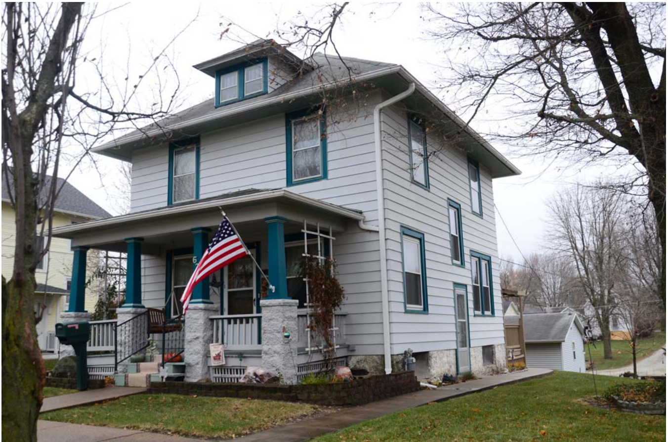
Photograph 92-00754-001 - House, looking southeast (December 2014)