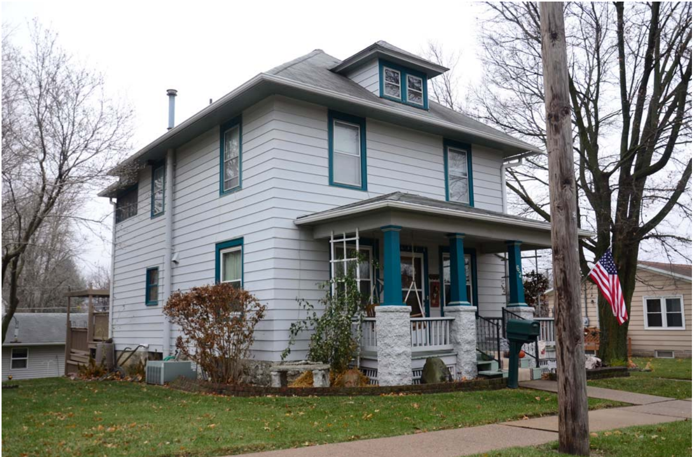
Photograph 92-00754-002 - House, looking southwest (December 2014)