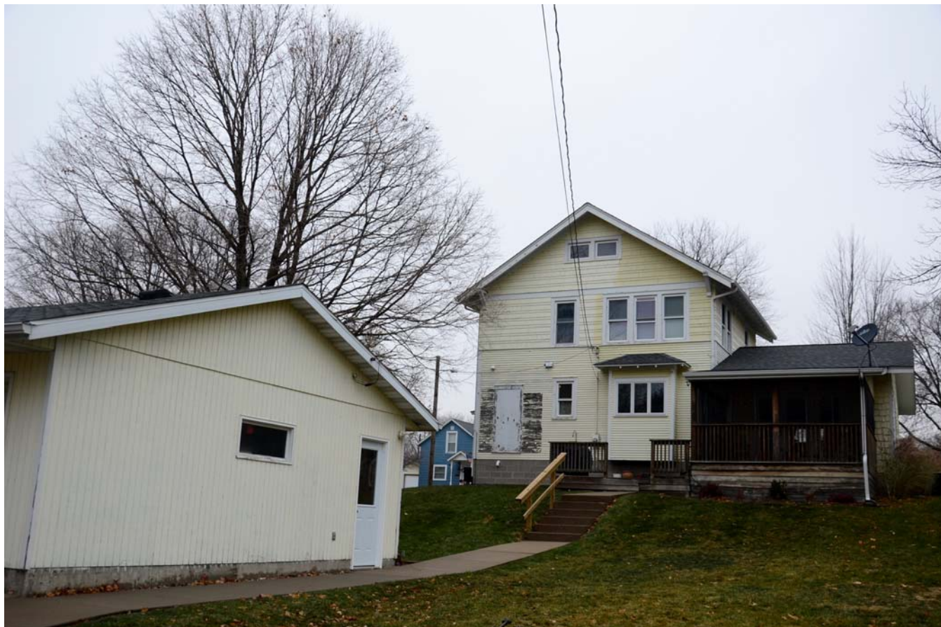
Photograph 92-00753-004 - House and garage, looking northwest (December 2014)