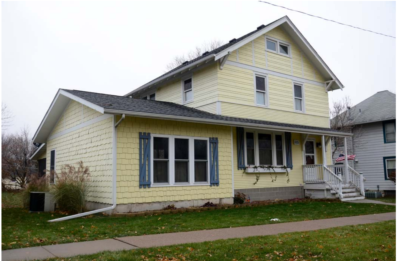
Photograph 92-00753-002 - House, looking southwest (December 2014)