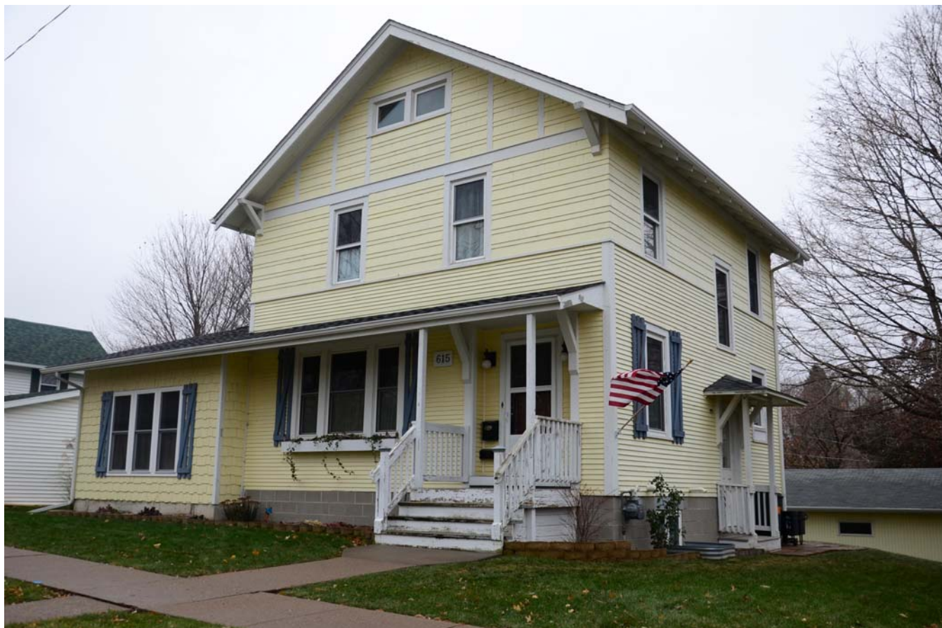
Photograph 92-00753-001 - House, looking southeast (December 2014)