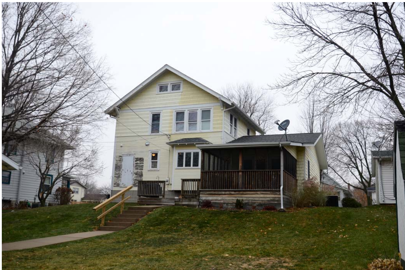
Photograph 92-00753-003 - House, looking northwest (December 2014)