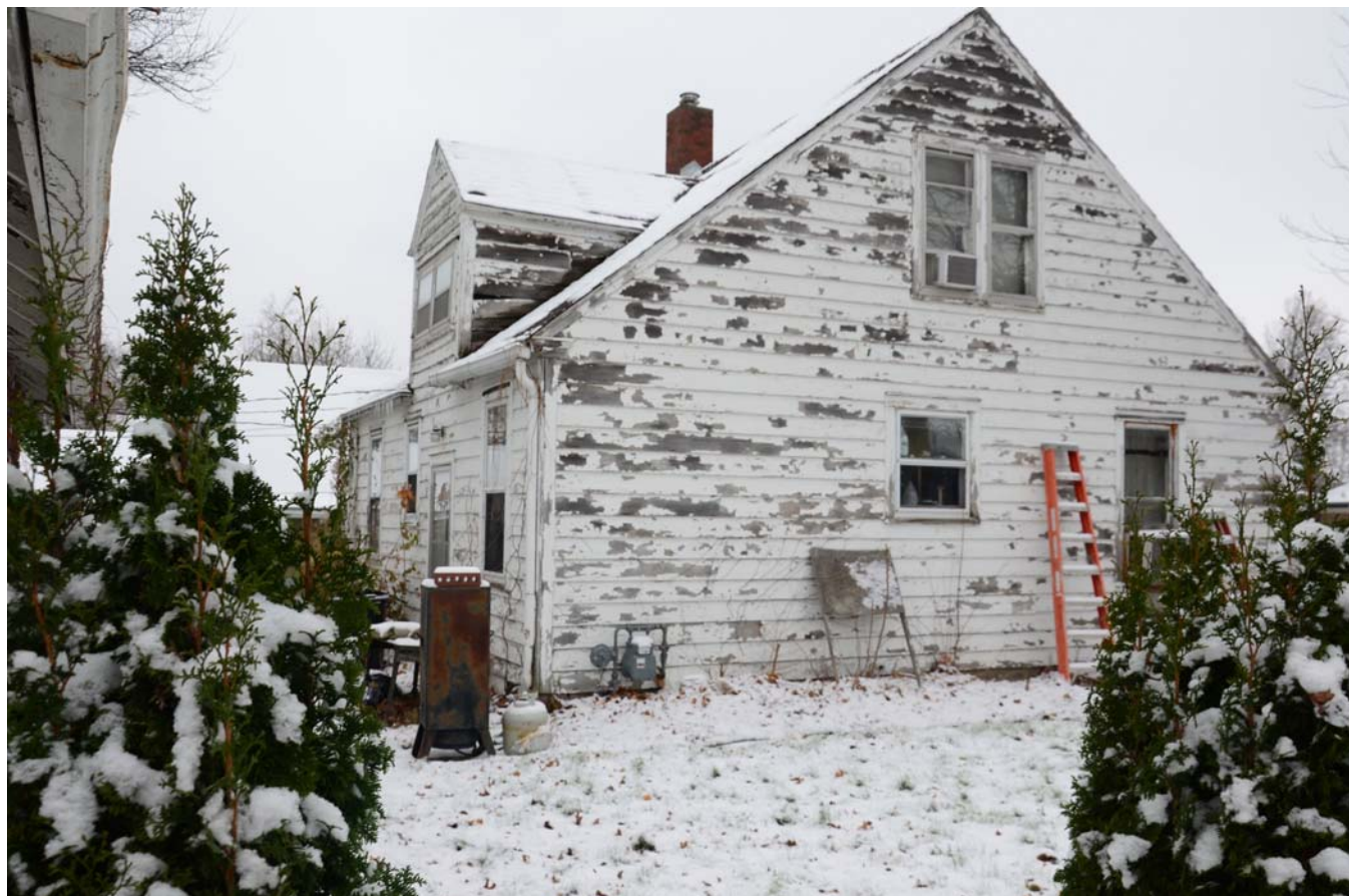
Photograph 92-00728-002 - House, looking west (December 2014)