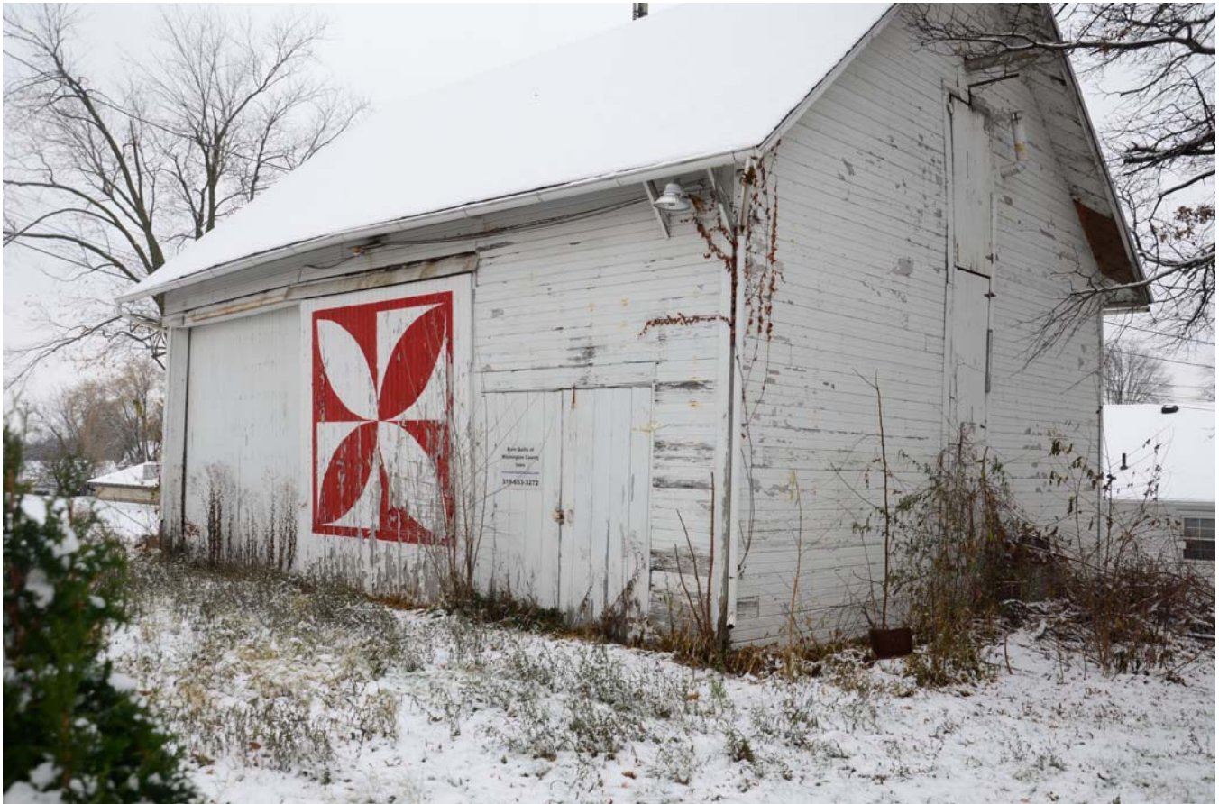
Photograph 92-00728-005 - Outbuilding, looking southwest (December 2014)