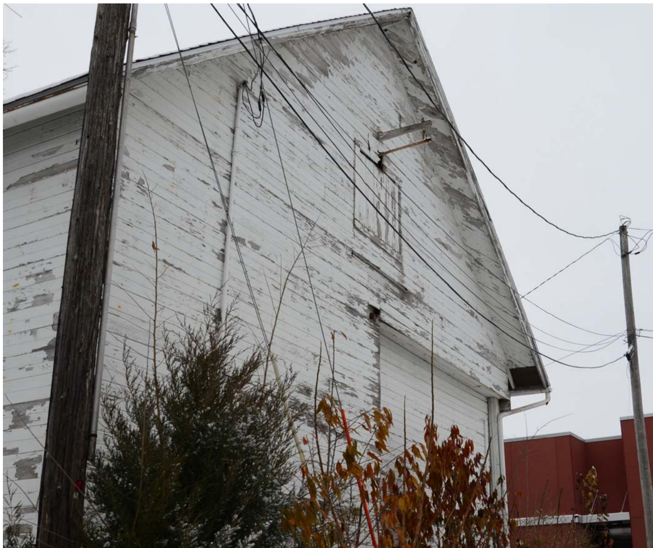
Photograph 92-00728-006 - Outbuilding, looking northeast (December 2014)