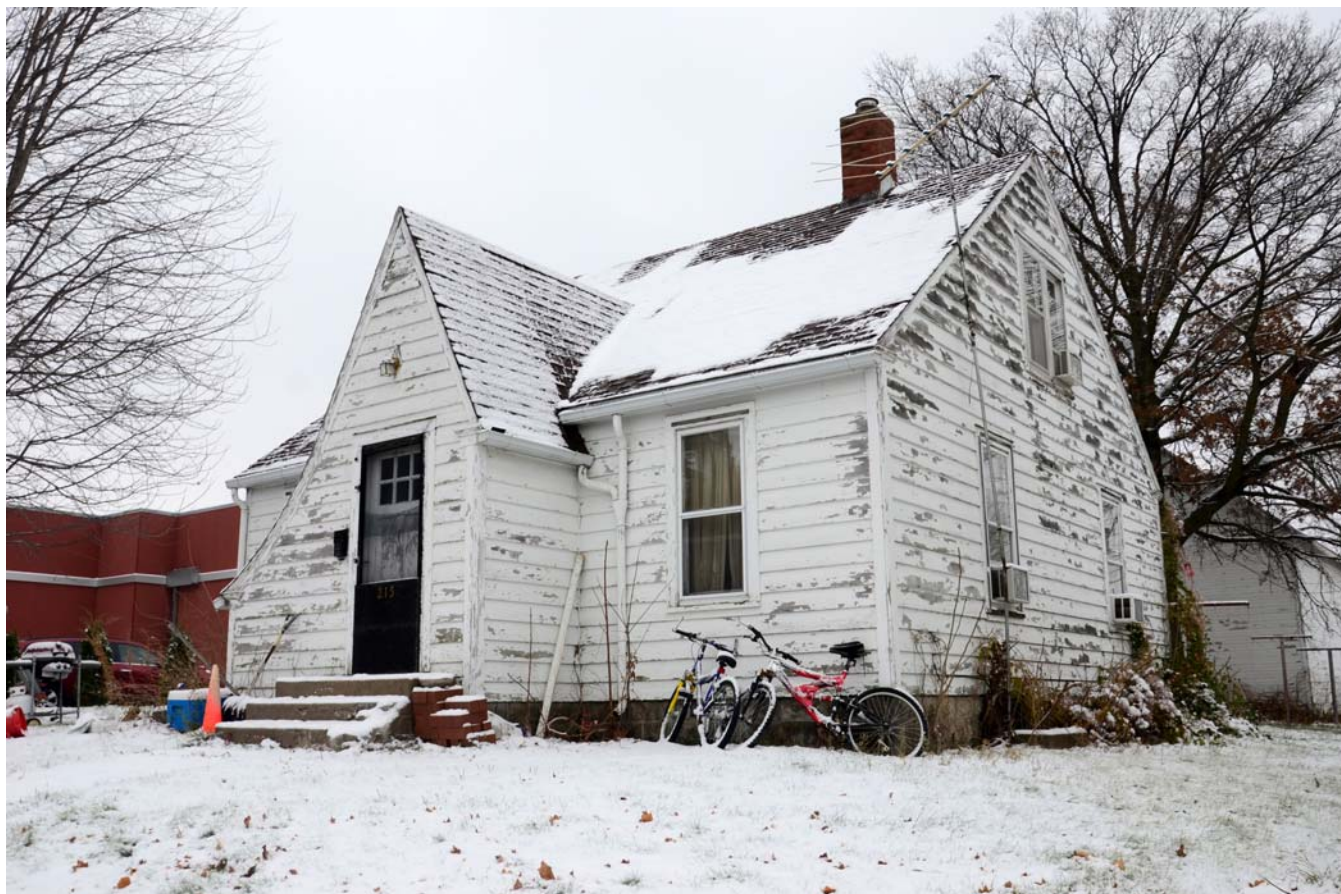
Photograph 92-00728-001 - House, looking southeast (December 2014)