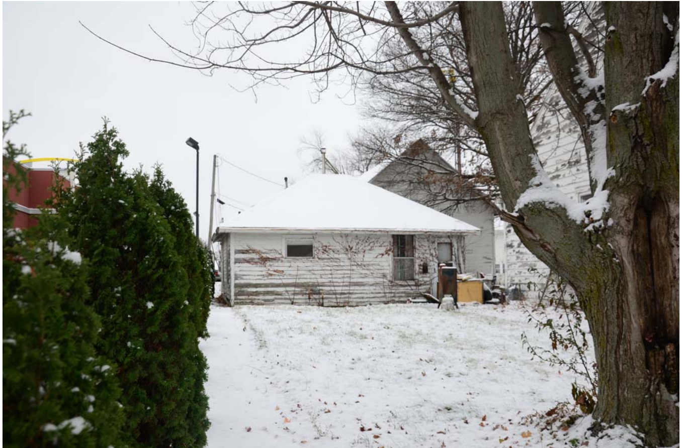
Photograph 92-00728-004 - Smaller house, looking south (December 2014)