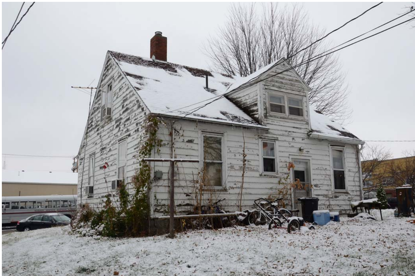
Photograph 92-00728-003 - House, looking northeast (December 2014)