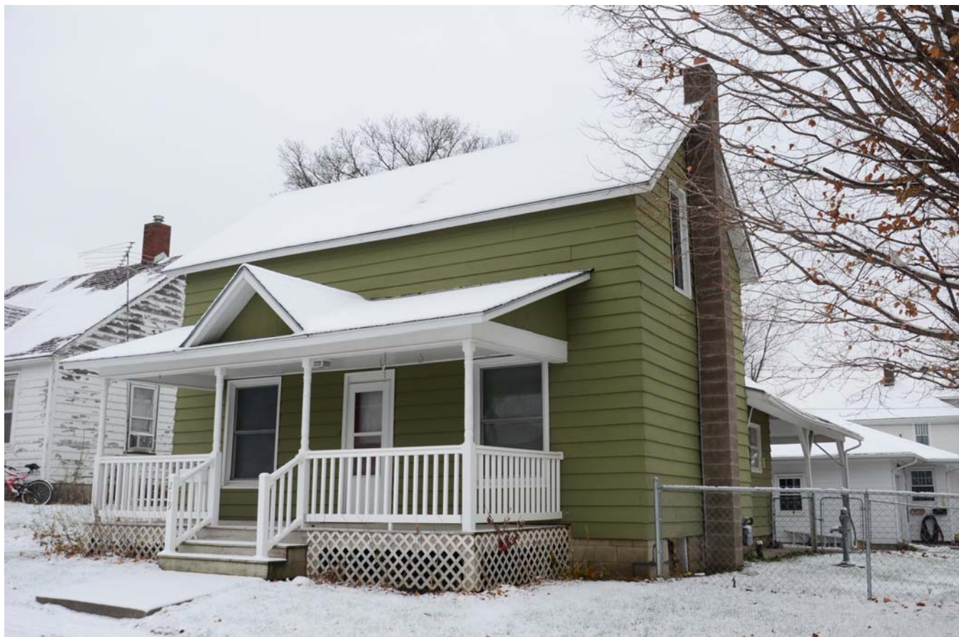
Photograph 92-00006-001 - House, looking southeast (December 2014)