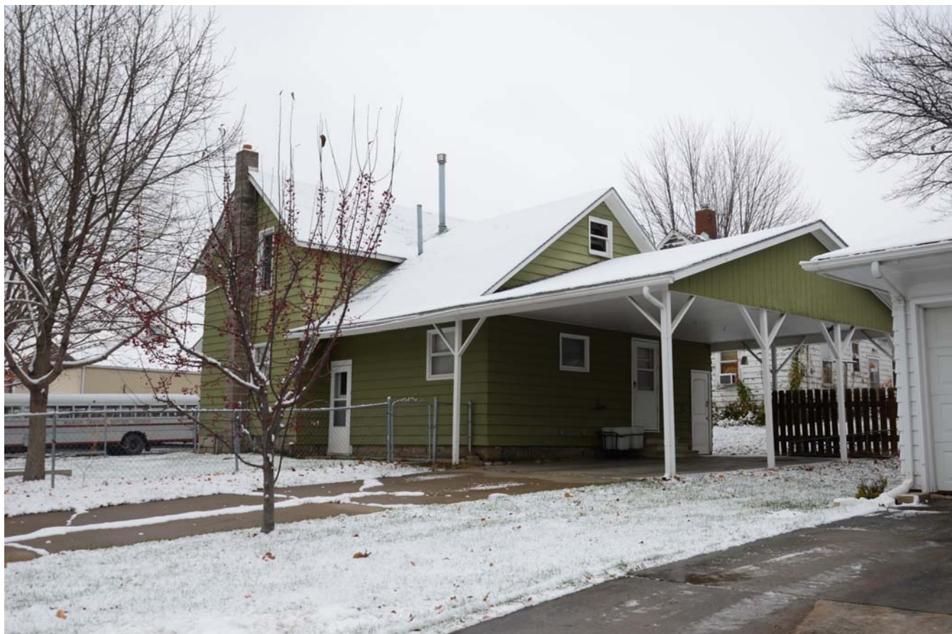
Photograph 92-00006-003 - House, looking northeast (December 2014)