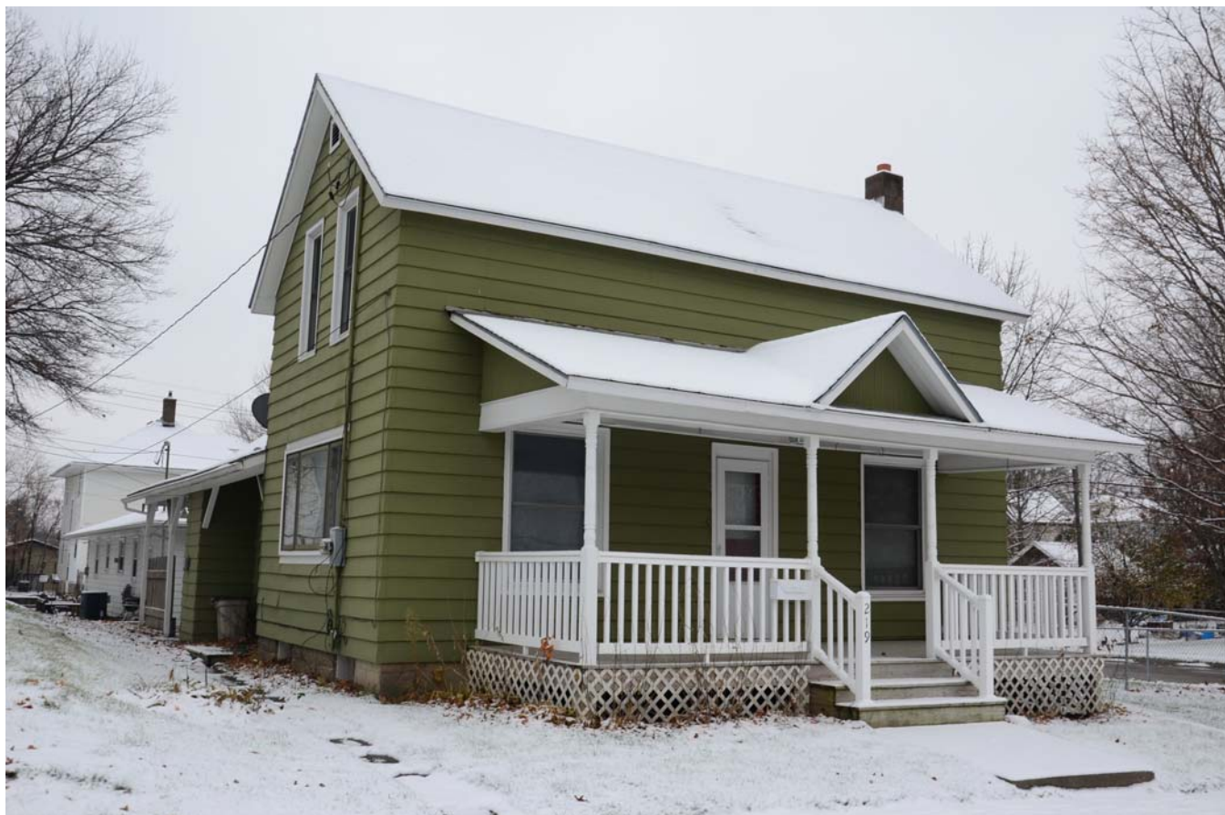
Photograph 92-00006-002 - House, looking southeast (December 2014)