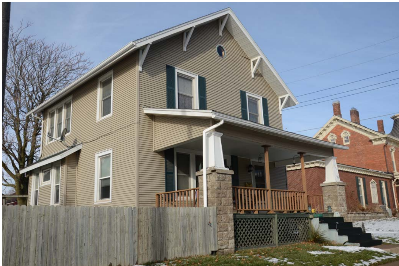
Photograph 92-00757-002 - House, looking northwest (December 2014)