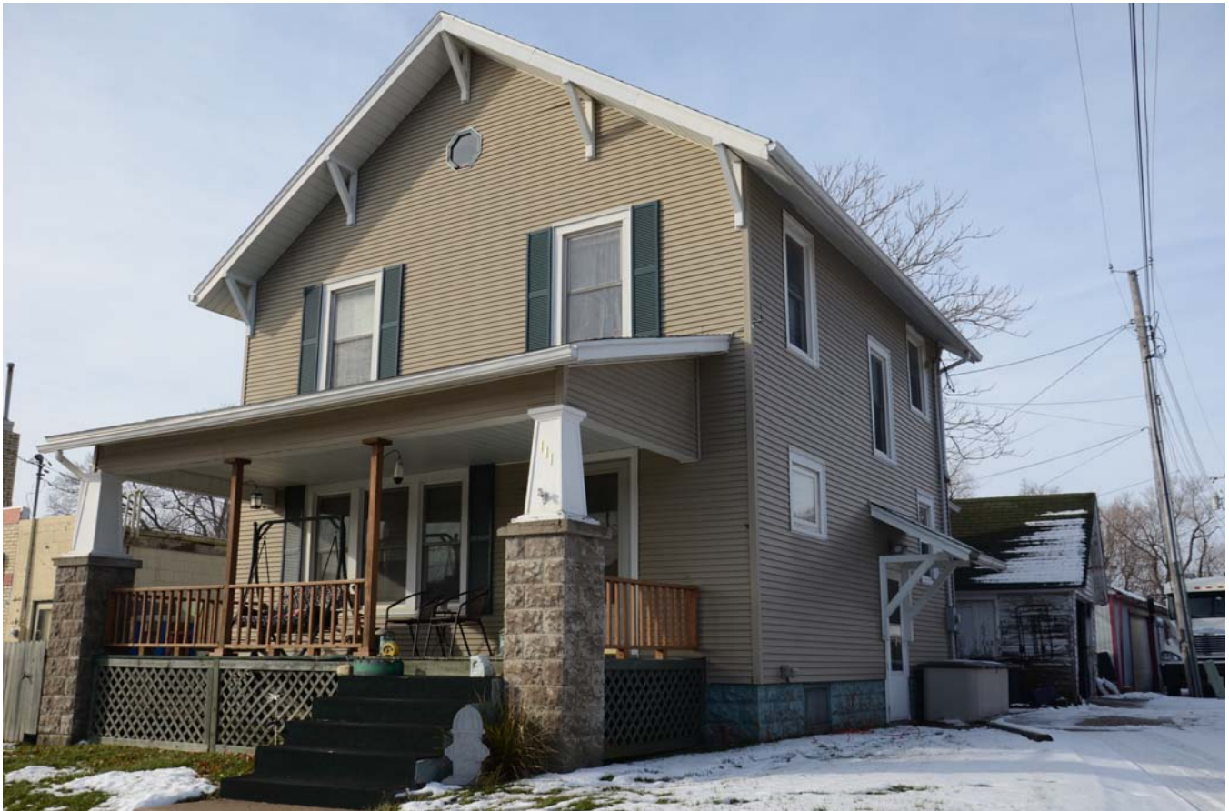
Photograph 92-00757-001 - House, looking southwest (December 2014)