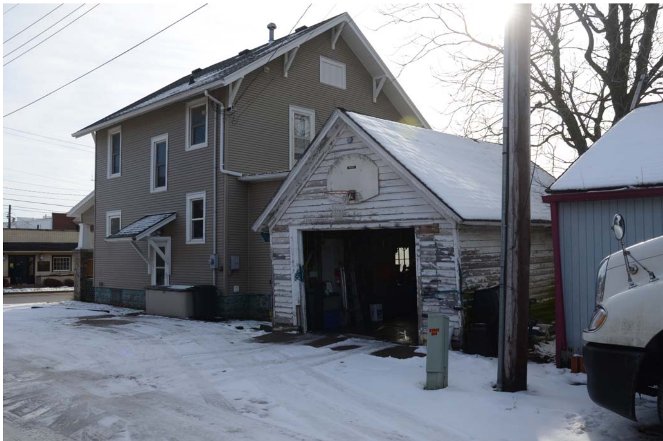
Photograph 92-00757-003 - House, looking southeast (December 2014)