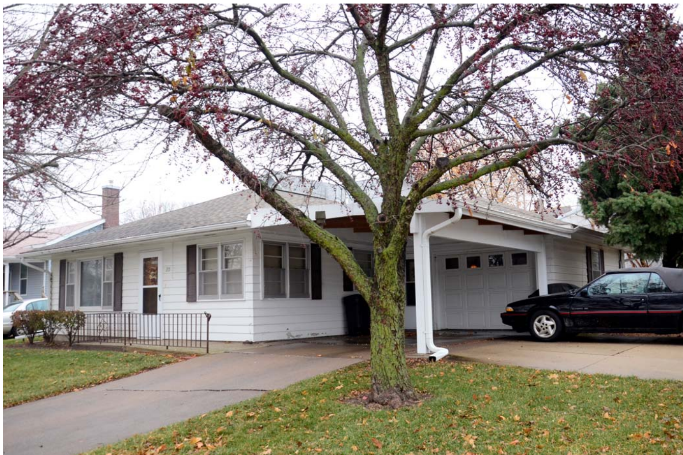
Photograph 92-00730-002 - House, looking southwest (December 2014)