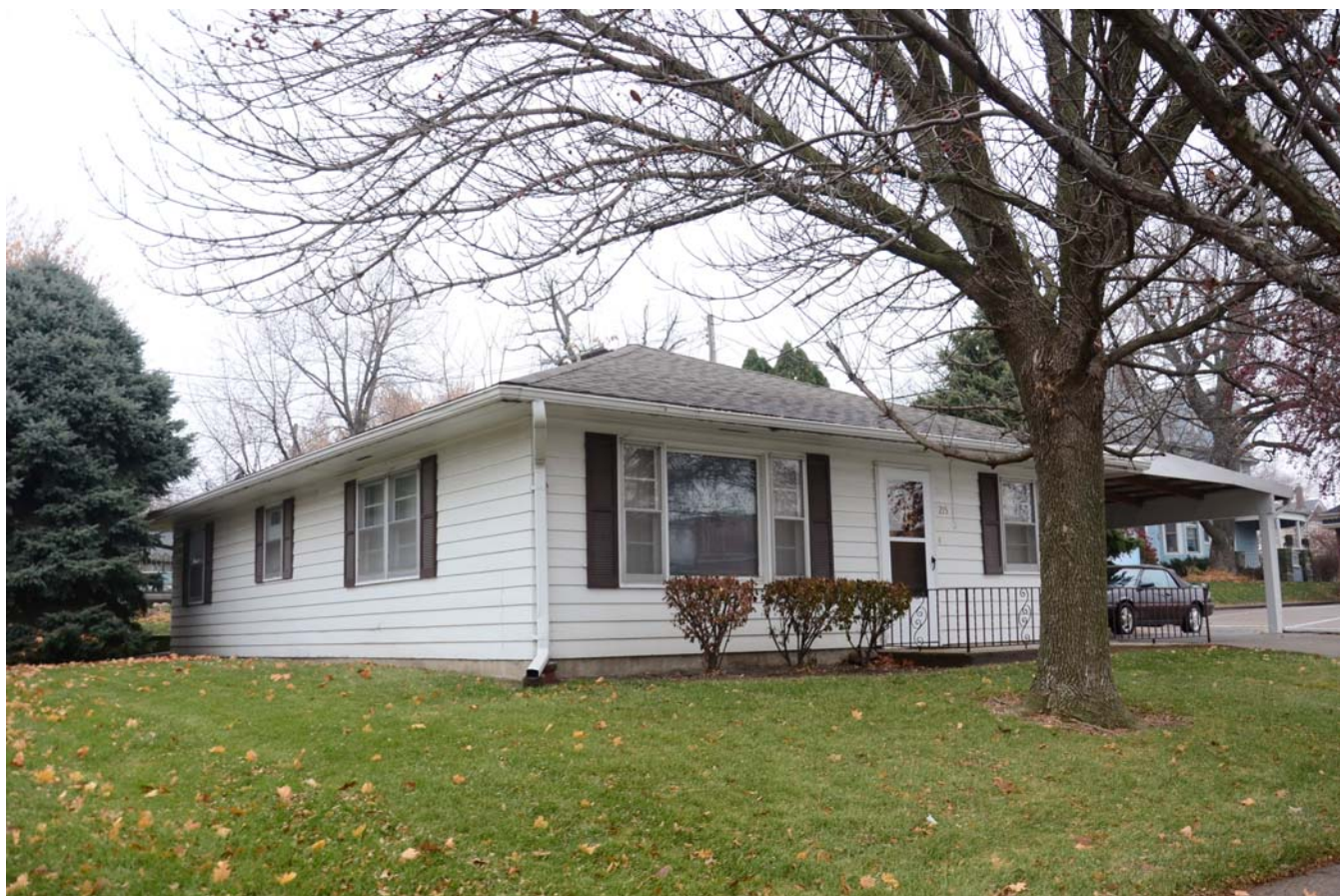
Photograph 92-00730-001 - House, looking northwest (December 2014)