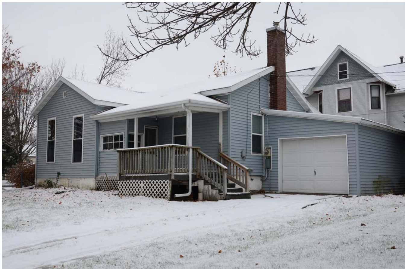
Photograph 92-00459-003 - House, looking northeast (December 2014)