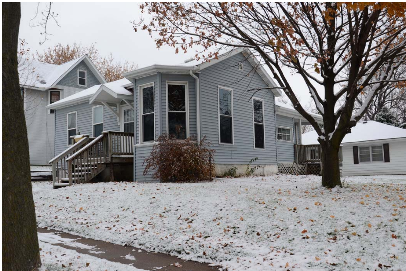
Photograph 92-00459-002 - House, looking southeast (December 2014)