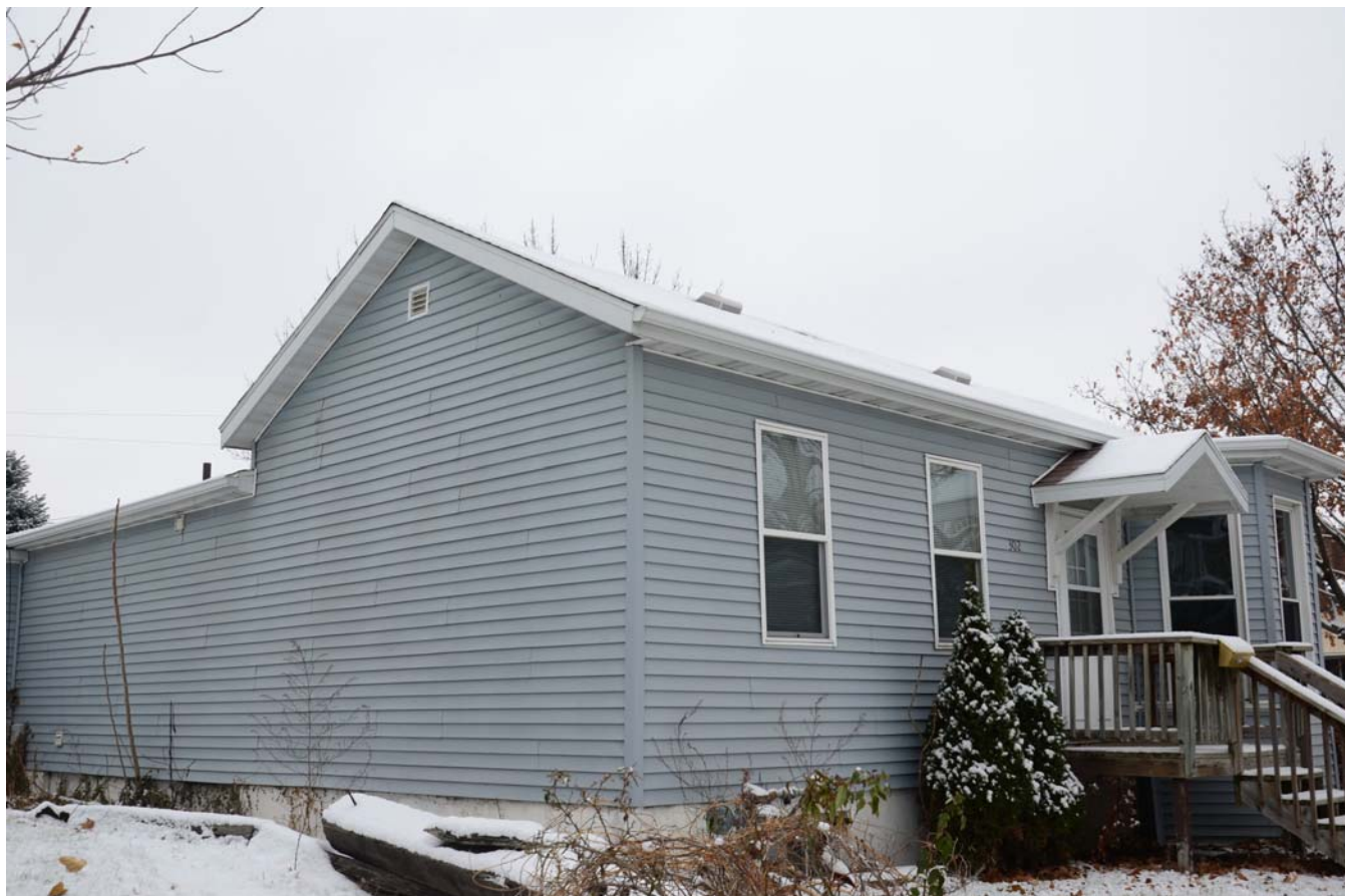
Photograph 92-00459-001 - House, looking southwest (December 2014)