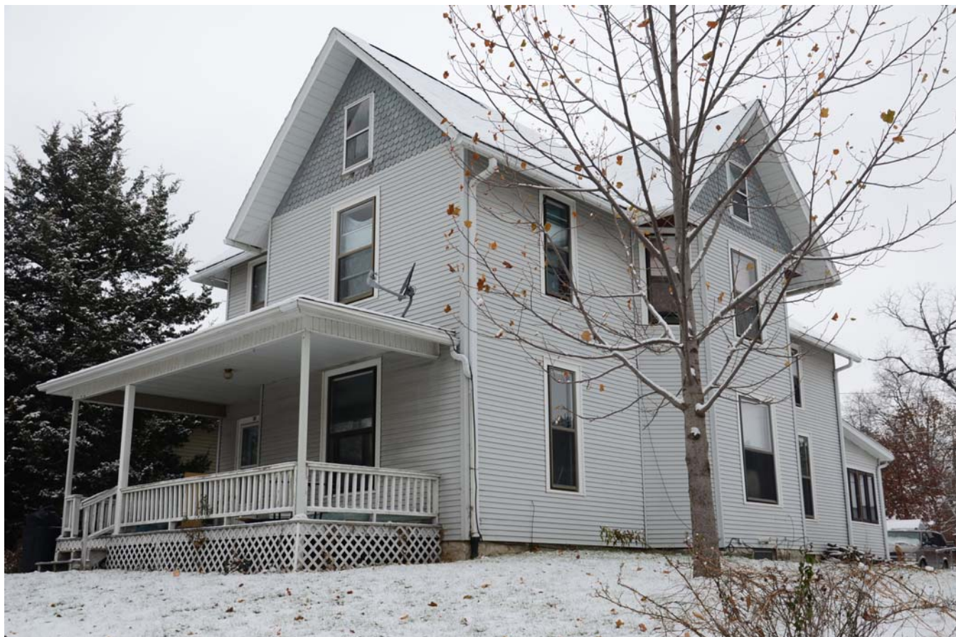
Photograph 92-00159-002 - House, looking northwest (December 2014)