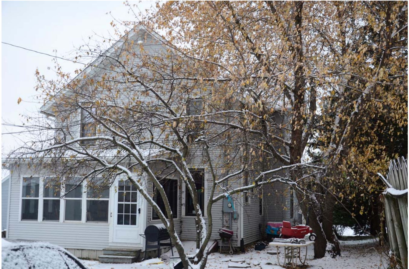
Photograph 92-00159-003 - House, looking southeast (December 2014)