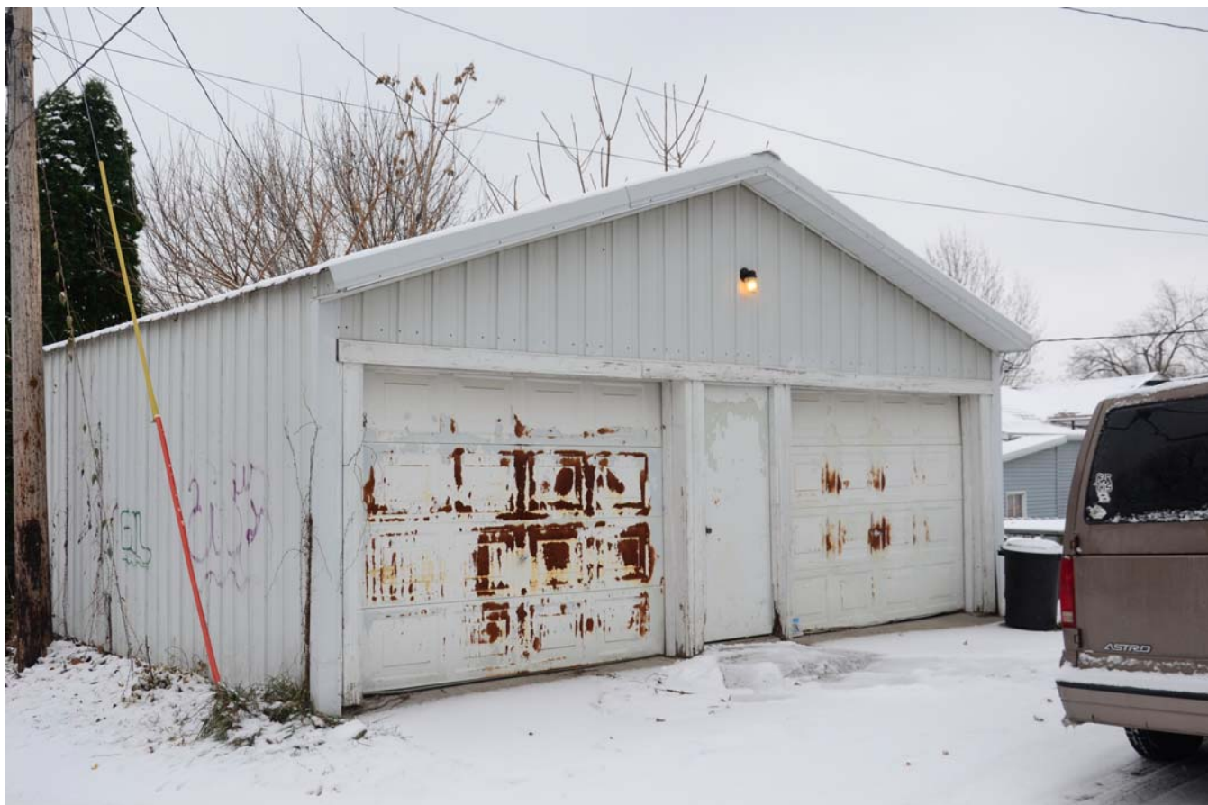
Photograph 92-00159-004 - Garage, looking southeast (December 2014)