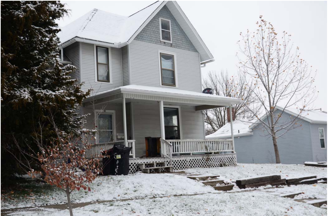
Photograph 92-00159-001 - House, looking northeast (December 2014)