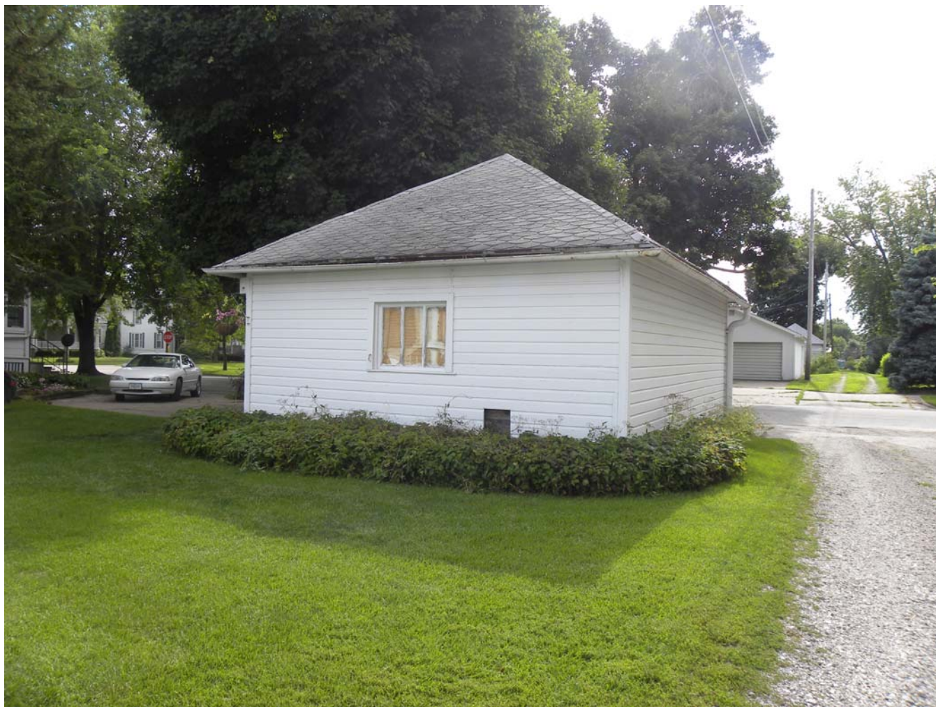
Photograph 92-00384-005 - Garage, looking west (July 2015)