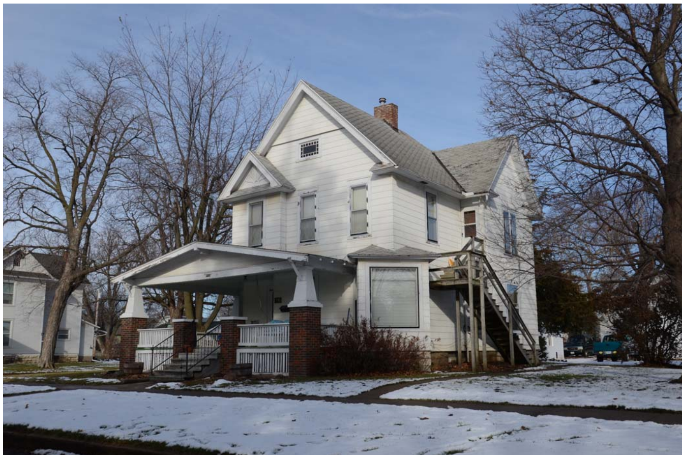
Photograph 92-00384-002 - House, looking northwest (December 2014)