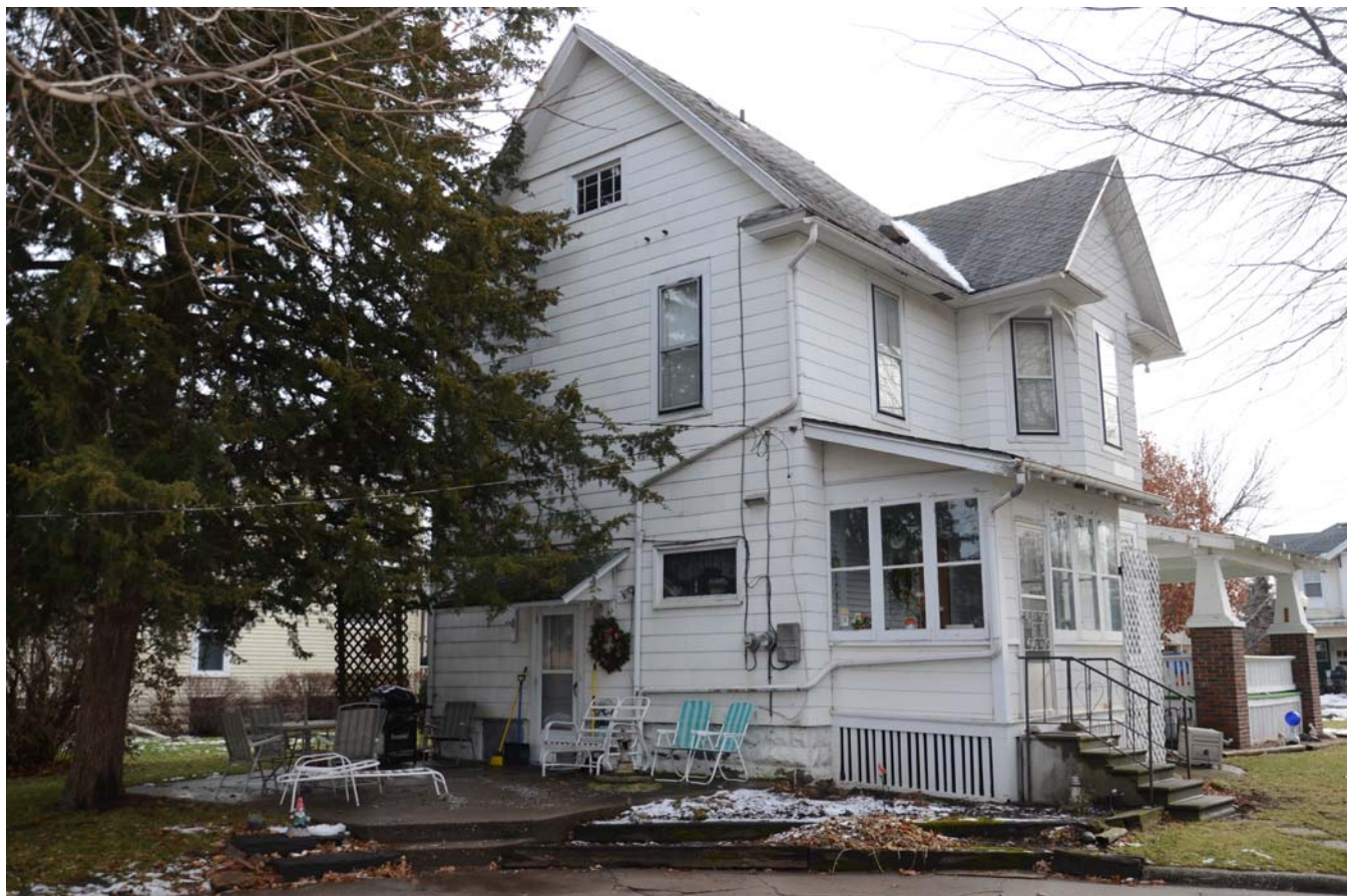
Photograph 92-00384-003 - House, looking southeast (December 2014)