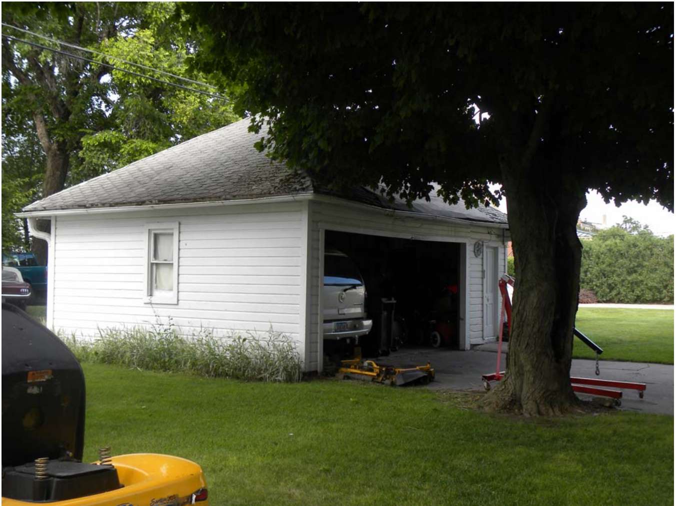
Photograph 92-00384-004 - Garage, looking northeast (July 2015)