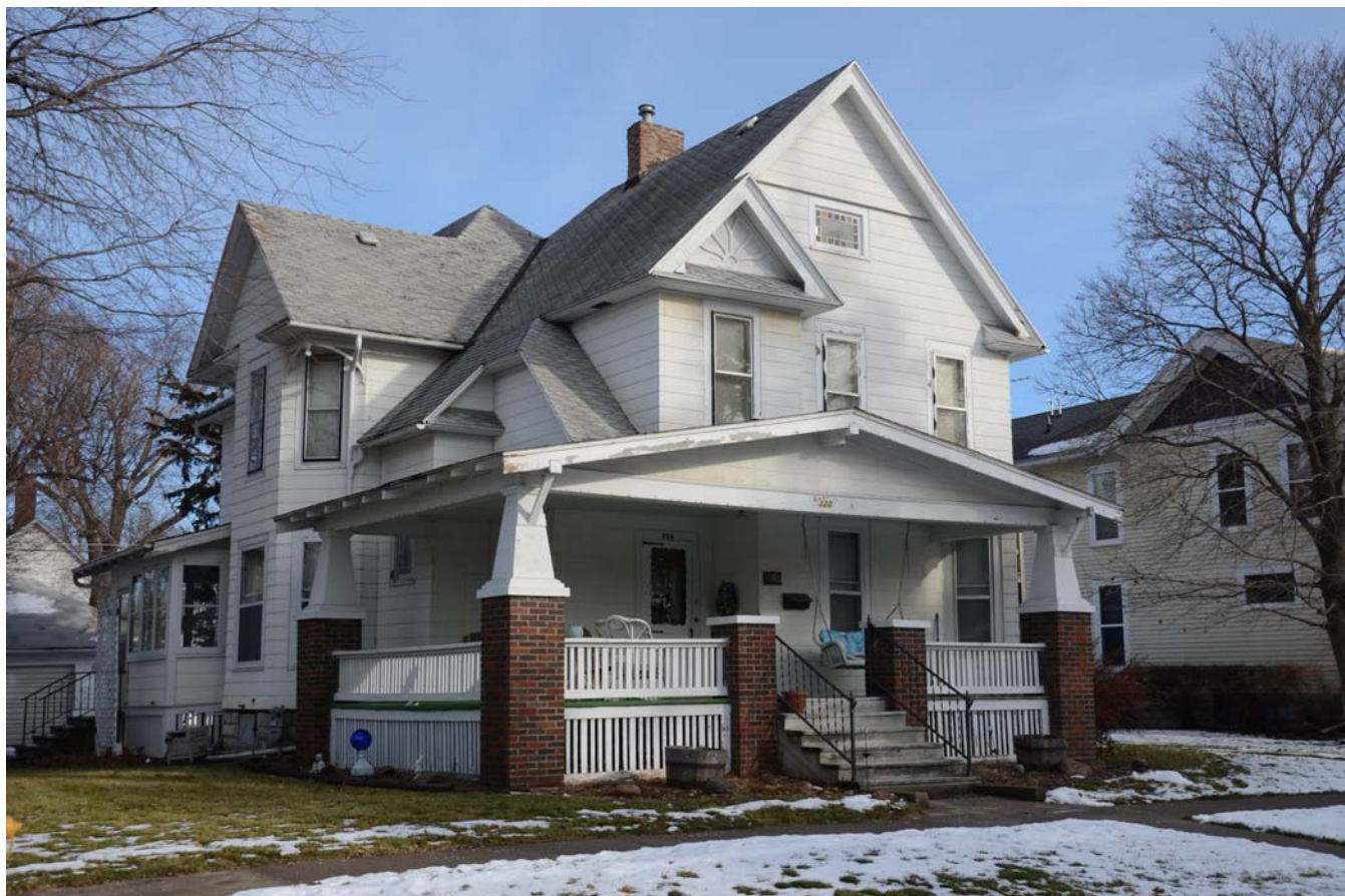
Photograph 92-00384-001 - House, looking northeast (December 2014)