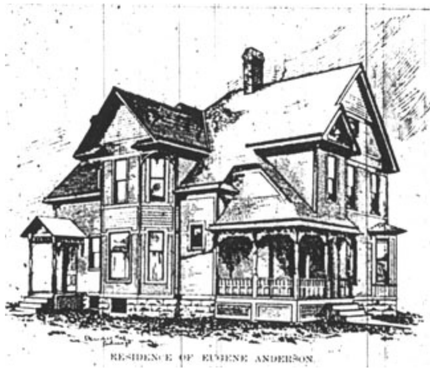
Washington Gazette, January 6, 1893