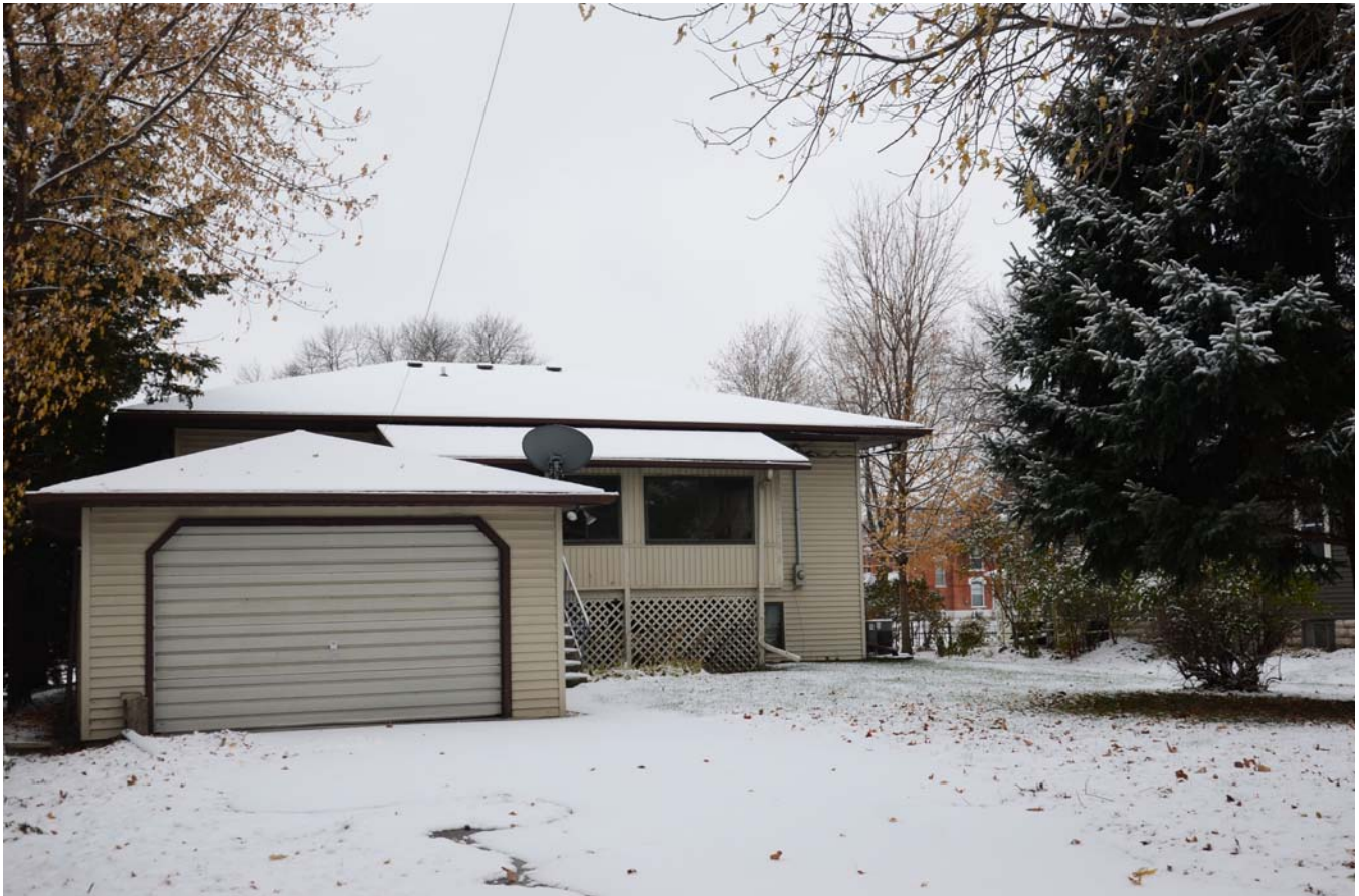
Photograph 92-00731-003 - Garage, looking south (December 2014)