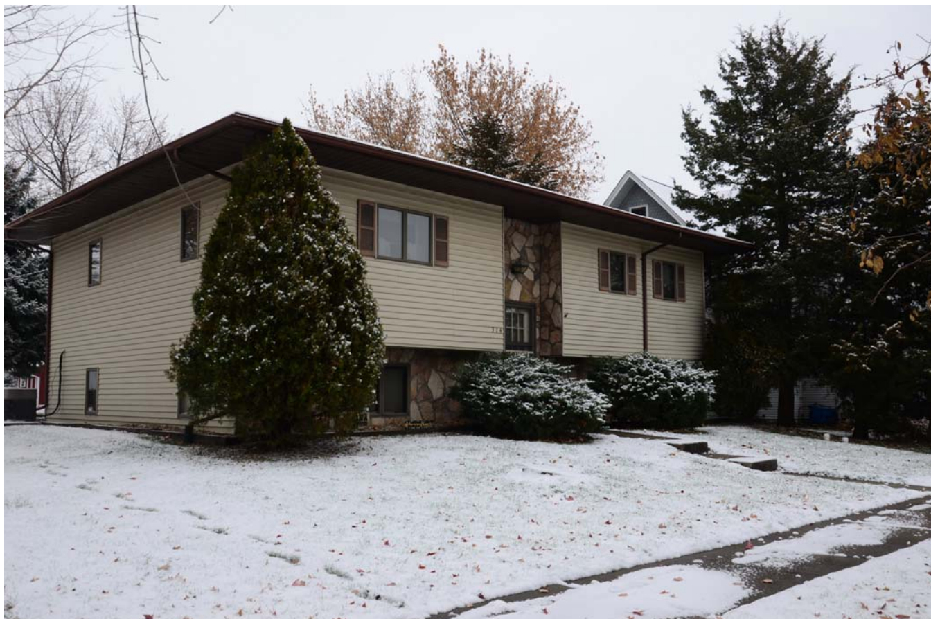
Photograph 92-00731-001 - House, looking northeast (December 2014)