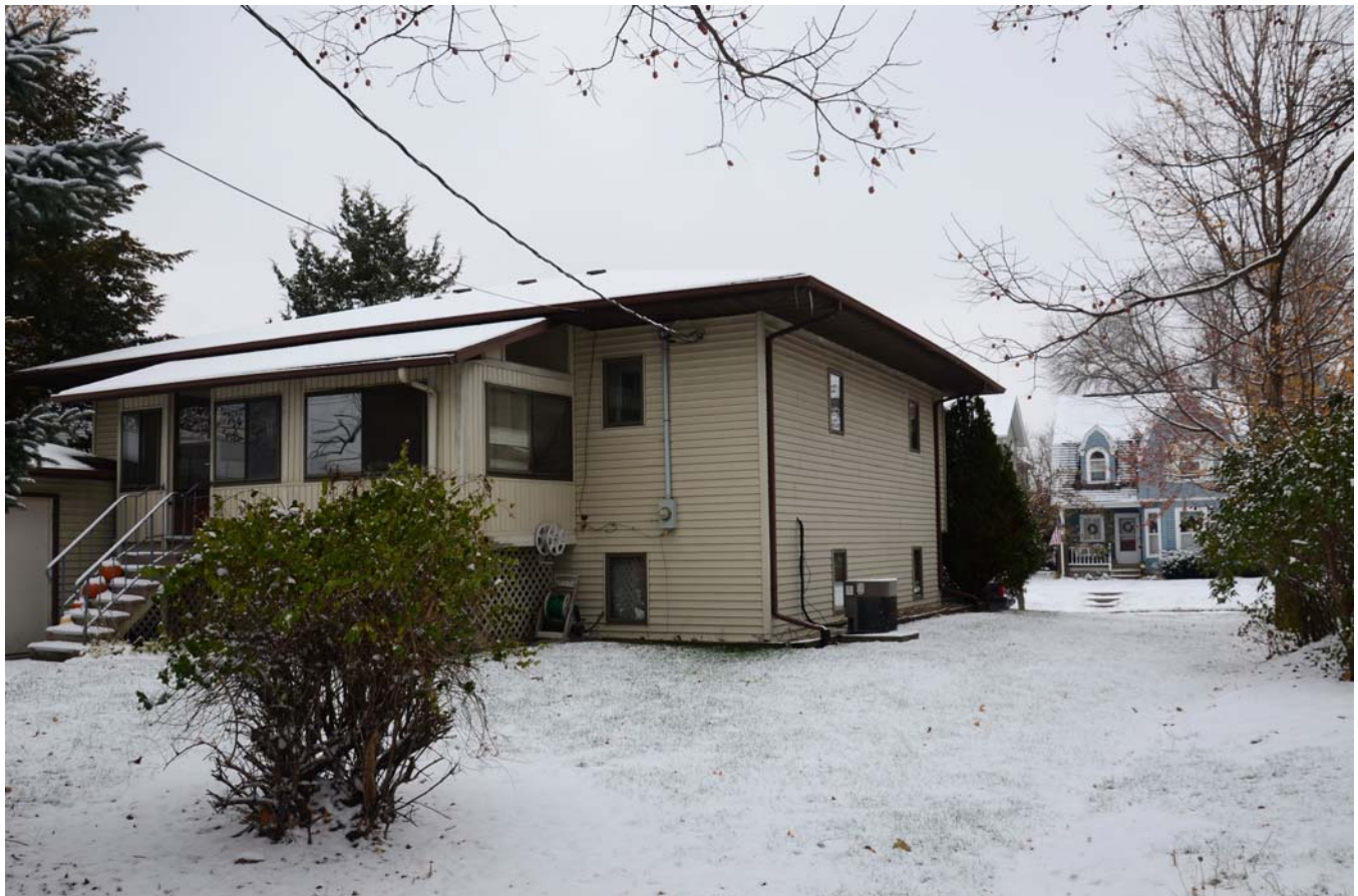
Photograph 92-00731-002 - House, looking southeast (December 2014)