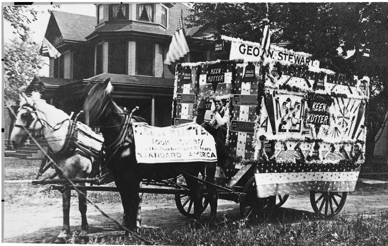
House in background, undated photo