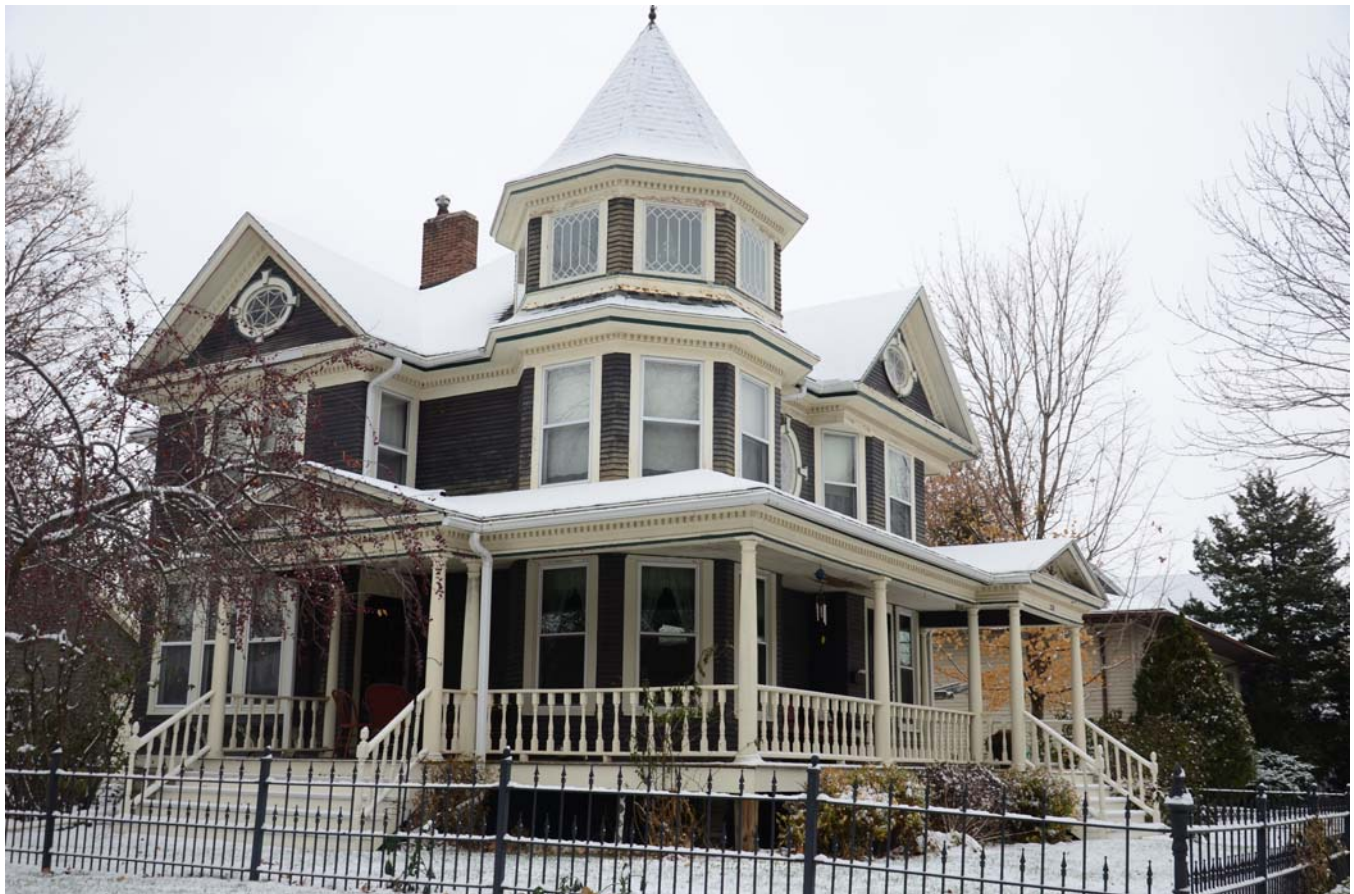
Photograph 92-00424-002 - House, looking northeast (December 2014)