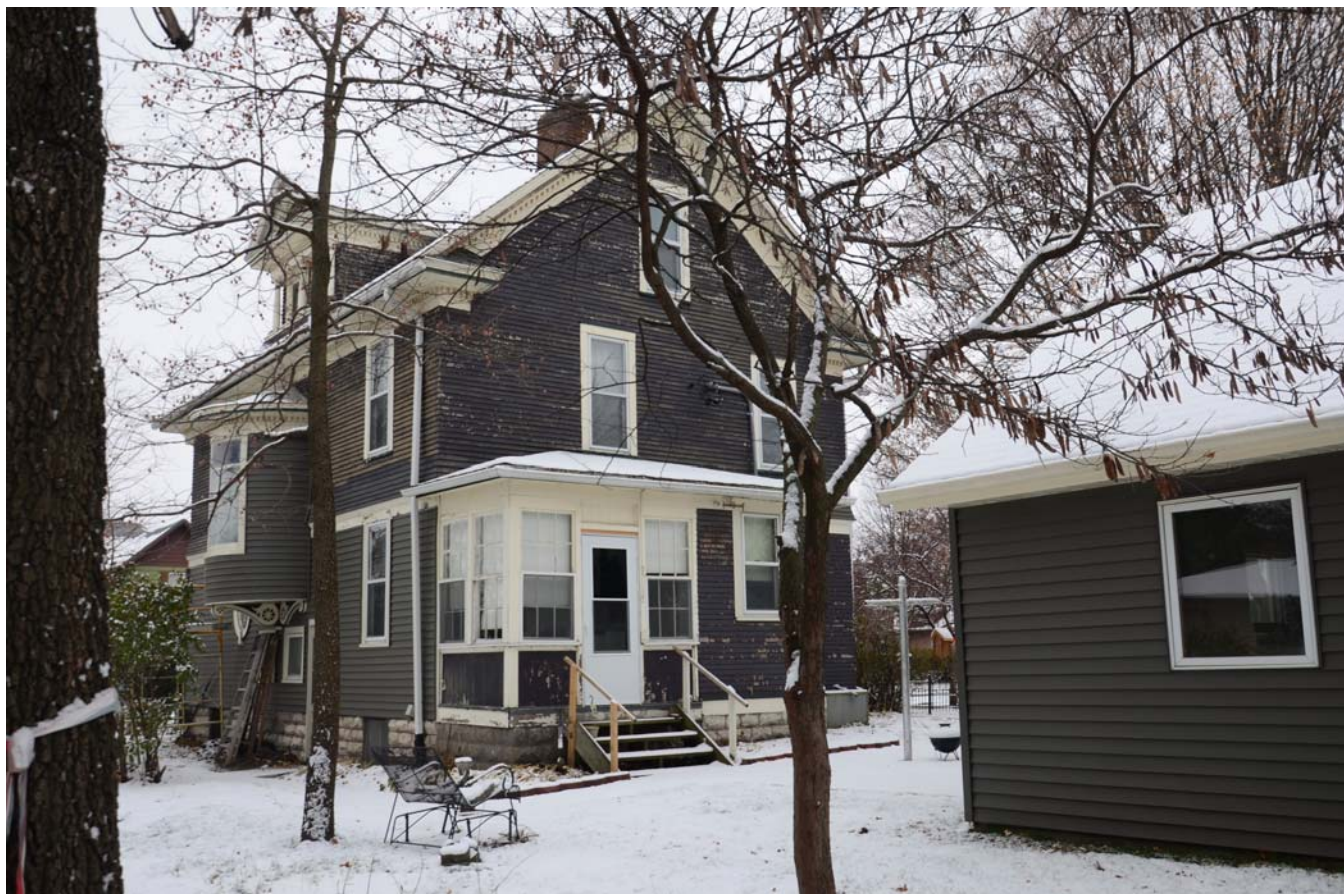
Photograph 92-00424-005 - House, looking southwest (December 2014)