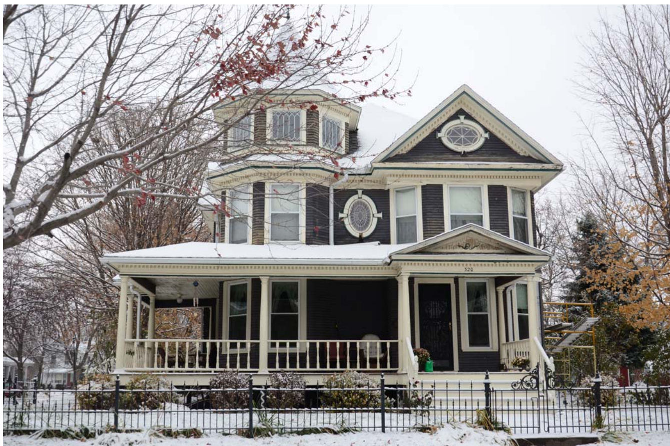
Photograph 92-00424-001 - House, looking north (December 2014)