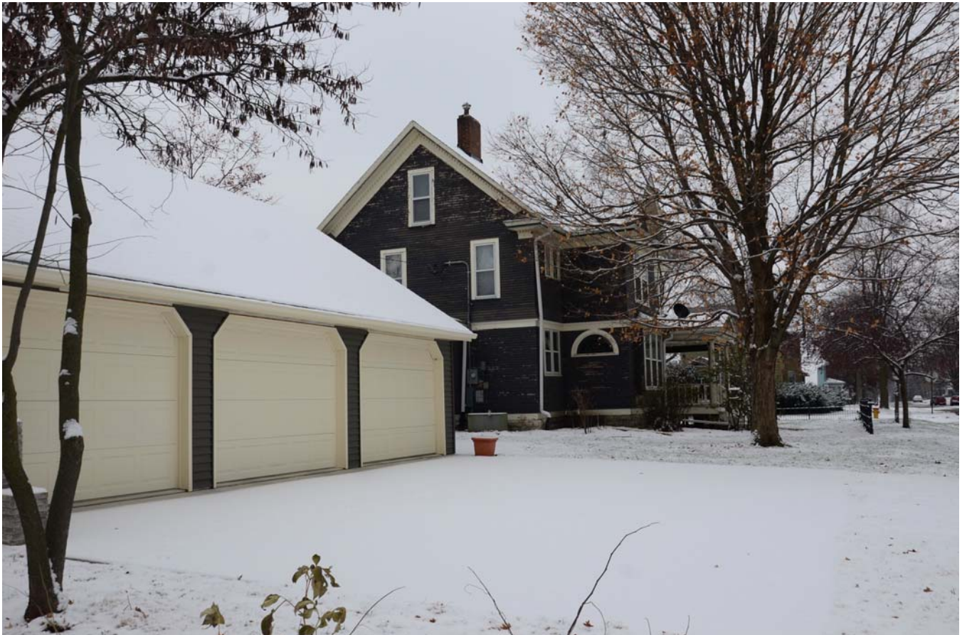
Photograph 92-00424-007 - Garage, looking southeast (December 2014)