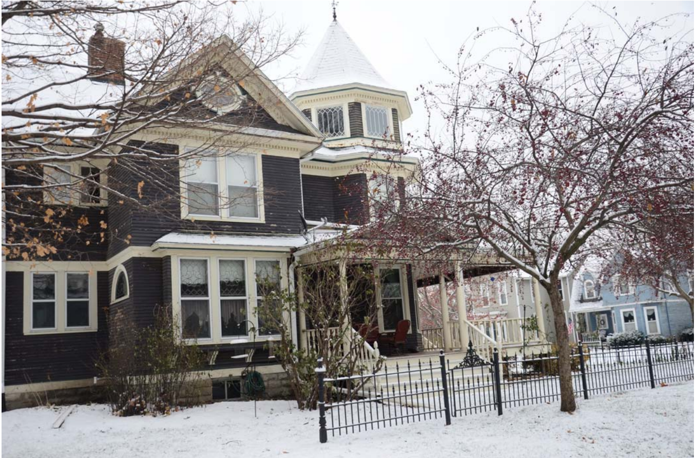
Photograph 92-00424-003 - House, looking southeast (December 2014)