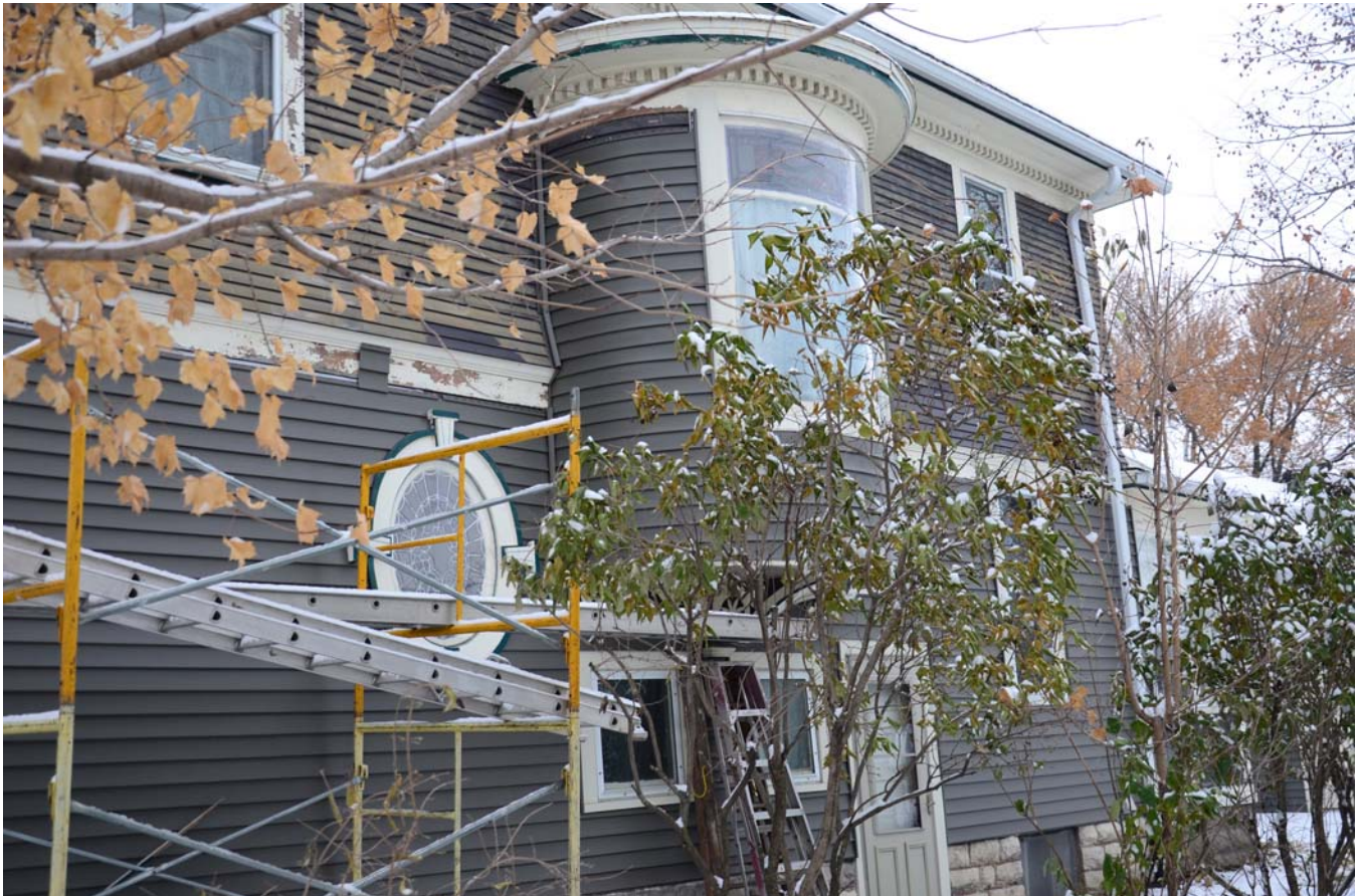
Photograph 92-00424-004 - House, looking northwest (December 2014)