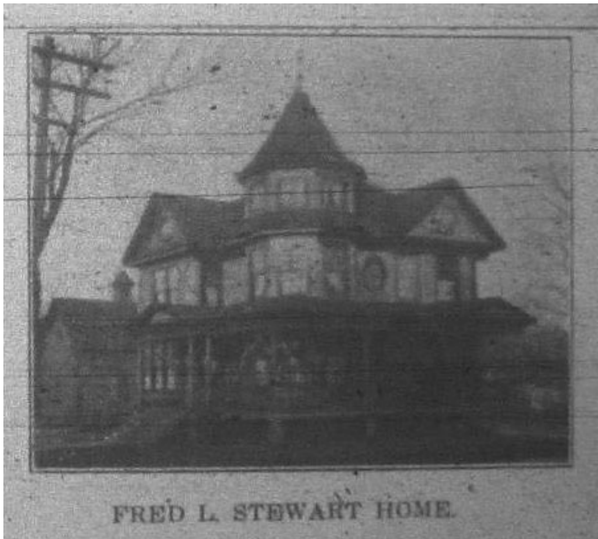
Evening Journal, April 26, 1913, page 4