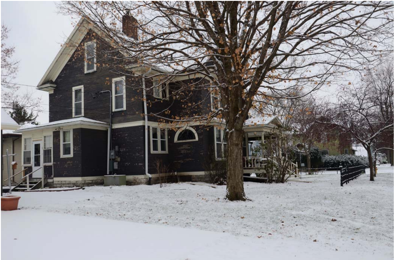
Photograph 92-00424-006 - House, looking southeast (December 2014)