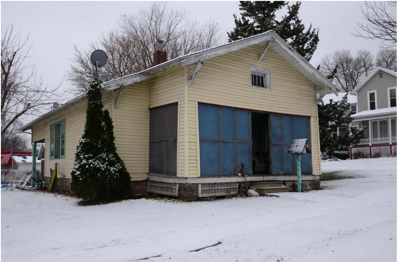
Photograph 92-00732-001 - House, looking southwest (December 2014)