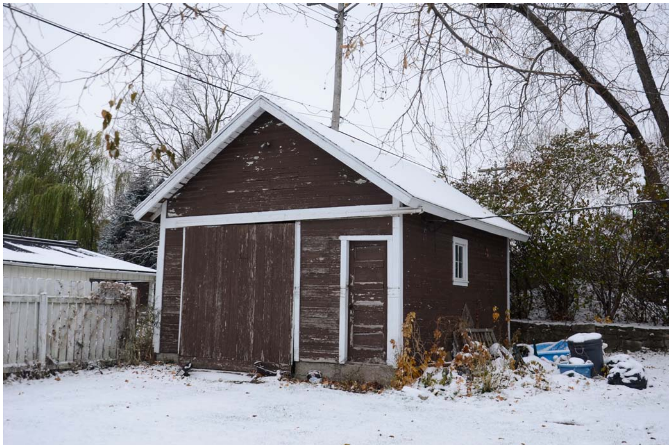
Photograph 92-00732-003 - Garage, looking southwest (December 2014)