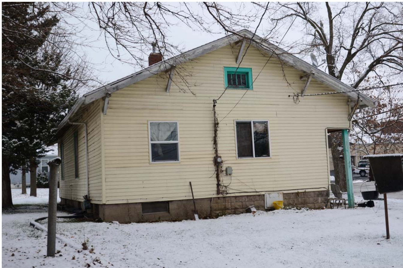
Photograph 92-00732-002 - House, looking north (December 2014)